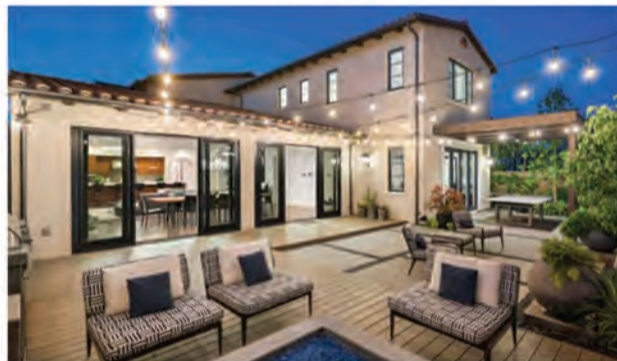
CONTEMPORARY OASIS 116 Homecoming | Irvine $2,498,800