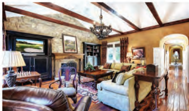
NEWLY TRANSFORMED 5 Padre Place | Ladera Ranch $1,599,000