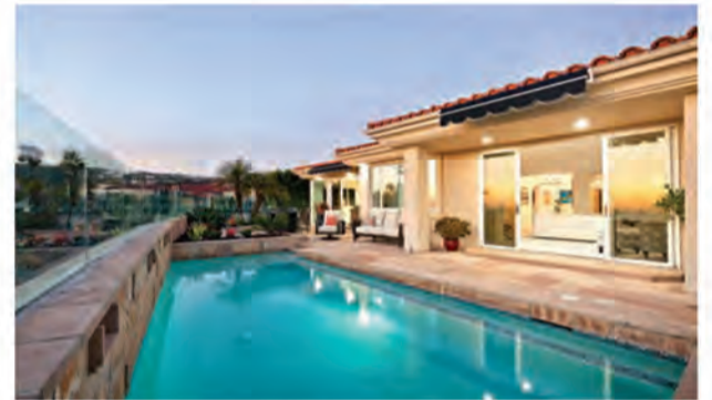
PRICE IMPROVEMENT 44 Ritz Cove Drive | Dana Point $4,795,000