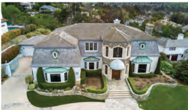
PRICE IMPROVEMENT 30936 Steeplechase Drive | San Juan Capistrano $2,199,000