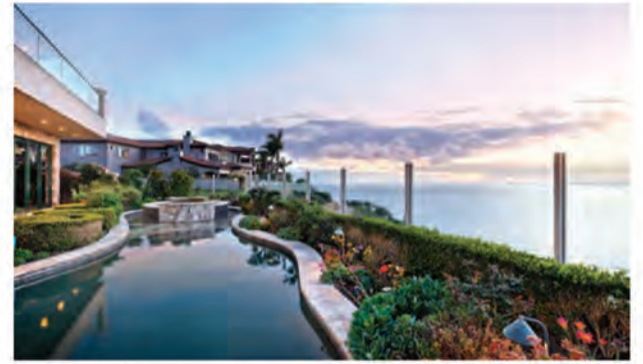
PANORAMIC OCEAN VIEWS 31871 Monarch Crest | Laguna Niguel $7,988,000