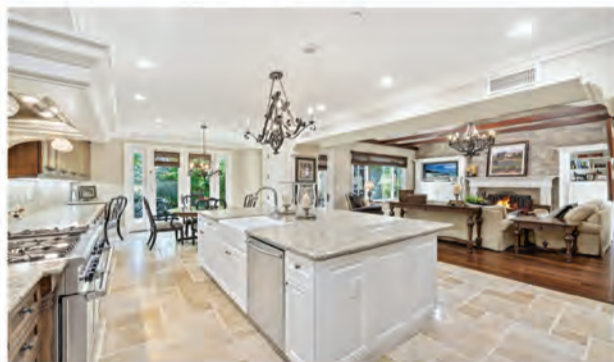
NEWLY TRANSFORMED 5 Padre Place | Ladera Ranch $1,599,000