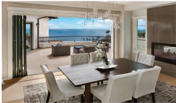
CONTEMPORARY OASIS 410 Arenoso #301 | San Clemente $3,220,000