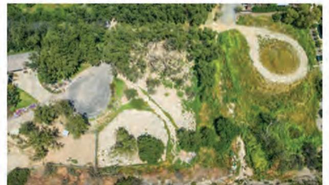
JUST LISTED | BEAUTIFUL LOT Croatia* | Modjeska Canyon $395,000