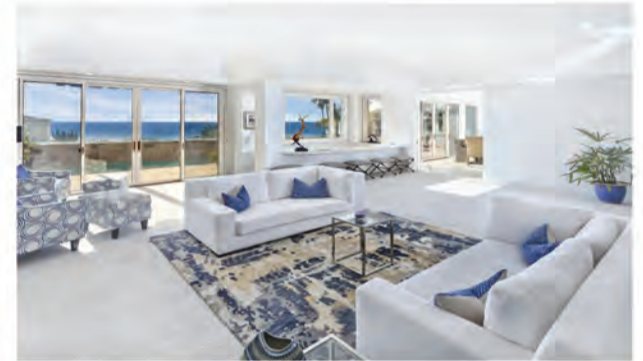
PRICE IMPROVEMENT 44 Ritz Cove Drive | Dana Point $4,795,000