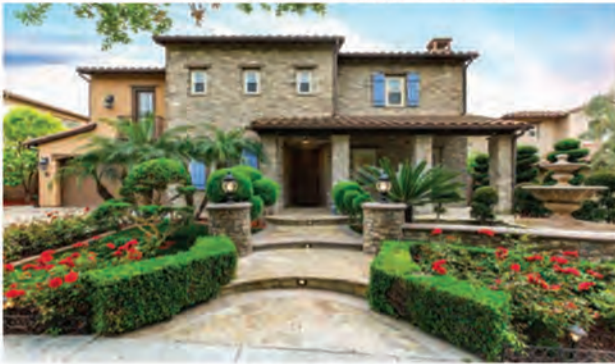
TUSCAN MASTERPIECE 31 Bell Pasture | Ladera Ranch $2,198,888

August 10 2019 10:00am - 12:00pm 6401 San Joaquin Hills Road, Newport Coast, CA 92657