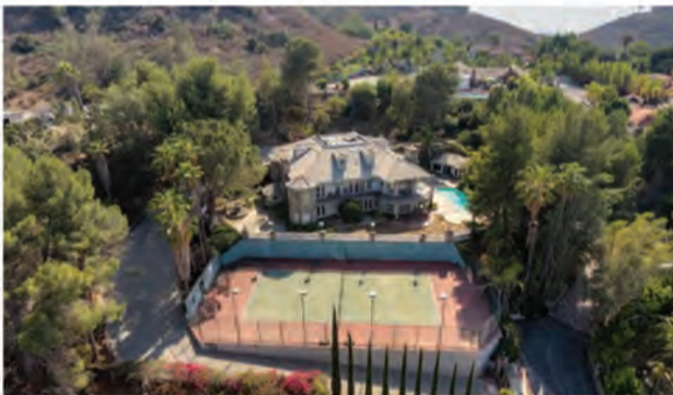
CUSTOM BUILT HOME 376 N. Chandler Ranch Road | Orange $2,800,000