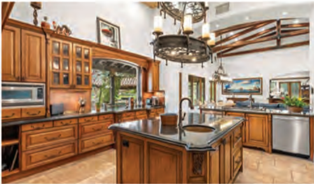
EQUESTRIAN ESTATE 27453 Ortega Highway | San Juan Capistrano $6,988,000