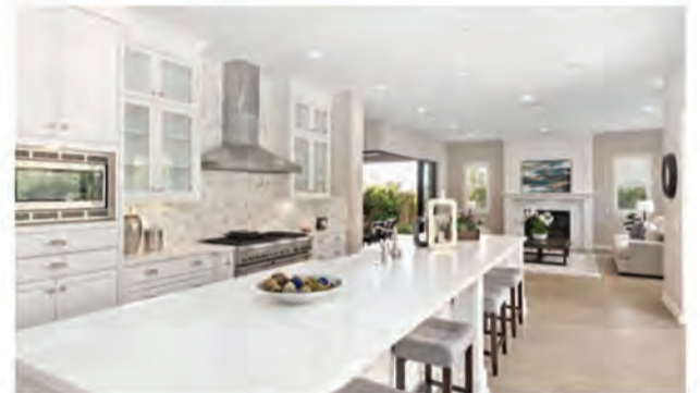
BEAUTIFUL INDOOR-OUTDOOR LIVING 115 Calderon | Irvine $2,388,000