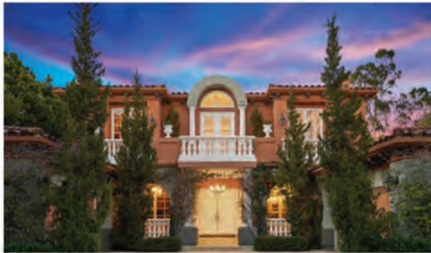
PRISTINE ESTATE 5 Seahaven | Newport Coast $4,999,000