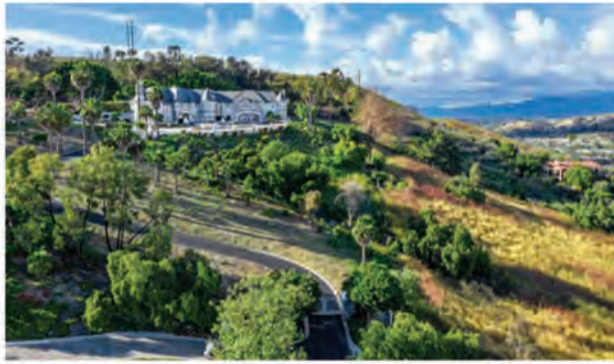
WISH CASTLE 31531 Peppertree Bend | San Juan Capistrano $11,200,000