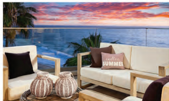
31897 CIRCLE DRIVE | IN ESCROW Laguna Beach | $6,198,000 Representing Seller