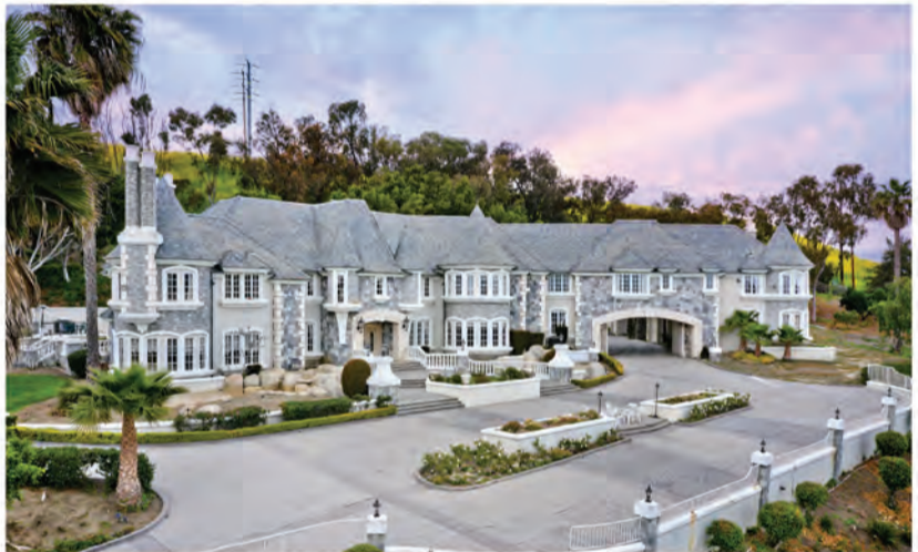
31531 PEPPERTREE BEND | SAN JUAN CAPISTRANO 9 BED | 12 BATH | 15,883 SQ FT | $11,200,000