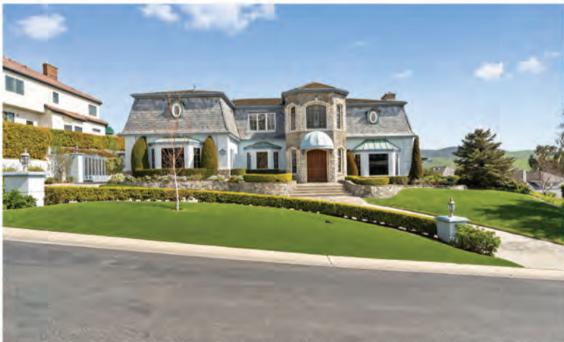
30936 STEEPLECHASE | SAN JUAN CAPISTRANO 4 BED | 4.5 BATH | 6,032 SQFT $1,995,000