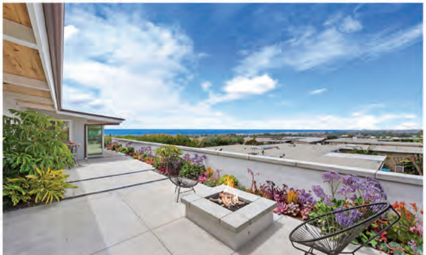
1133 GOLDENROD | CORONA DEL MAR 3 BED | 2.5 BATH | 2,571 SQFT $3,999,888