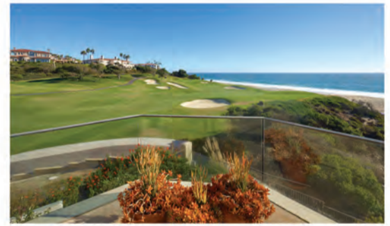
6 MONARCH COVE | JUST SOLD Dana Point Represented Buyer