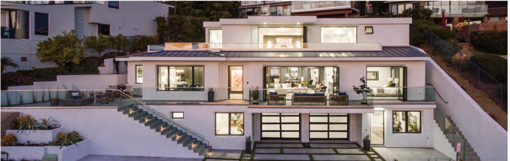
668 BUENA VISTA WAY | JUST SOLD Laguna Beach | $4,578,000 | Represented Seller

Sold with multiple offers after going into escrow after 14 days, at 98.3% of the asking price. *The primary objective of the Goldschwartz Team is to achieve the highest net proceeds for our clients.