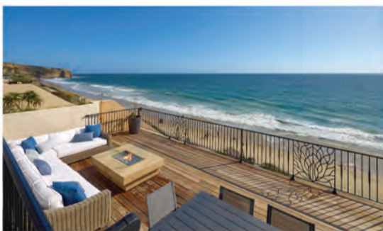
8 BREAKERS ISLE | JUST SOLD Dana Point | $8,900,000 Represented Buyer