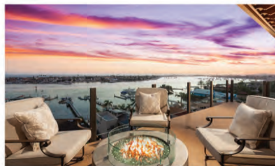
2301 PACIFIC DRIVE | IN ESCROW Corona del Mar | $8,478,000 Representing Seller