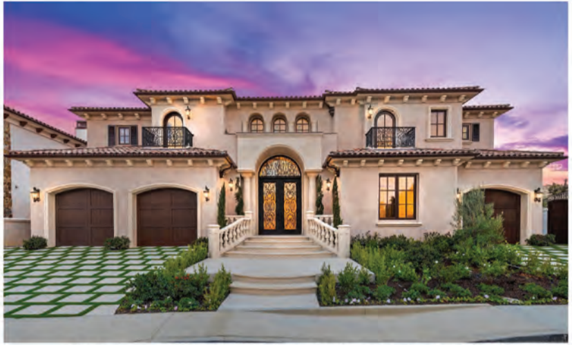
31841 MONARCH CREST | LAGUNA NIGUEL 5 BED | 5.5 BATH | 4,646 SQ FT | $3,998,800