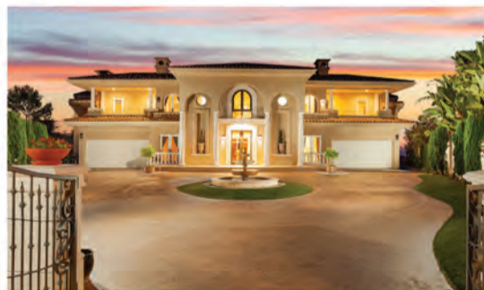
5 VISTA COURT | IN ESCROW Laguna Niguel | $6,578,000 Representing Seller