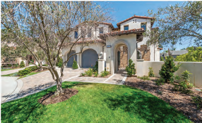
OCEAN DEL REY | DANA POINT NEW CONSTRUCTION | $1,789,000-$2,395,000