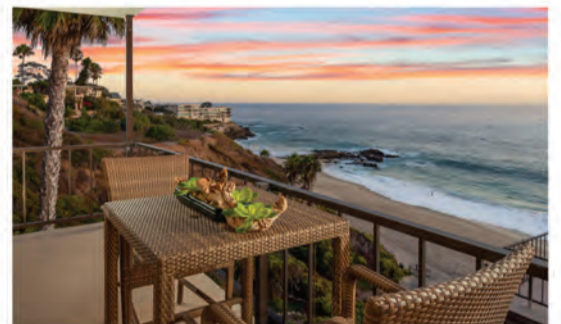
31423 COAST HIGHWAY #59 | JUST SOLD Laguna Beach | $3,998,000 Represented Seller

The above represents 4th Quarter Activity