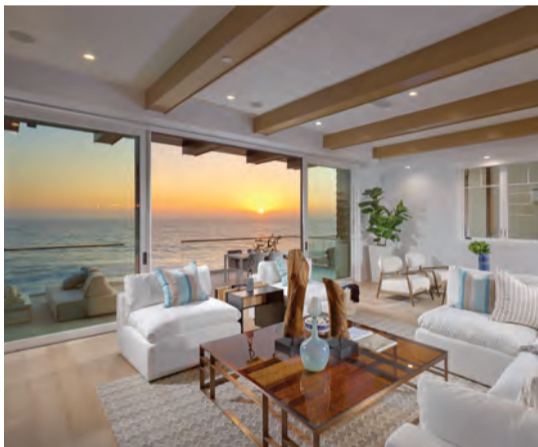
35351 BEACH ROAD Dana Point | $7,398,000 35351BeachRoad.com