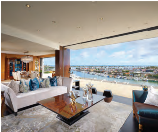
1301 DOLPHIN TERRACE Corona del Mar | $22,000,000 1301DolphinTerr.com