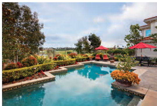
26 VIA CORSICA Dana Point | $3,195,000