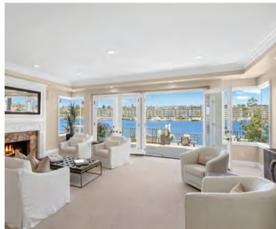
506 VIA LIDO NORD Newport Beach | $7,200,000 506ViaLidoNord.com