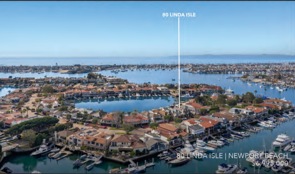
80 LINDA ISLE