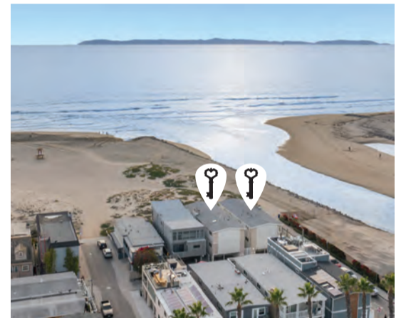
7404 WEST OCEANFRONT | $5,195,000 7406 WEST OCEANFRONT | $5,395,000 Newport Beach