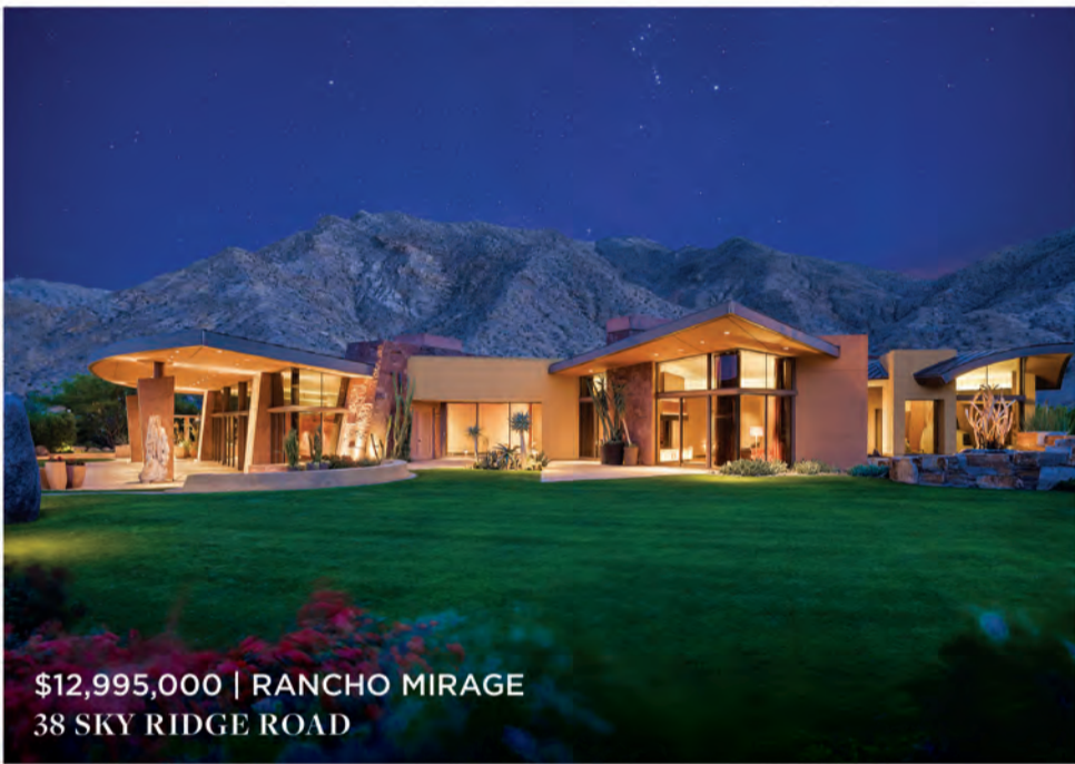
$12,995,000 | RANCHO MIRAGE 38 SKY RIDGE ROAD