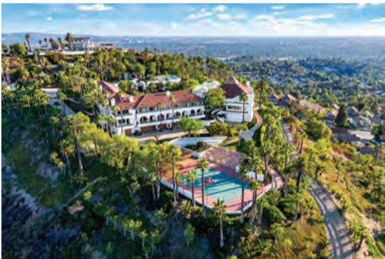
10252 SUNRISE LANE North Tustin | $19,900,000