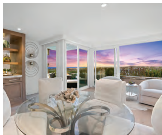
1115 WHITE SAILS WAY Corona del Mar | $4,649,000 1115WhiteSails.com