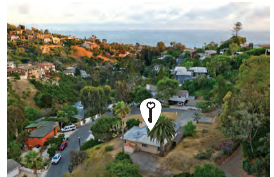
1300 DUNNING DRIVE Laguna Beach | $3,500,000