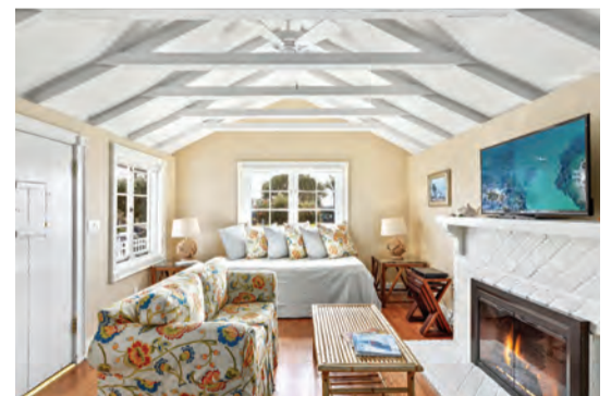
1086 GLENNEYRE STREET Laguna Beach | $1,299,000