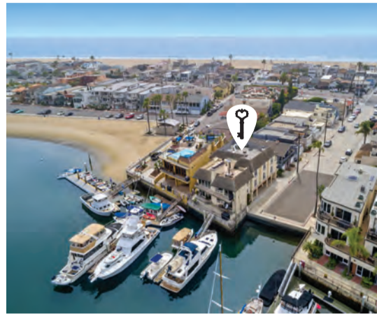
224 20TH STREET Newport Beach | $8,900,000 224-20thStreet.com