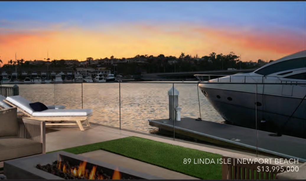
89 LINDA ISLE | NEWPORT BEACH $13,995,000