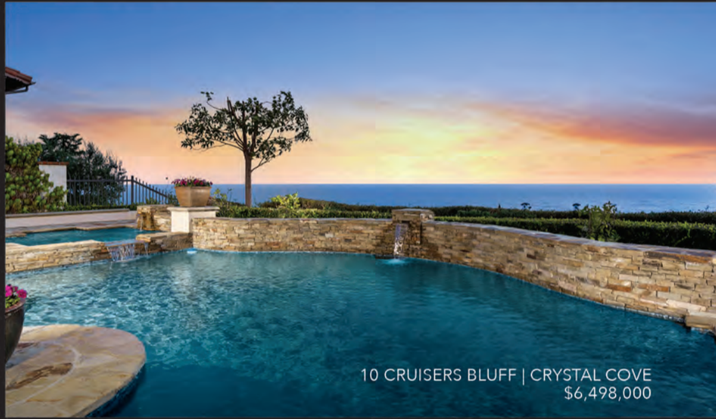
10 CRUISERS BLUFF | CRYSTAL COVE $6,498,000