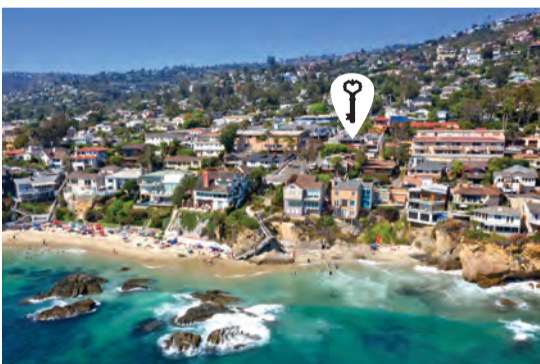
2007 SOUTH COAST HIGHWAY Laguna Beach | $3,395,000