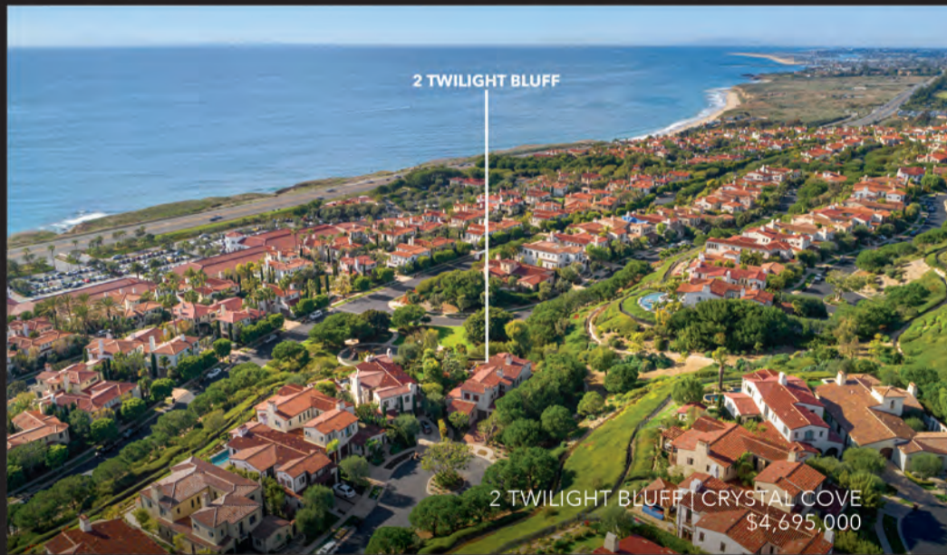
2 TWILIGHT BLUFF