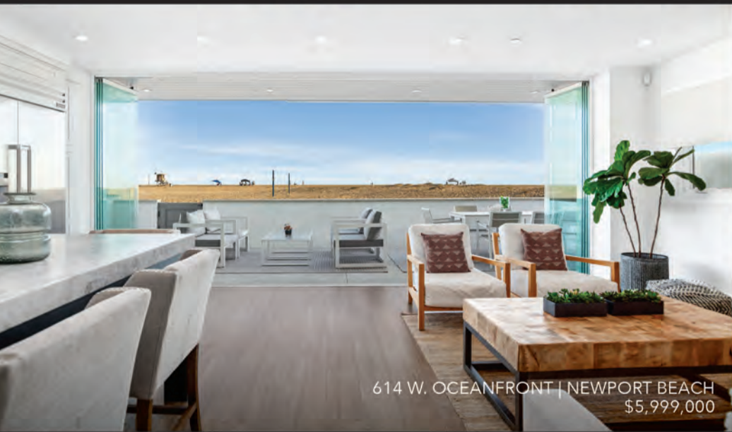
614 W. OCEANFRONT | NEWPORT BEACH $5,999,000