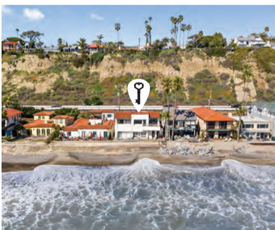
35155 BEACH ROAD | PRICE REDUCED Dana Point | $4,750,000 35155BeachRd.com