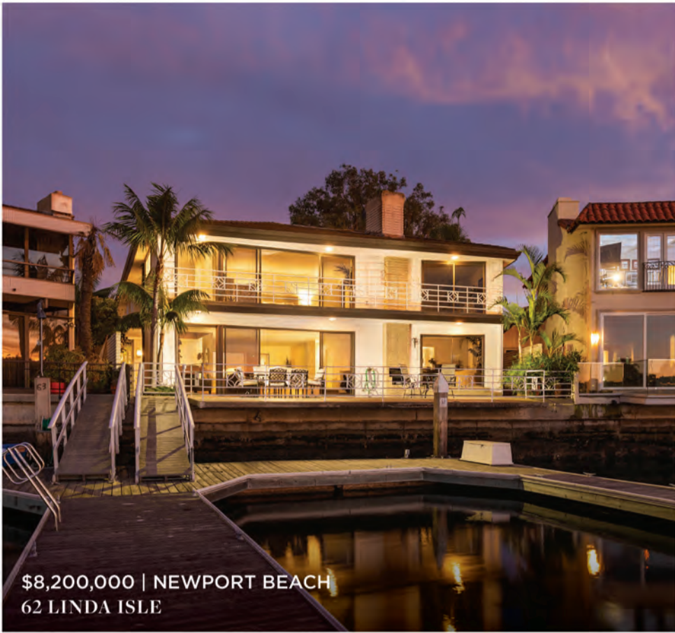
$8,200,000 | NEWPORT BEACH 62 LINDA ISLE