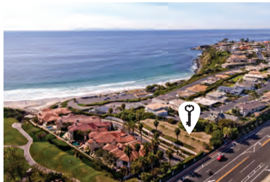
1 MONARCH COVE Dana Point | $3,995,000