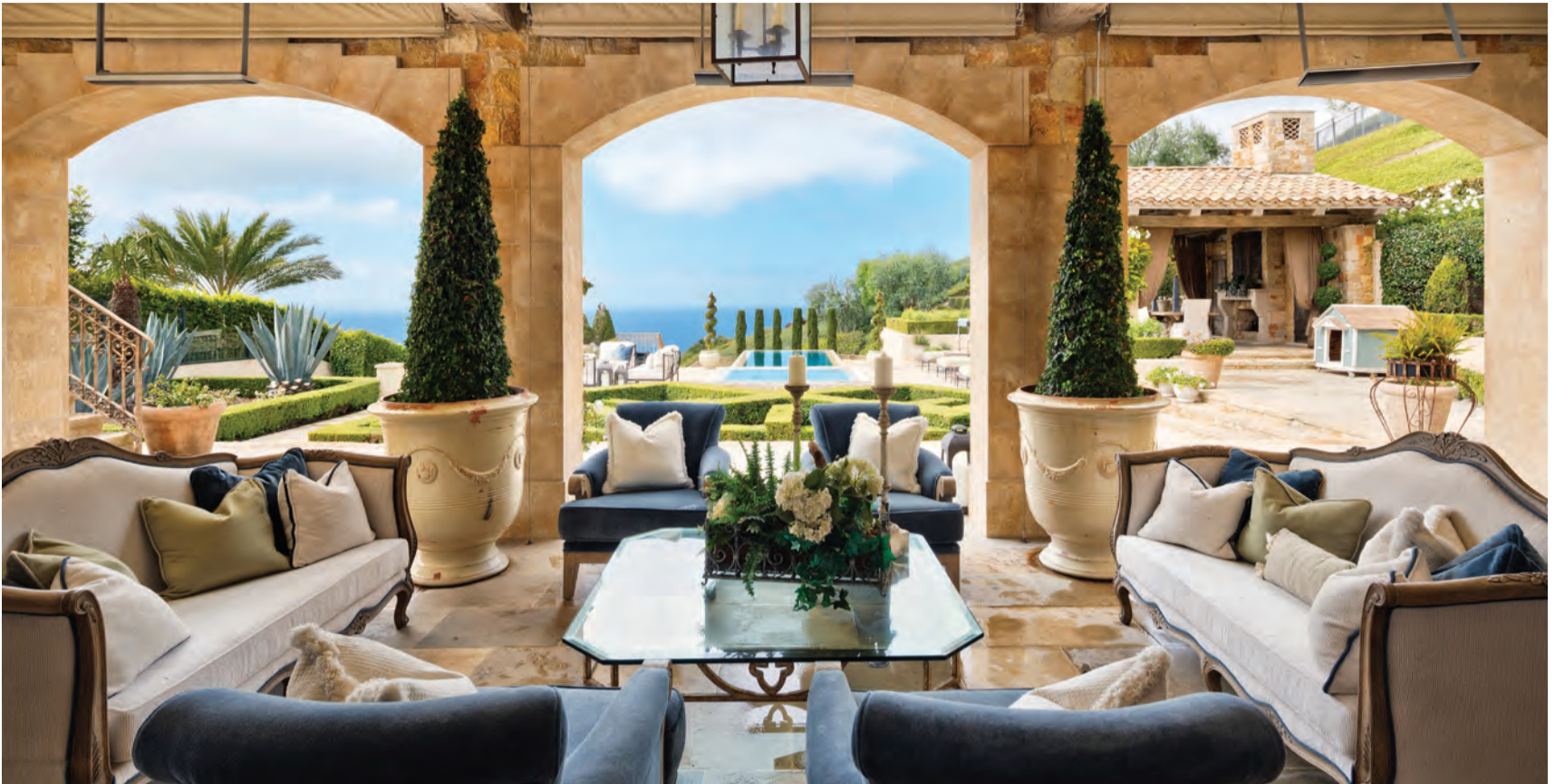
1 AVALON VISTA Newport Coast | $16,500,000