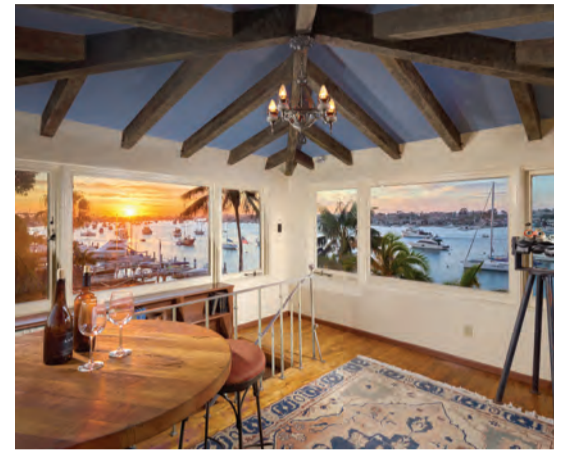
1707 EAST BAY AVENUE Newport Beach | $8,750,000 1707EBay.com