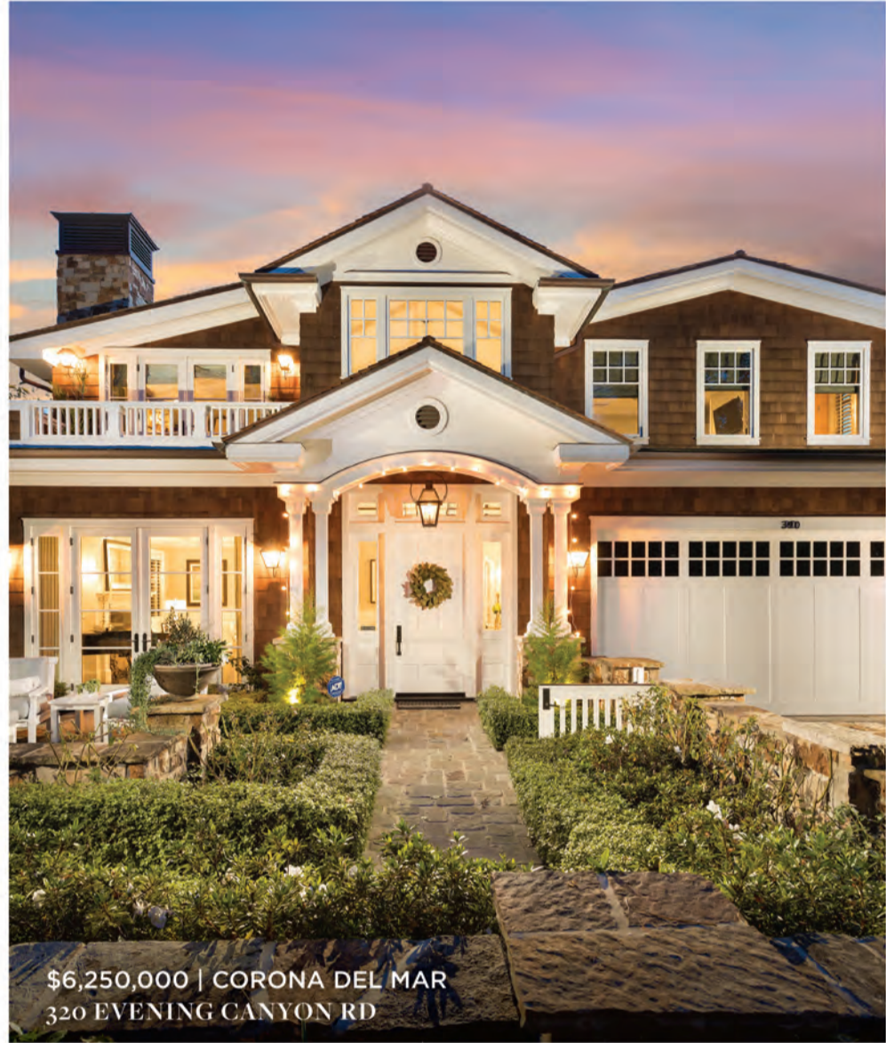
$6,250,000 | CORONA DEL MAR 320 EVENING CANYON RD