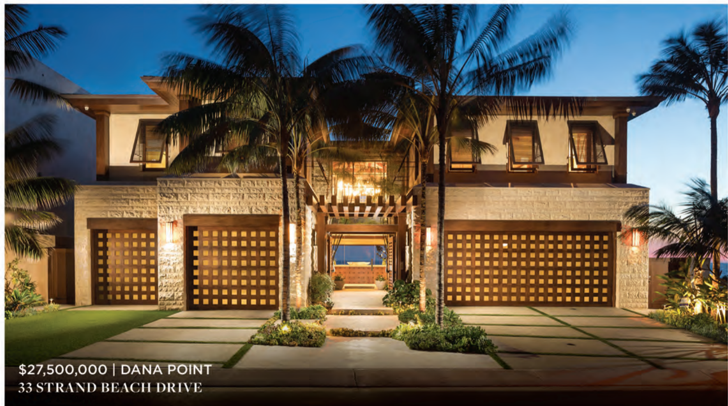
$27,500,000 | DANA POINT 33 STRAND BEACH DRIVE