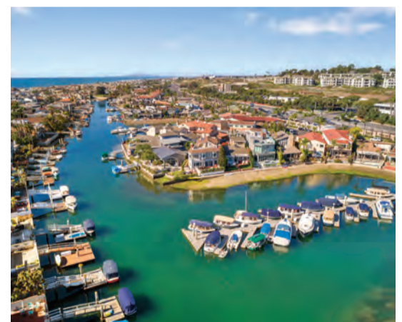
BALBOA COVES | COMING SOON Newport Beach | $4,195,000 Boat dock to accommodate 37' boat