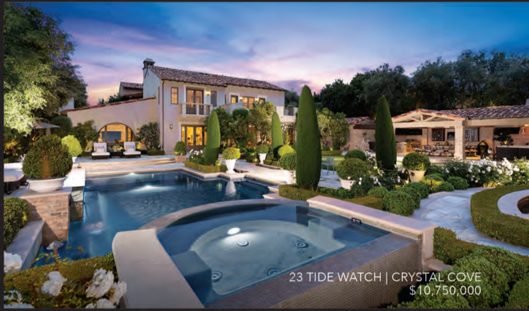
23 TIDE WATCH | CRYSTAL COVE $10,750,000