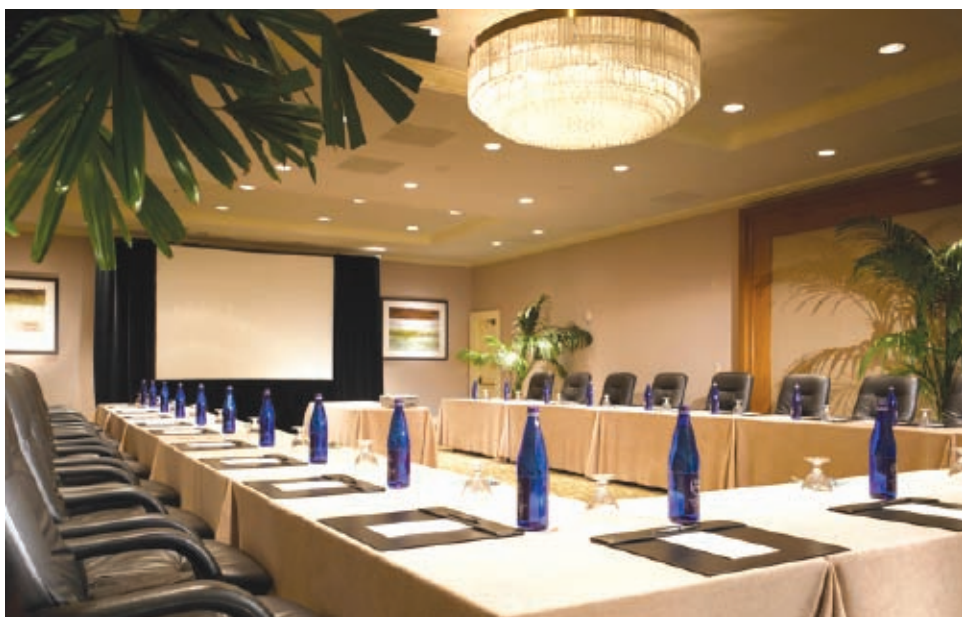
Mesa Verde Boardroom

For more information, call 714-662-6666 or visit www.westin.com/SouthCoastPlaza .