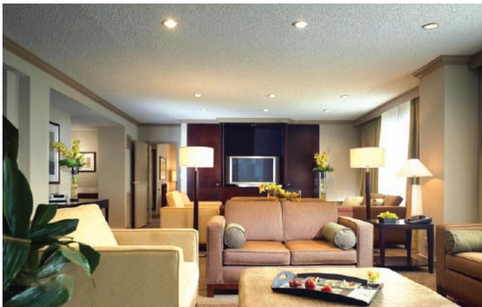
Luxury suite living room