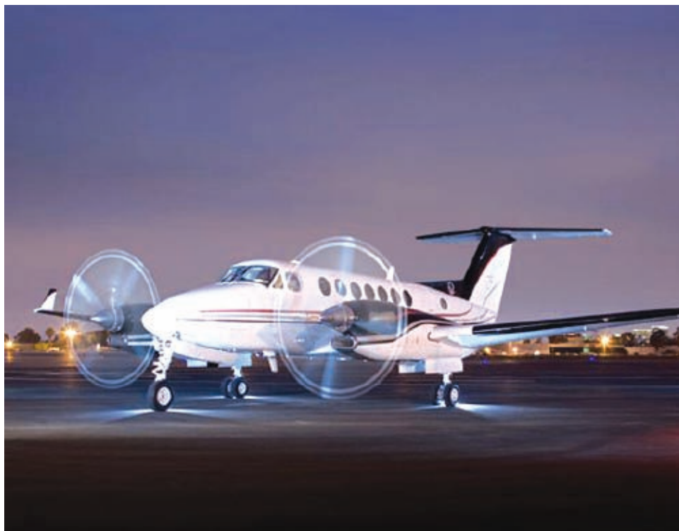
Business aviation is in reality a contributor to the long-running success story that is American business