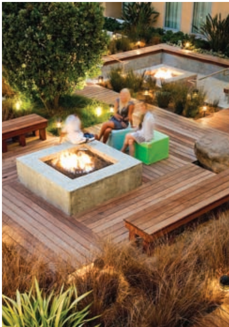
Shorebreak Hotel in Huntington Beach combines the relaxed, sun-drenched spirit of the Orange County coastline with an edgy modern feel

Shorebreak Hotel is located just off the beach where the Pacific Coast Highway meets the Huntington Beach Pier. Located in a new development known as "The Strand," Shorebreak Hotel is the first full-service luxury hotel on the waterfront in Huntington Beach and the only hotel in downtown Huntington Beach. This ideal location is well suited both to business and leisure travelers.