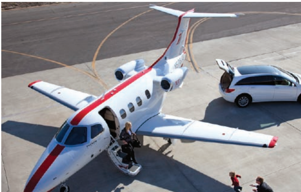
The brand new Phenom 100