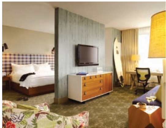
Hotel highlights include guestrooms with spellbinding ocean views

with Surfrider Foundation, a non-profit organization dedicated to the protection and enjoyment of our world's oceans, waves and beaches.