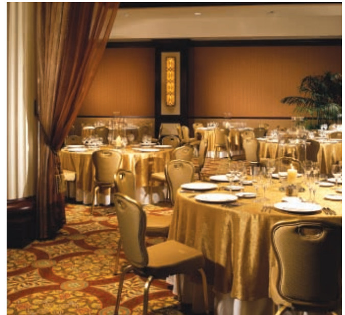
The Elegant Mariner's Ballroom at the Hyatt Regency Huntington Beach Resort and Spa

For additional information, please visit www.bistango.com , www.kimerarestaurant.com , www.baysiderestaurant.com and www.diningasart.com .