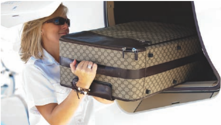
Largest baggage capacity in its class

While one would think that the hourly jet cards offered by other industry leaders, like Marquis Jet, would be less costly than a card that sells by the day, the JetSuite DayCard is actually MUCH less expensive. A 25-hour card from Marquis Jet, for example, sells for more than $120,000 plus fuel and other surcharges for each hour flown. A three hour trip will cost three times less on JetSuite than on Marquis Jet.