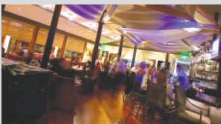
New American cuisine comes to life at Bayside

For more information or reservations, call 714.698.1234 or visit huntington-beach.hyatt.com .