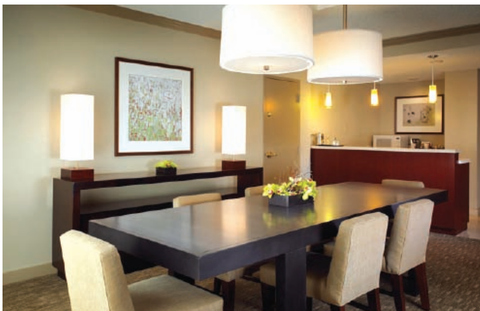
Luxury suite dining room