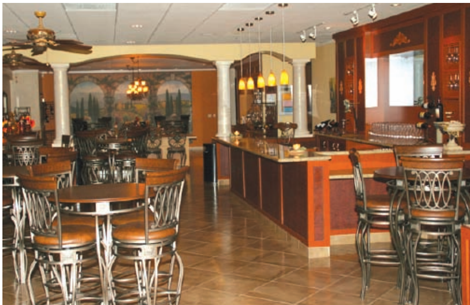
Guests will enjoy the warm and inviting Tuscan ambience at The Wine Artist