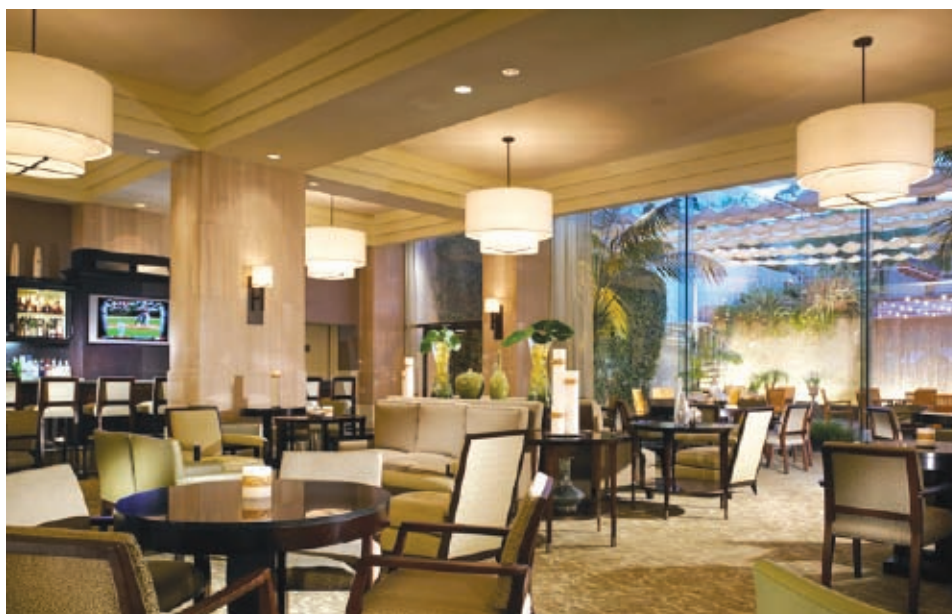
Lobby bar and lounge