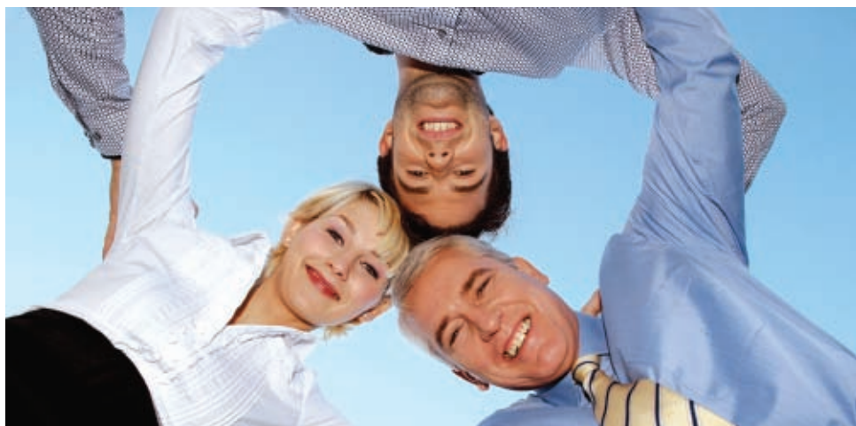
The Executive Physical Program at Saddleback Memorial consists of a dedicated staff that follows medically accepted guidelines.