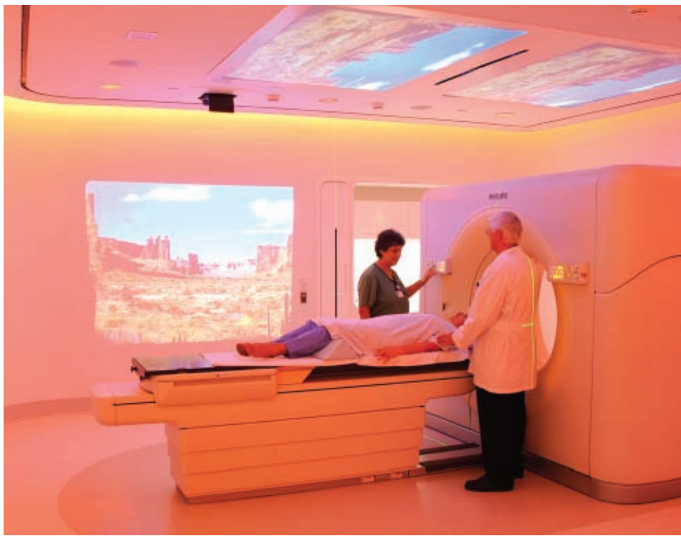
Lighting, imagery and the fluid design of the Ambient Experience suite inside the Chao Family Comprehensive Cancer Center aim to reduce anxiety and create an audio-visual cocoon for a patient undergoing a CT procedure.

Patients control images of scenery projected onto the CT room's ceiling and walls. Their six choices include, among others: a South American beach scene, including a coconut dropping from a palm tree while clouds drift by; an African sky that transforms into twilight, com-