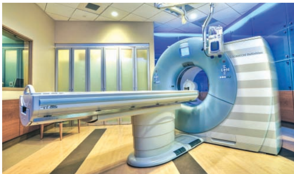
Hoag Imaging Center-Newport Beach features some of the latest imaging technology.