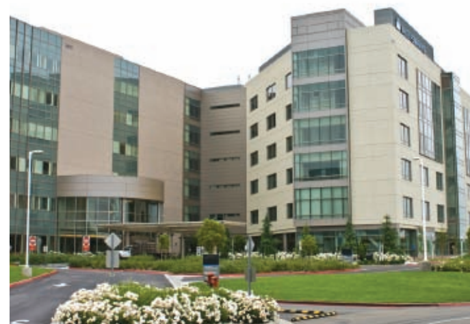
Kaiser Permanente Orange County - Irvine Medical Center