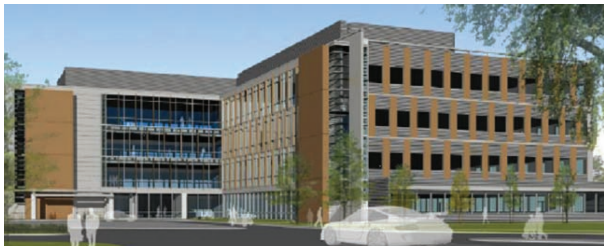
Kaiser Permanente Kraemer Medical Office Building