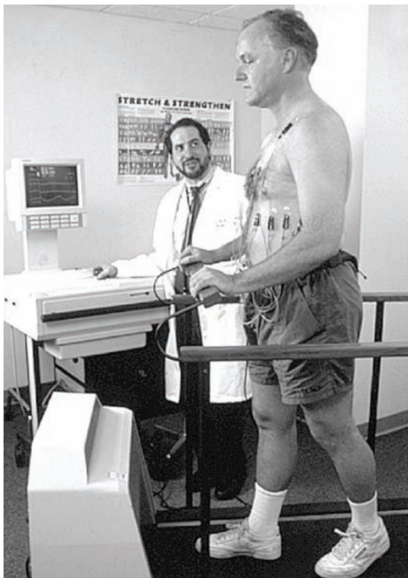
The UC Irvine Executive Health Physical is designed to be efficient while providing time for an in-depth discussion between patient and doctor.