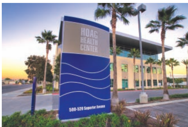
Hoag Health Center-Newport Beach is located at 500-520 Superior Ave. in Newport Beach.

For more information about Hoag Health Center-Newport Beach, please call 800/514-4624 or visit www.hoaghospital.org .