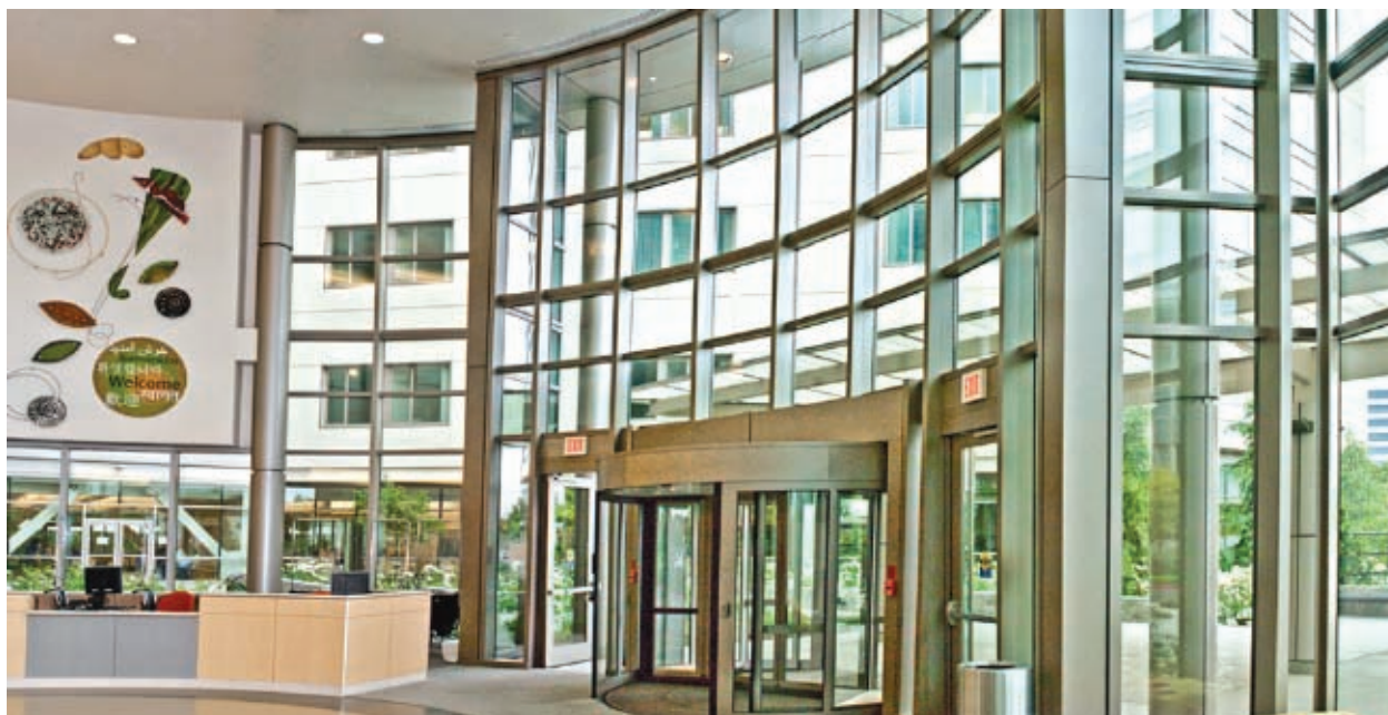
Kaiser Permanente Orange County - Irvine Medical Center

Kaiser Permanente's use of technology also ensures that innovative care doesn't stop at