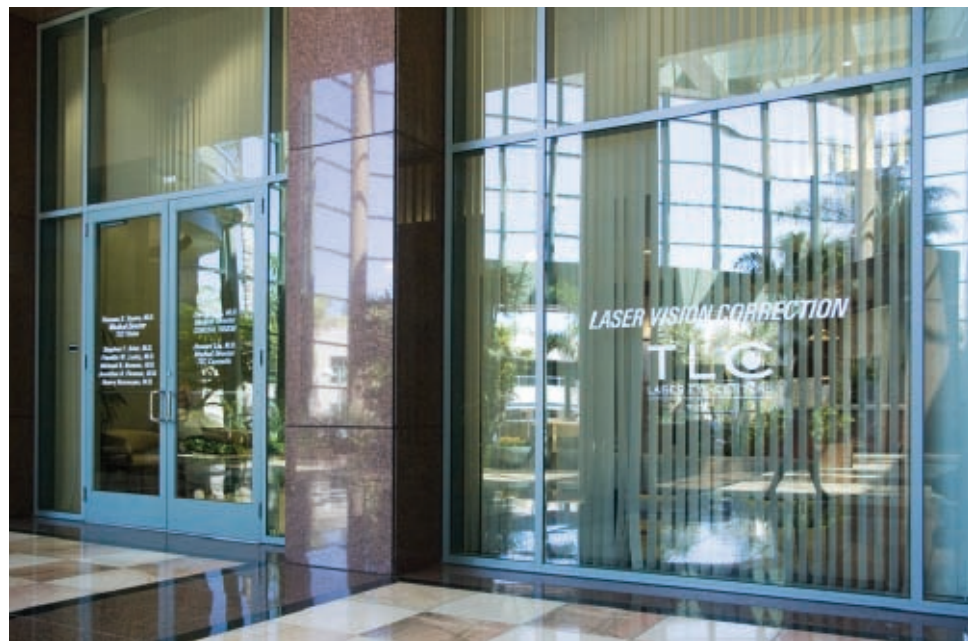
TLC offers 11 convenient locations in Southern California