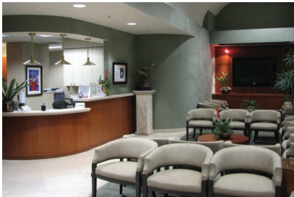
TLC Laser Eye Centers-Newport Beach.