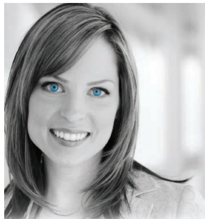
TLC offers solutions for correcting both near and distance vision.