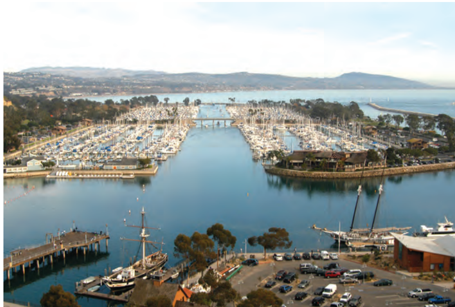
Tall Ships Festival sails to Dana Point next month

Event: Surf City Days & He'e Nalu Aloha Pier Fest Date: Sept. 14-15