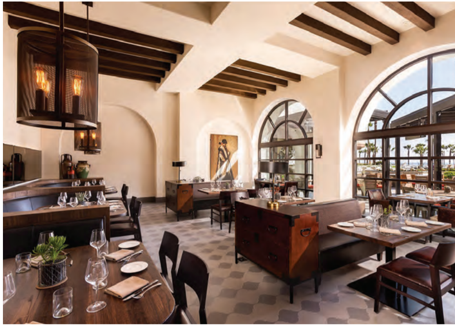
Hyatt Regency Huntington Beach’s wine-loving Watertable