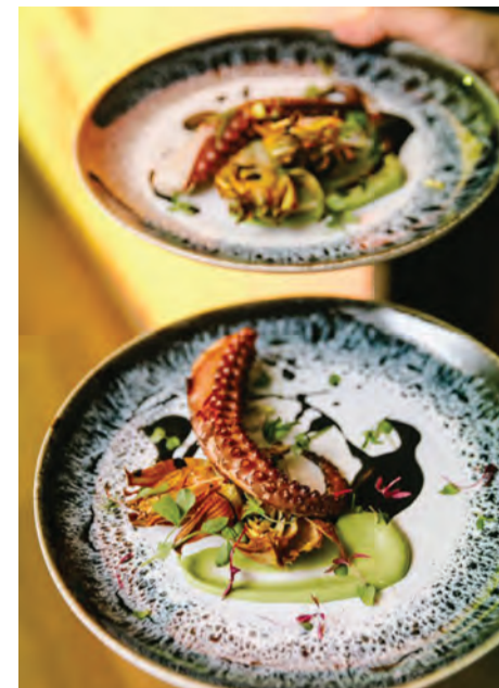
Sucker lunch: octopus at Fleming's

and adds "virtual panoramic projections and natural sounds" to evoke "ocean, farms and vineyards that inspired the menu selections."