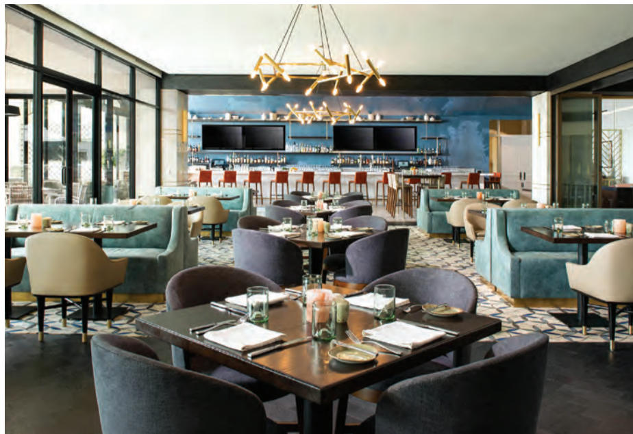
Aveo at Monarch Beach

Monarch Bay Club at Monarch Beach Resort in Dana Point closed and reopened earlier this year for a renovation that ex-