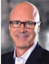
Burress: touts ‘farm-to-table’

Local restaurants are upping their eating game big time as meetings and conventions continue to drive travel to key cities and boost the economic impact to the county overall (see chart, page 62).