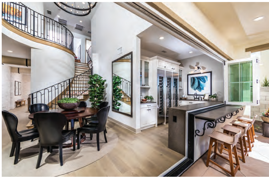
Windstone by Landsea Homes is available now at IronRidge in Lake Forest.