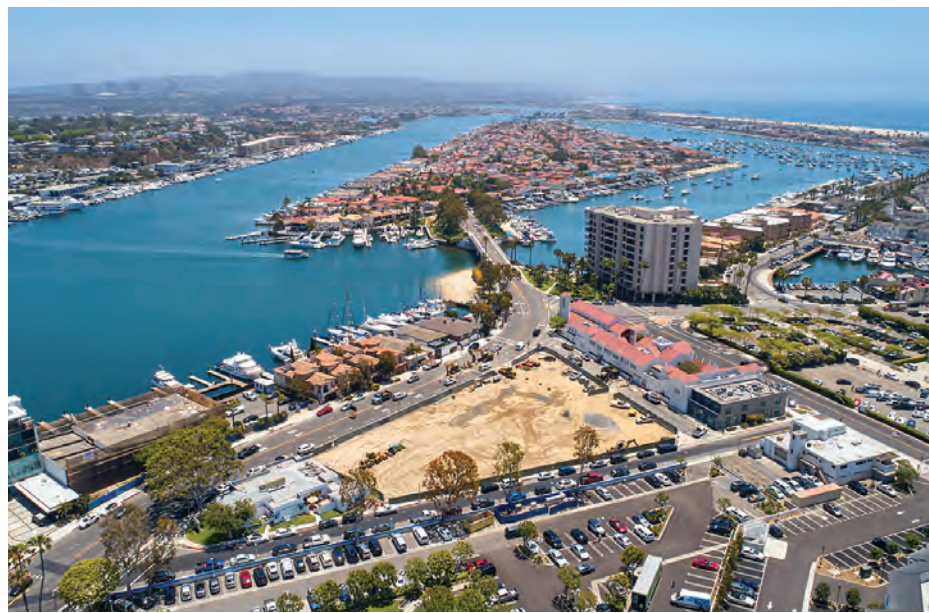
Pre-sales for Lido Villas in Newport Beach begin in October 2018.