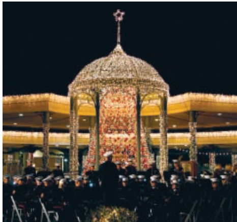
From small intimate dinners to large events, BBC&R has a space for your holiday celebration

Oktoberfest begins Thursday, October 1 st and runs for the entire month of October in The First Cabin Restaurant here at The Balboa Bay Club & Resort – and yes, it is