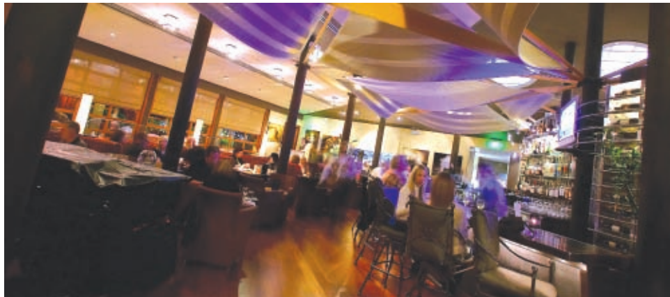
New American cuisine comes to life at Bayside