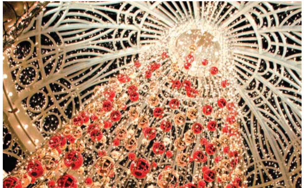
Just days after Thanksgiving, The Resort is transformed into a wonderland of red and gold décor and sparkling white lights