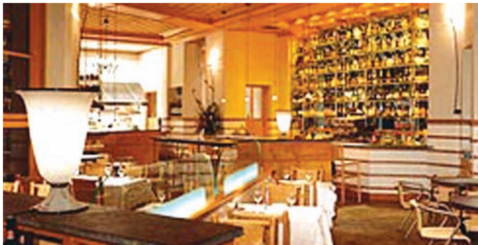
Enjoy authentic cuisine paired with regional wines at Il Fornaio