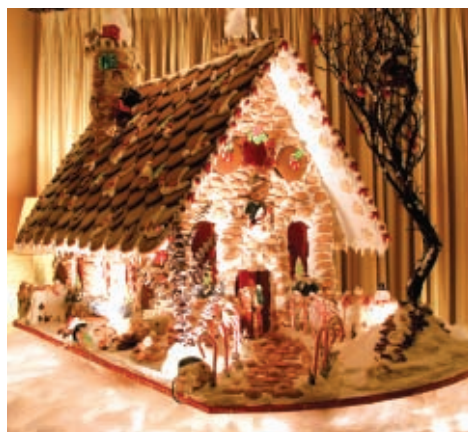
The creative Event Staff at the BBC&R will make the planning of your event an easy one