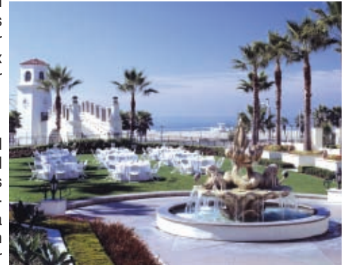
The lighthouse courtyard overlooking the Pacific Ocean at Hyatt Regency Huntington Beach Resort & Spa.

For more information or reservations, call 714.698.1234 or visit huntingtonbeach.hyatt.com .