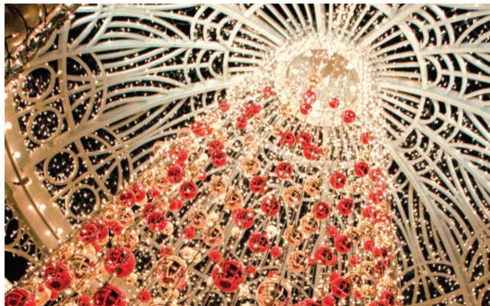
Just days after Thanksgiving, The Resort is transformed into a wonderland of red and gold décor and sparkling white lights