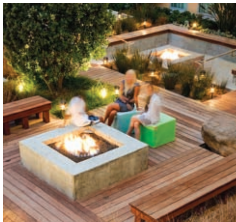
Shorebreak Hotel draws its inspiration from Southern California's cultivated, yet laid-back surf culture, combining four-star touches with a penchant for fun

Shorebreak Hotel is located just off the beach where the Pacific Coast Highway meets the Huntington Beach Pier. Located in a new