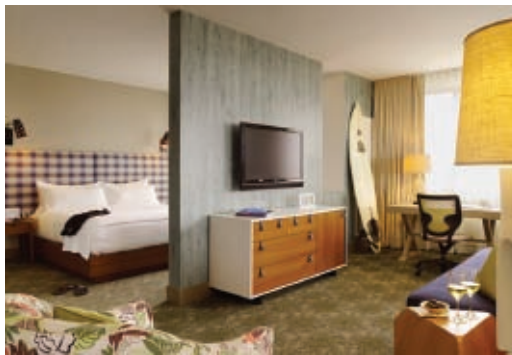
Hotel highlights include guestrooms with spellbinding ocean views

After dinner, enjoy our at-the-table "Mediterranean honor bar" with a selection of unique liqueurs and spirits. For perfect private events with style, enjoy Zimzala's private dining room complete with a stone fireplace and adjacent outdoor patio.