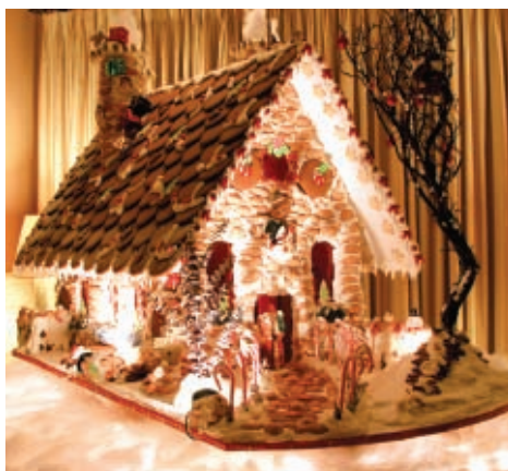
The creative Event Staff at the BBC&R will make the planning of your event an easy one