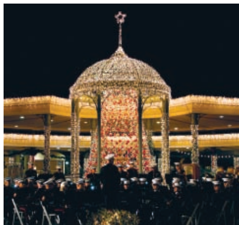
From small intimate dinners to large events, BBC&R has a space for your holiday celebration

Oktoberfest begins Thursday, October 1st and runs for the entire month of October in The First Cabin Restaurant here at The Balboa Bay Club & Resort – and yes, it is