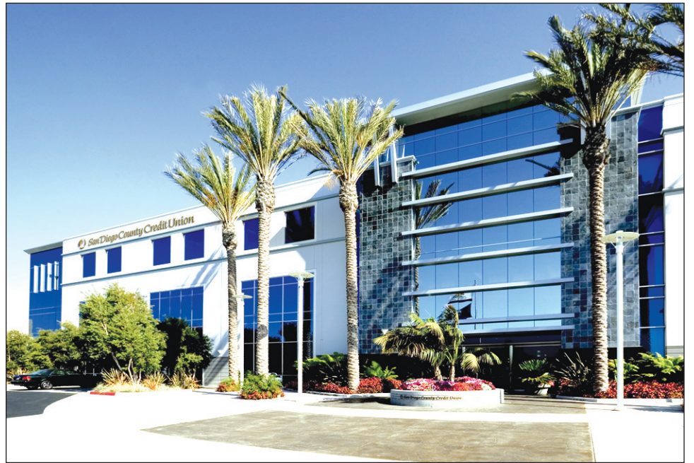
San Diego County Credit Union's administration building, located in Sorrento Valley.