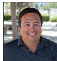
Vice President, General Counsel & Secretary ViaSat Inc. www.viasat.com