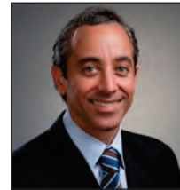
Executive Vice President & General Counsel Arena Pharmaceuticals www.arenapharm.com