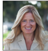
General Counsel General Dynamics NASSCO http://www.nassco.com