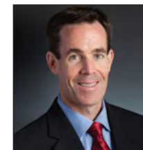
Executive Vice President & General Counsel NuVasive, Inc. www.nuvasive.com