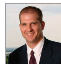
General Counsel SANYO North America Corp. www.sanyo.com