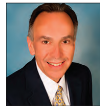
Chief Legal Office, Executive Vice President of Specialty Finance BoFI Federal Bank www.bofifederalbank.com