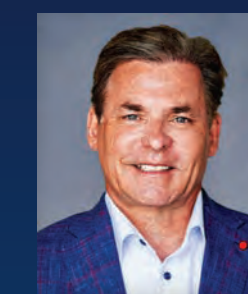
Miles Scully Award Winner "Litigation"