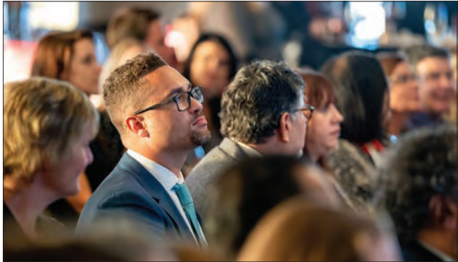
Attentive audience at the SDBJ Leaders in Law Awards.