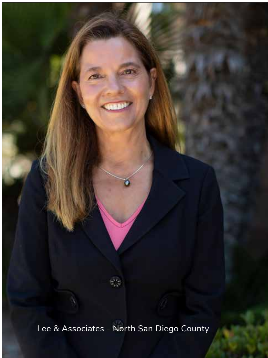
Lee & Associates - North San Diego County