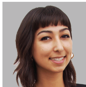
JOHANNA MALL McCullough Landscape Architecture, Inc.