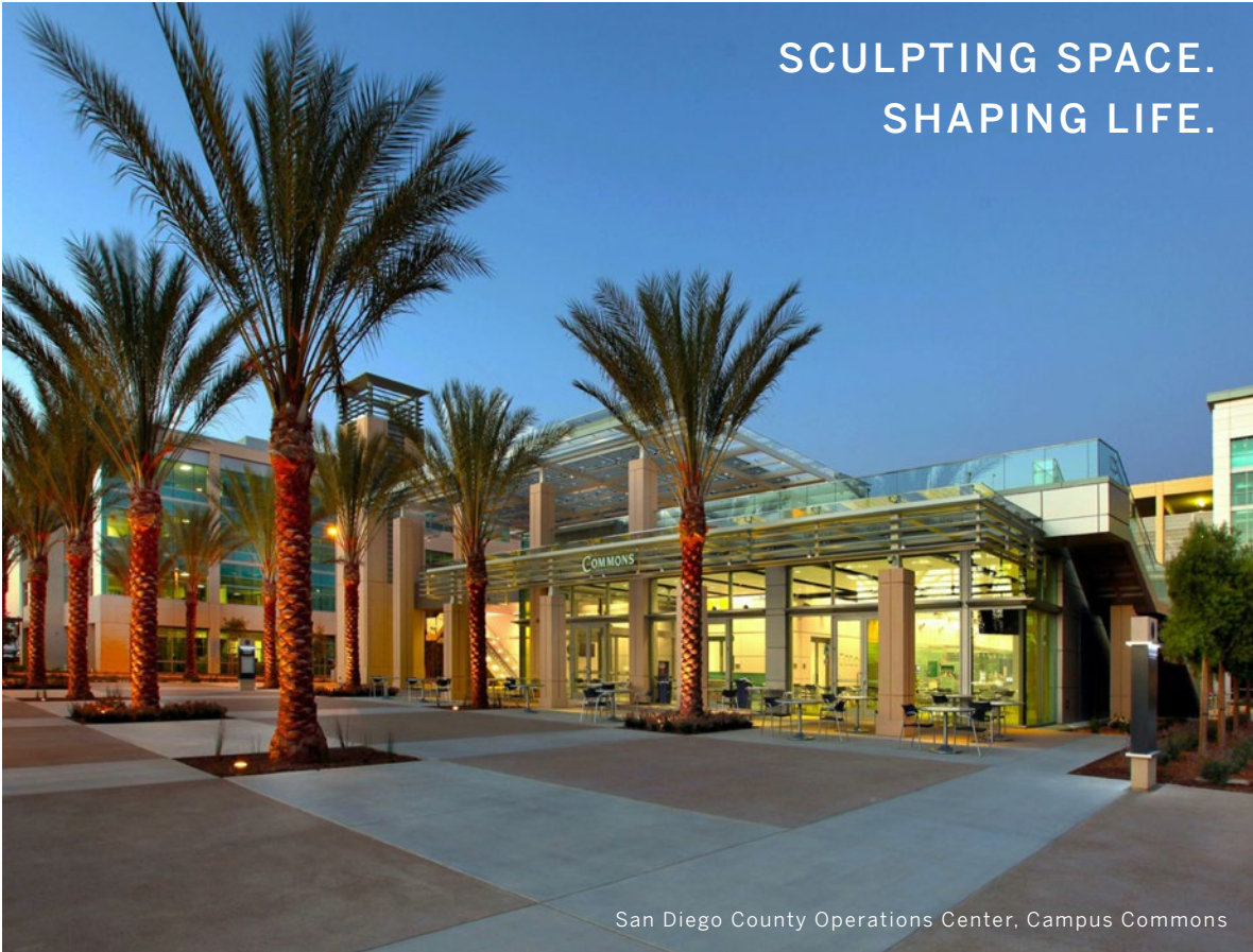
San Diego County Operations Center, Campus Commons

For being recognized as one of San Diego's most Influential Women in Architecture in 2021. As a Steinberg Hart Partner with over 30 years of practice, founding member of SDNOMA and former president of AIA San Diego's Women in Architecture, we are extremely proud of how you represent our organization. Thank you for your continued dedication and exemplary accomplishments, leadership, and mentorship.