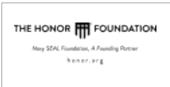
The Honor Foundation