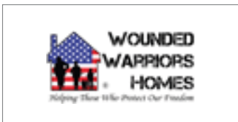
Wounded Warrior Homes