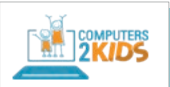
Computers 2 Kids