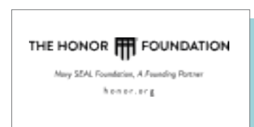
The Honor Foundation