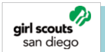
Girl Scouts San Diego