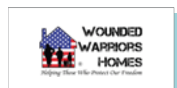
Wounded Warrior Homes