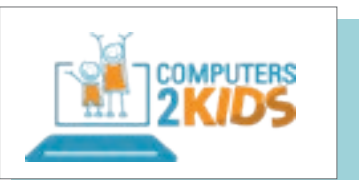
Computers 2 Kids