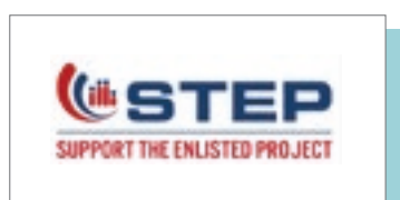
Support The Enlisted Project (STEP)