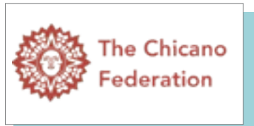
Chicano Federation of San Diego County