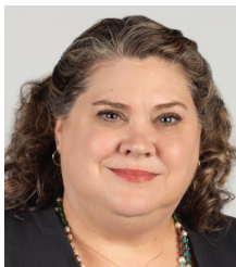
JODI CLEESATTLE Supervising Deputy Attorney General California Department of Justice