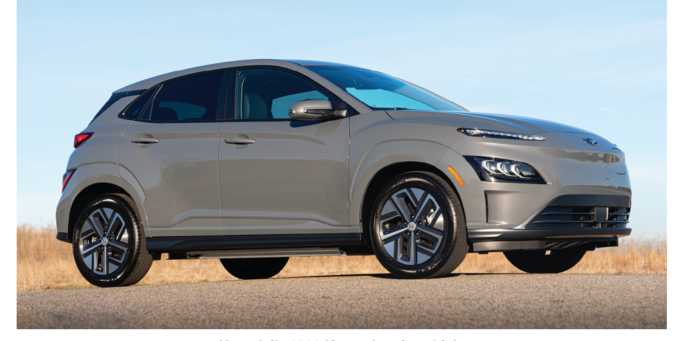
Hyundai's 2022 Kona electric vehicle

Sister company Irvine-based Kia America also remained upbeat, despite the 4.7% decline in September sales from a year ago to 52,906 vehicles.