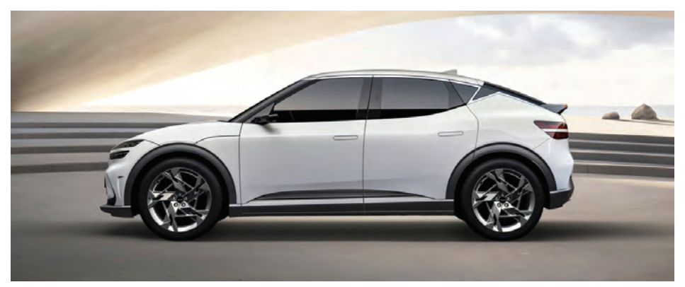
Genesis' SUV momentum continued with the reveal in September of its first dedicated EV, the GV60

based Genesis Motor America Inc. , notching the highest surge in new vehicle registrations to 193 for the July/August period. That reflects a 154% increase.