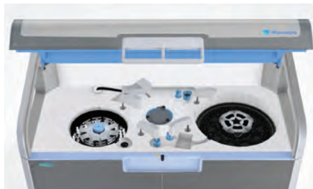
Hycor Biomedical, maker of allergy testing system, nabs $100M

"We were able to successfully scale up operations to supply over 1 million tests per month, which enables us to rapidly expand our