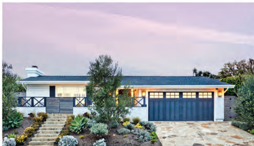
4800 CORTLAND DRIVE | FOR SALE Corona del Mar | $2,995,000