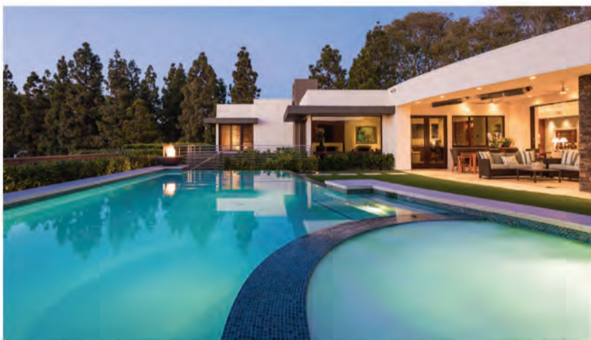
1809 SEADRIFT DRIVE | SOLD Corona del Mar | $7,200,000 Represented Buyer