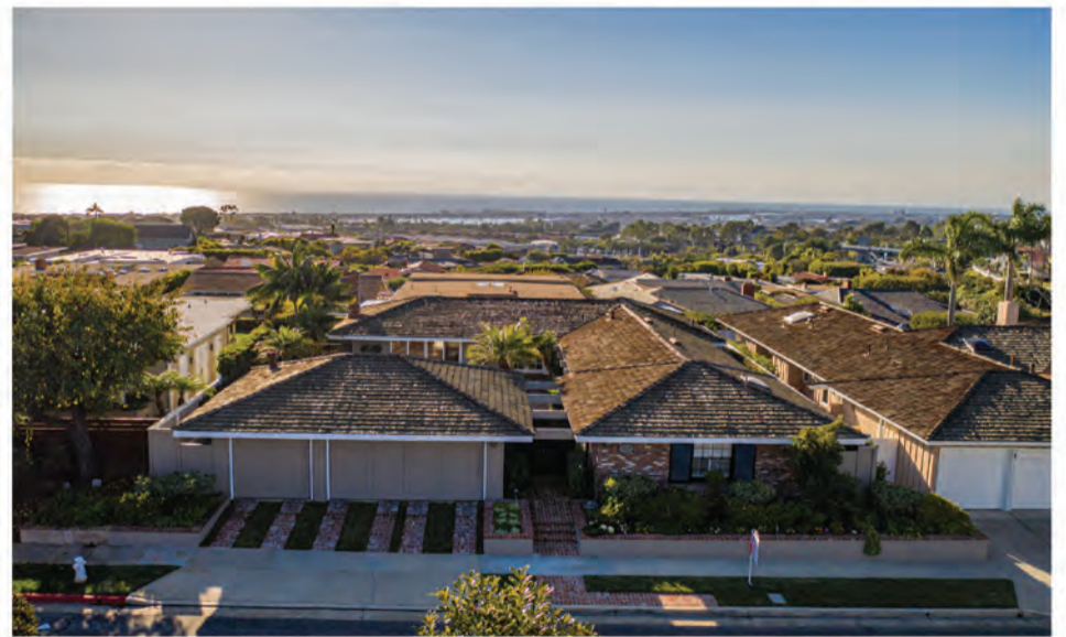
2507 LIGHTHOUSE LANE | CORONA DEL MAR 3 BED | 2.5 BATH | 2,578 SQFT $3,950,000