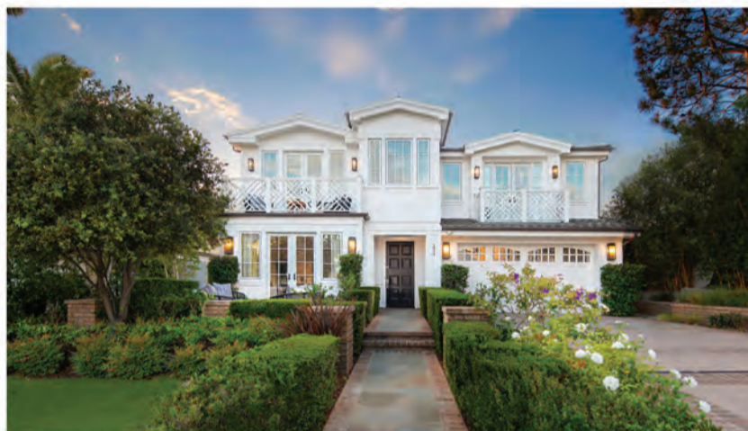
233 MORNING CANYON ROAD | SOLD Corona del Mar | $6,375,000 Represented Buyer