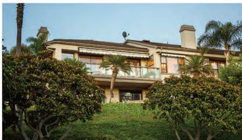
77 OCEAN VISTA | SOLD Newport Beach | $2,050,000 Represented Seller