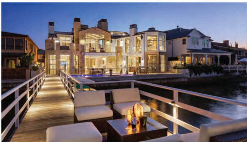
2136 E. BALBOA BOULEVARD | FOR SALE Newport Beach | $27,500,000