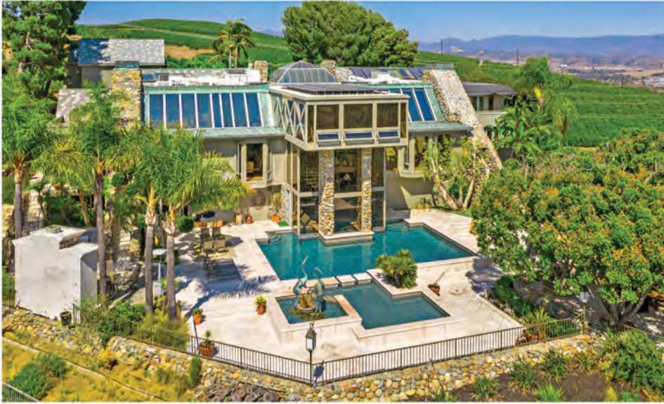
30552 HILLTOP WAY | SAN JUAN CAPISTRANO 9 BED | 10 BATH | 14,147 SQ FT | $4,880,000

CANADAY GROUP ORANGE COUNTY LUXURY HOME SPECIALISTS