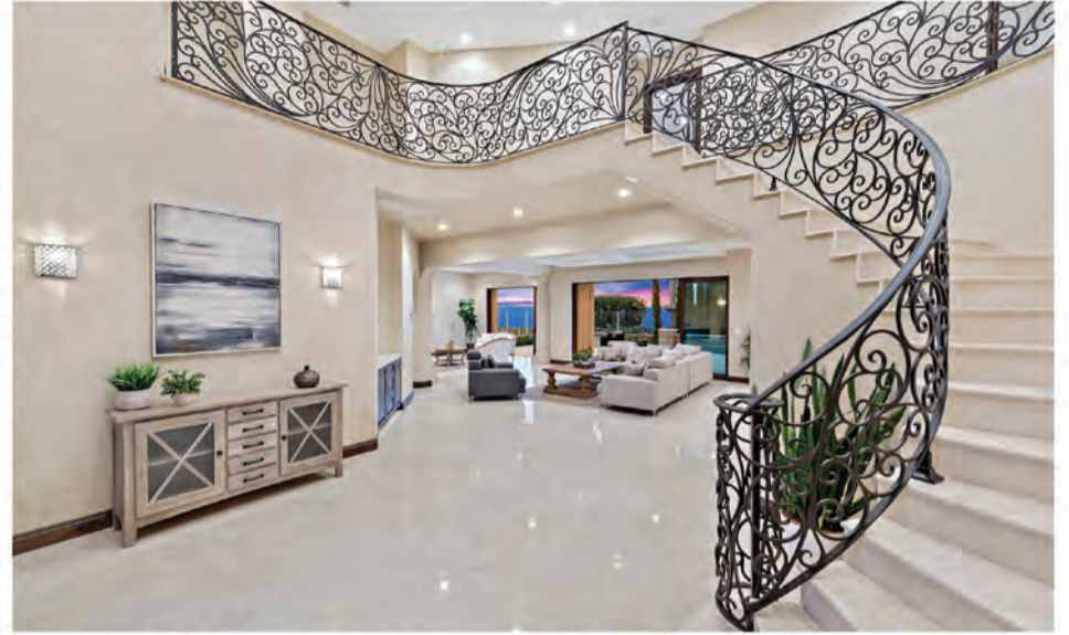
31841 MONARCH CREST | LAGUNA NIGUEL 5 BED | 5.5 BATH | 4,646 SQ FT | $3,998,800