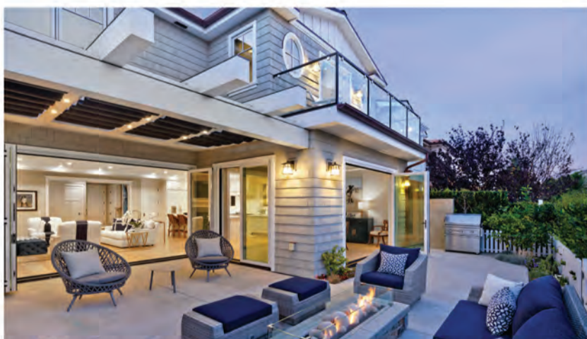
214 VIA MENTONE | SOLD Newport Beach | $3,950,000 Represented Seller