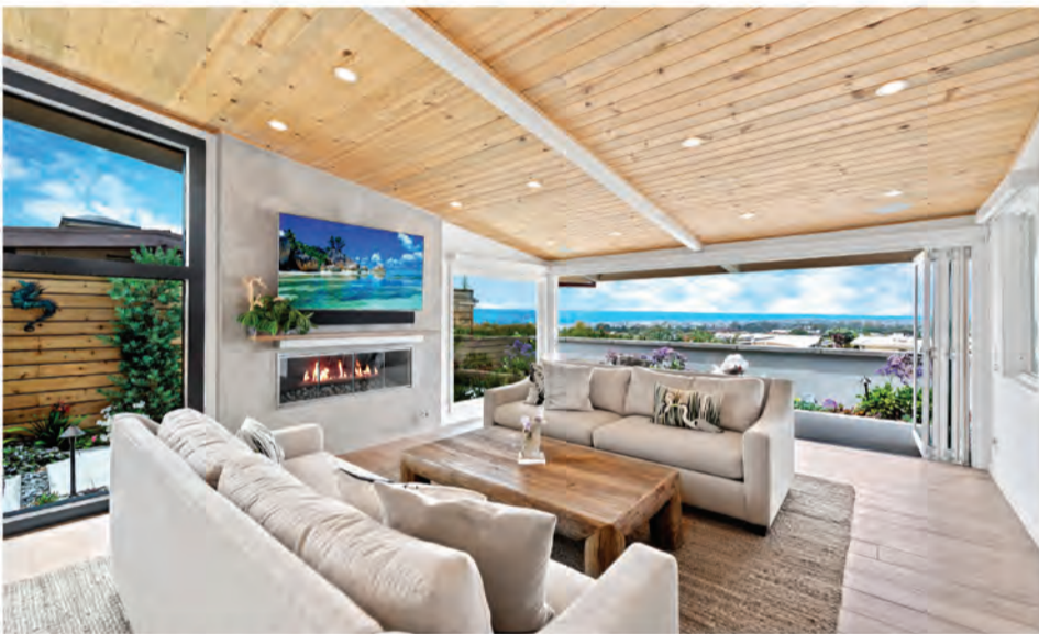
1133 GOLDENROD | CORONA DEL MAR 3 BED | 2.5 BATH | 2,571 SQFT | $3,999,888