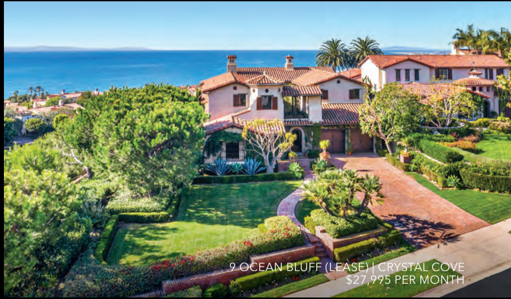
9 OCEAN BLUFF (LEASE) | CRYSTAL COVE $27,995 PER MONTH