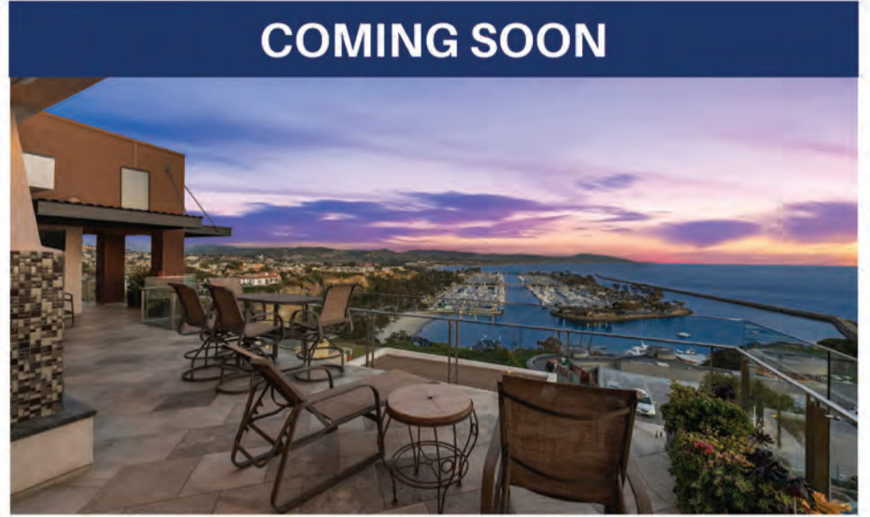
COMING SOON STYLISH BLUFF TOP PENTHOUSE | DANA POINT 6 BED | 4.5 BATH | 6,500 SQ FT | PRICE UPON REQUEST