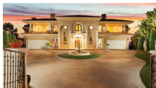
5 VISTA COURT | IN ESCROW Laguna Niguel | $6,578,000 Representing Seller