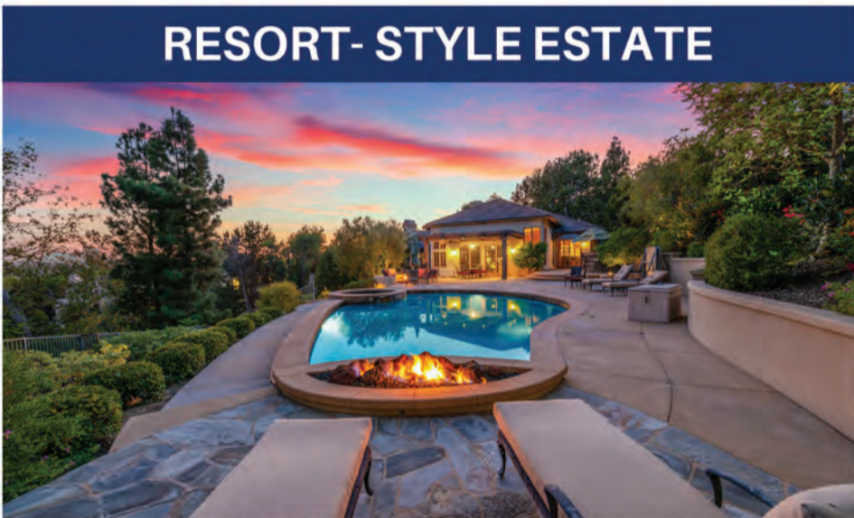
RESORT-STYLE ESTATE 30552 HUNT CLUB DRIVE | SAN JUAN CAPISTRANO 4 BED | 3.5 BATH | 6,034 SQ FT | $3,000,000