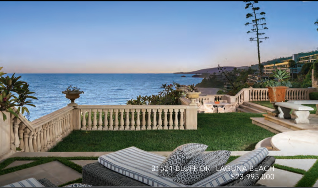
31521 BLUFF DR | LAGUNA BEACH $23,995,000