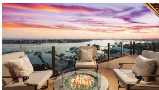
2301 PACIFIC DRIVE | IN ESCROW Corona del Mar | $8,478,000 Representing Seller