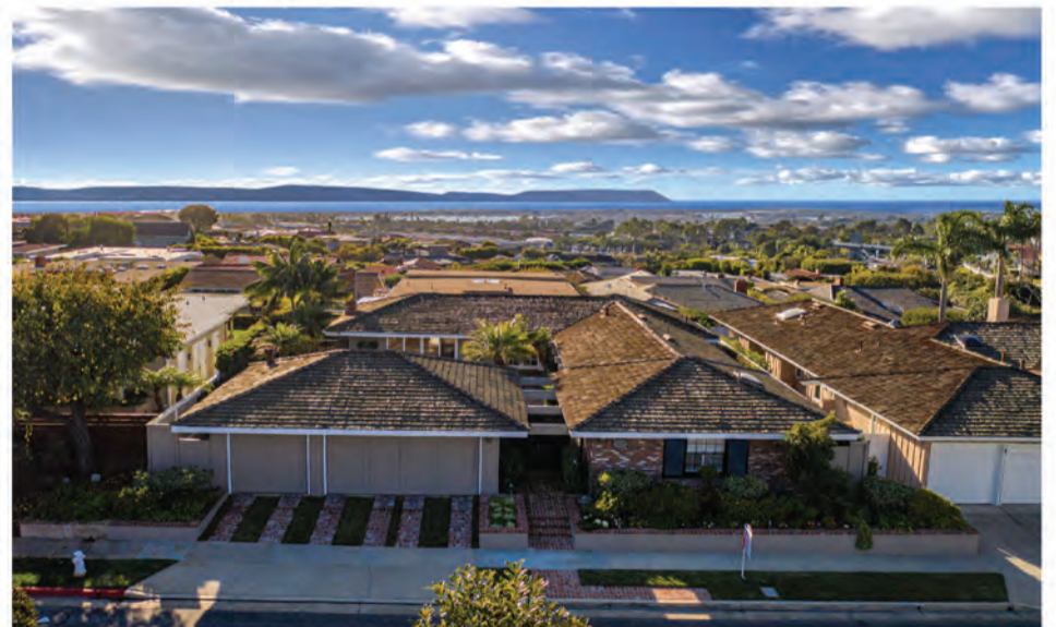
2507 LIGHTHOUSE LANE | CORONA DEL MAR 3 BED | 2.5 BATH | 2,578 SQFT $3,950,000