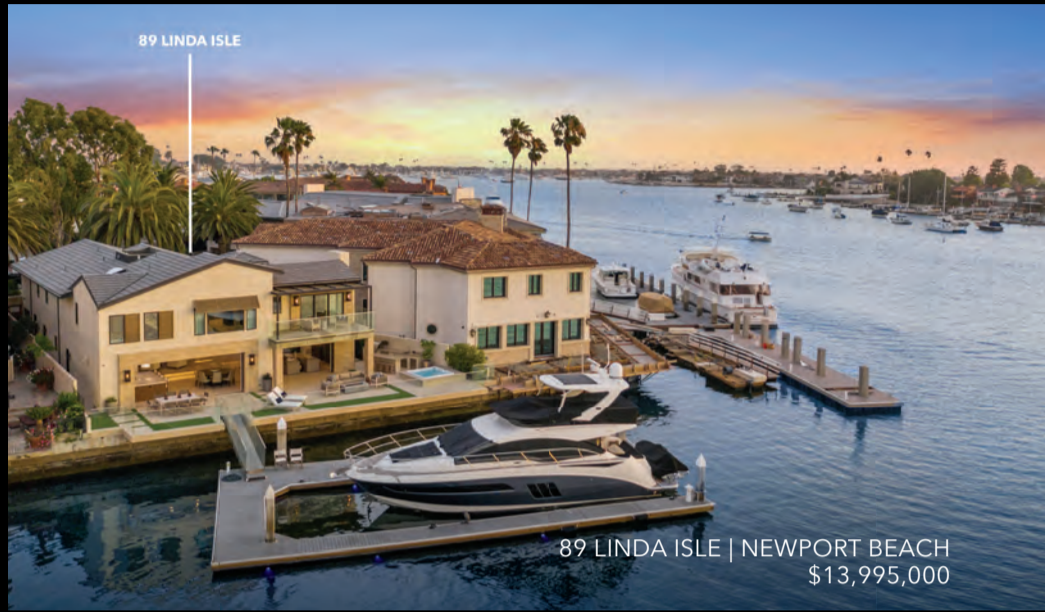
89 LINDA ISLE