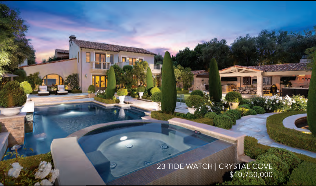
23 TIDE WATCH | CRYSTAL COVE $10,750,000