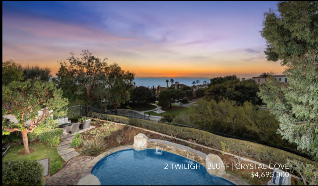
2 TWILIGHT BLUFF | CRYSTAL COVE $4,695,000