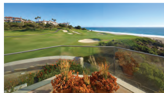
6 MONARCH COVE | JUST SOLD Dana Point Represented Buyer