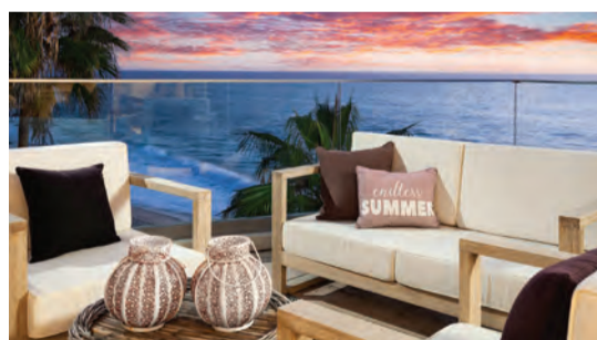
31897 CIRCLE DRIVE | IN ESCROW Laguna Beach | $6,198,000 Representing Seller