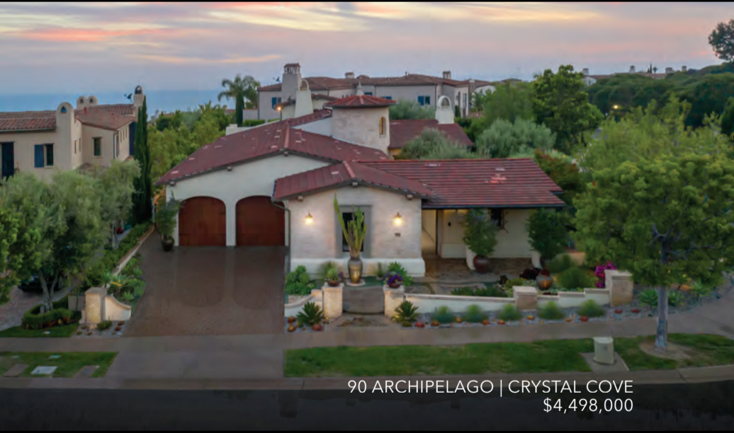
90 ARCHIPELAGO | CRYSTAL COVE $4,498,000