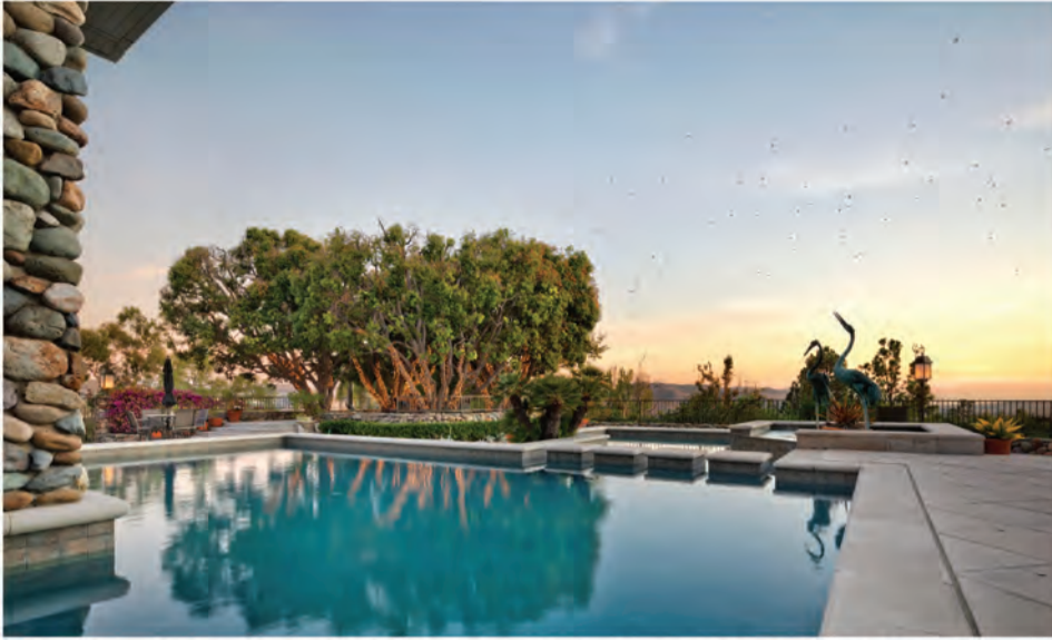
30552 HILLTOP WAY | SAN JUAN CAPISTRANO 9 BED | 9.5 BATH | 14,147 SQ FT | LEASE OPTION | $4,880,000

CANADAY GROUP ORANGE COUNTY LUXURY HOME SPECIALISTS