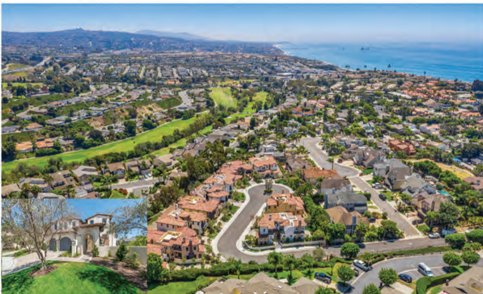
OCEAN DEL REY ESTATES | DANA POINT 7 NEW CONSTRUCTION HOMES 4-6 BED | OCEAN VIEW | ROOFTOP DECKS $1,789,000-$2,395,000