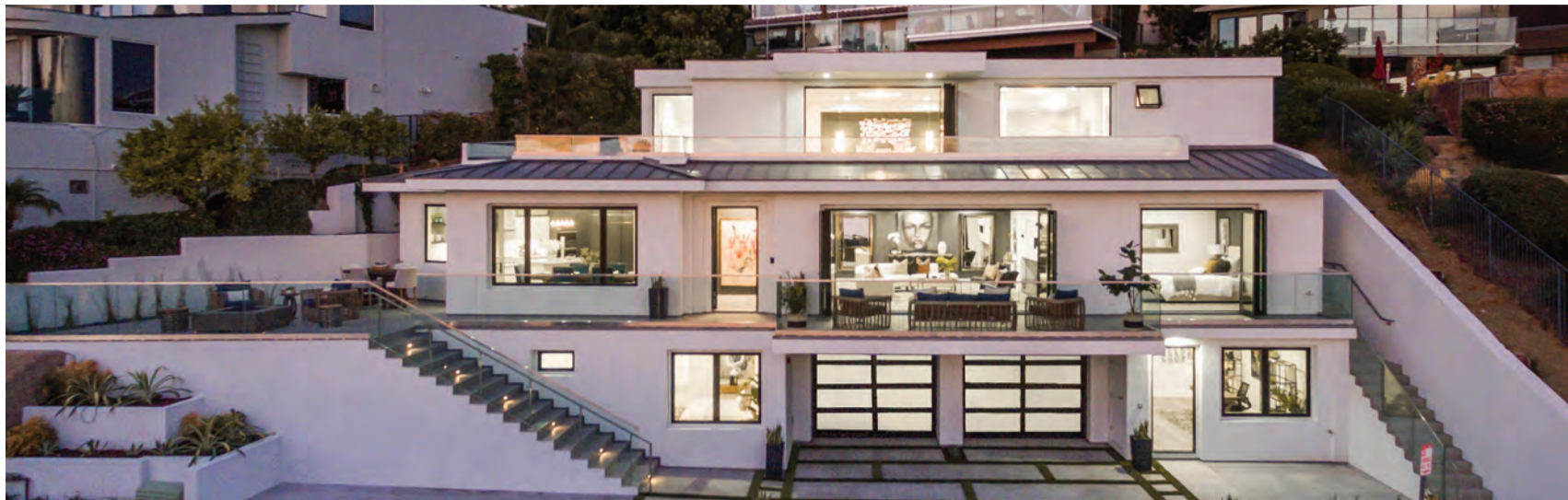
668 BUENA VISTA WAY | JUST SOLD Laguna Beach | $4,578,000 | Represented Seller

Sold with multiple offers after going into escrow after 14 days, at 98.3% of the asking price. *The primary objective of the Goldschwartz Team is to achieve the highest net proceeds for our clients.