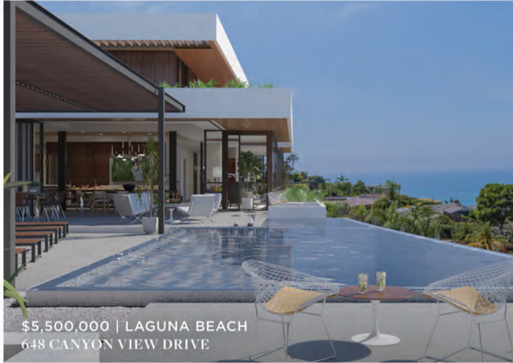
$5,500,000 | LAGUNA BEACH 648 CANYON VIEW DRIVE