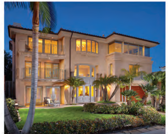
810 KINGS ROAD Newport Beach | $3,995,000 810KingsRoad.com