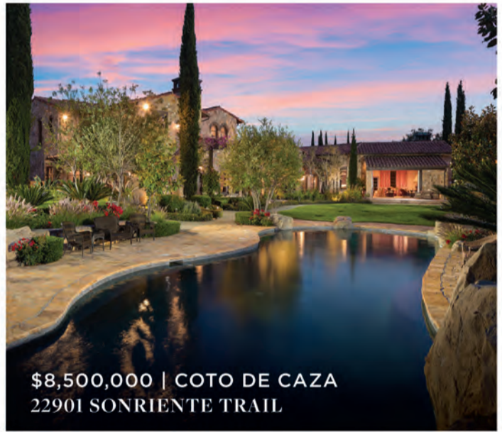
$8,500,000 | COTO DE CAZA 22901 SONRIENTE TRAIL