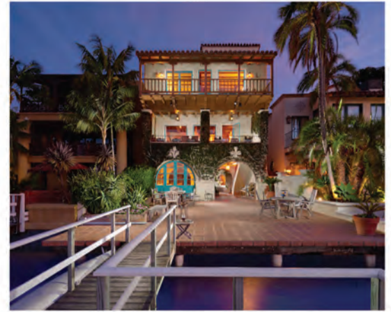
1707 EAST BAY AVENUE Newport Beach | $8,750,000 1707EBay.com