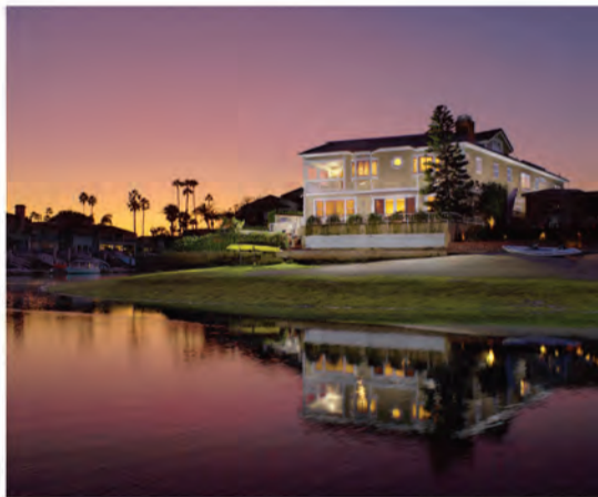
42 BALBOA COVES Newport Beach | $4,195,000 42BalboaCoves.com