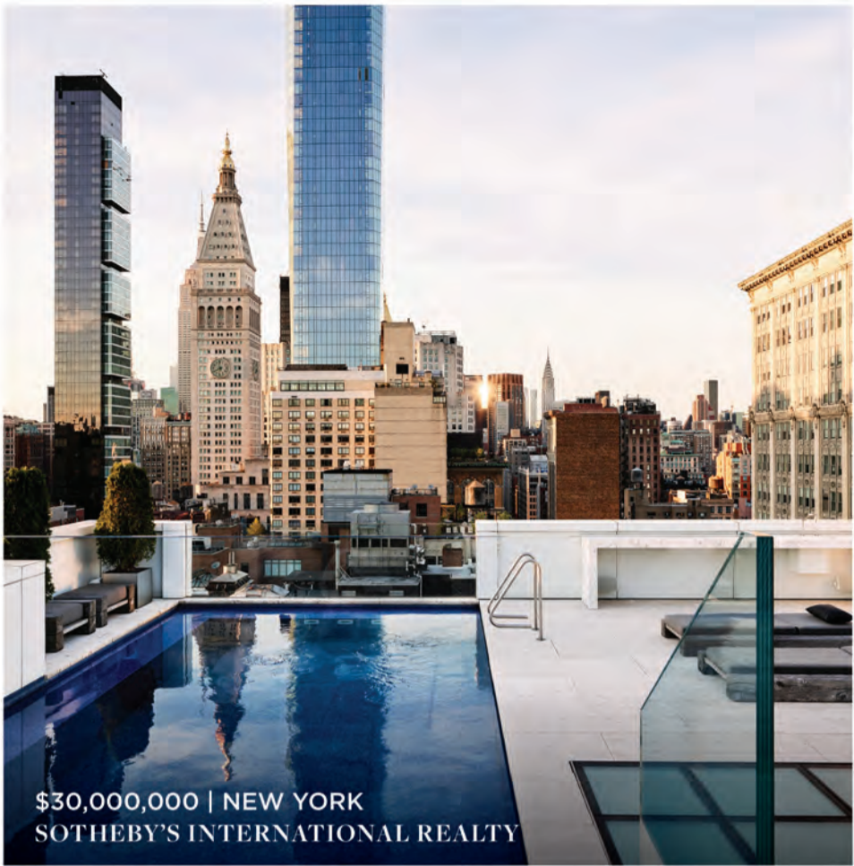
$30,000,000 | NEW YORK SOTHEBY'S INTERNATIONAL REALTY