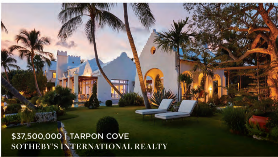
$37,500,000 | TARPON COVE SOTHEBY'S INTERNATIONAL REALTY