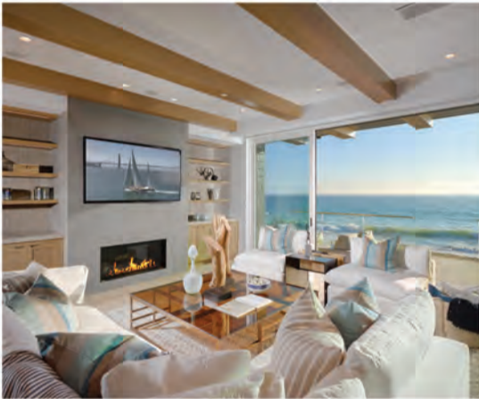
35351 BEACH ROAD | IN ESCROW Dana Point | $7,398,000 35351BeachRoad.com