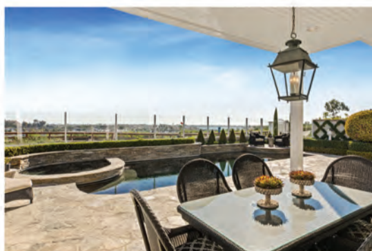
37 CAPE ANDOVER Newport Beach | $4,525,000