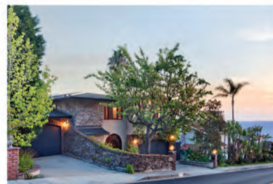
675 NYES PLACE Laguna Beach | $3,995,000