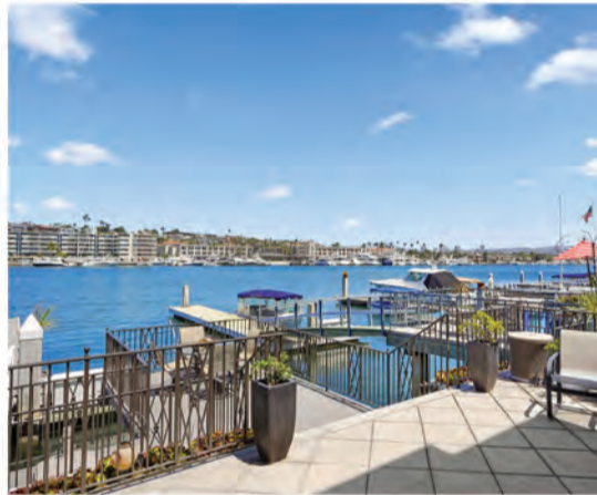
506 VIA LIDO NORD Newport Beach | $7,200,000 506ViaLidoNord.com