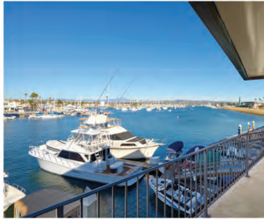
224 20TH STREET Newport Beach | $8,900,000 224-20thStreet.com