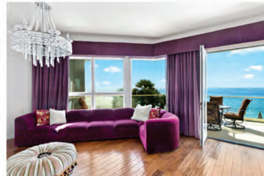
31099 COAST HIGHWAY Laguna Beach | $6,500,000