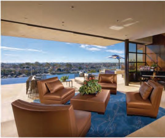
1301 DOLPHIN TERRACE Corona del Mar | $22,000,000 1301DolphinTerr.com