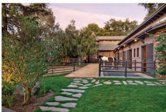
6909 EAST OAK LANE Orange | $5,288,000