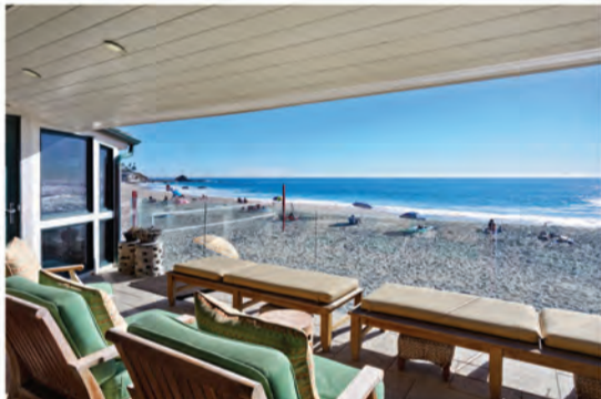
2800 OCEAN FRONT Laguna Beach | $19,999,999