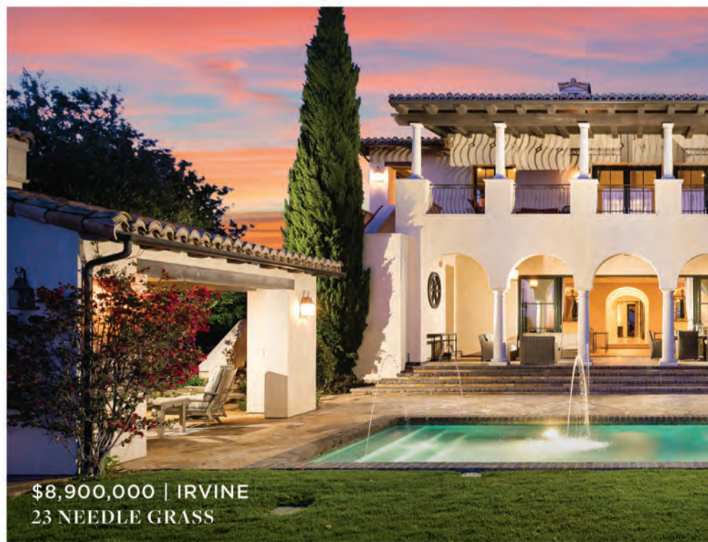
$8,900,000 | IRVINE 23 NEEDLE GRASS