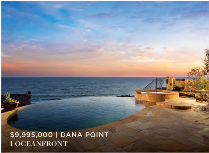
$9,995,000 | DANA POINT 1 OCEANFRONT