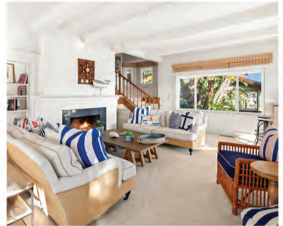
22 BAY ISLAND Newport Beach | $6,195,000 22BayIsland.com