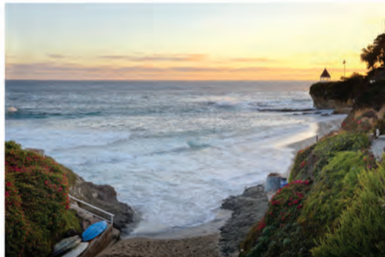
675 CLIFF DRIVE Laguna Beach | $8,875,000 or $30,000/mo.