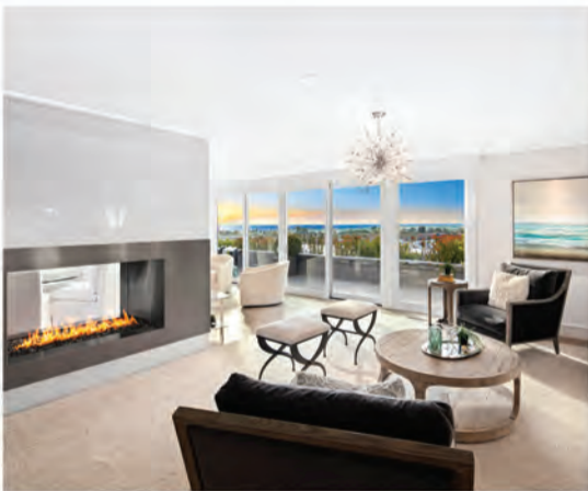
1115 WHITE SAILS WAY Corona del Mar | $4,649,000 1115WhiteSails.com