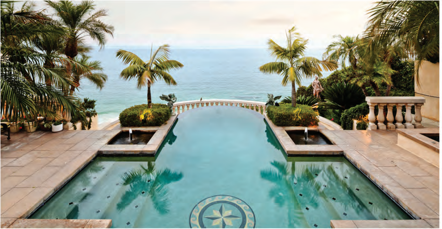
32101 COAST HIGHWAY | NEW LISTING Laguna Beach | $9,500,000