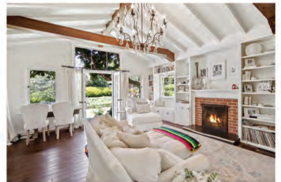
1786 SANTA CRUZ STREET Laguna Beach | $3,750,000