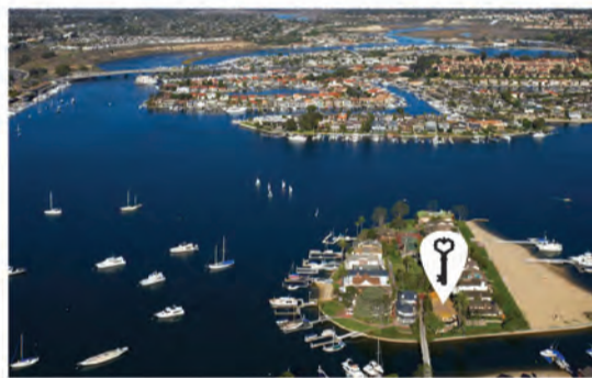
22 BAY ISLAND | PRICE REDUCTION Newport Beach | $5,750,000 22BayIsland.com