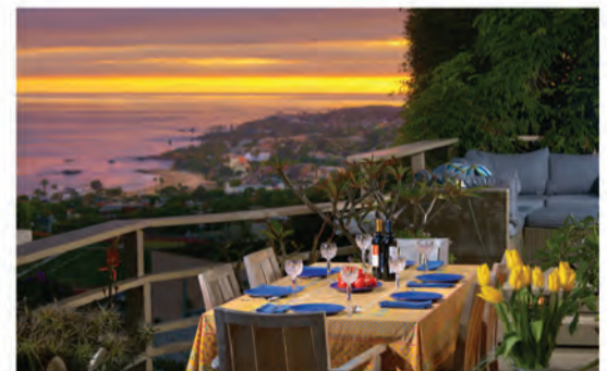
827 BUENA VISTA WAY Laguna Beach | $2,995,000 827BuenaVista.com