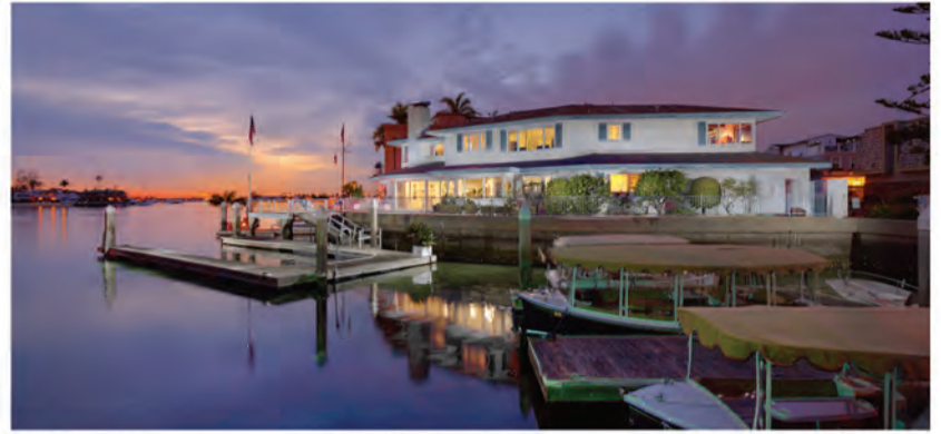
1 COLLINS ISLAND | PRICE REDUCTION Newport Beach | $9,250,000 | 1CollinsIsland.com