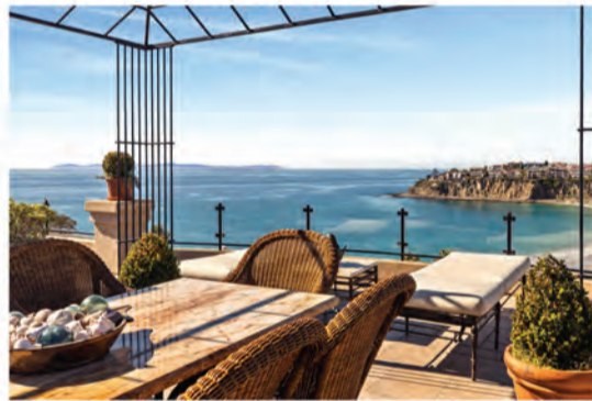
15 SMITHCLIFFS ROAD Laguna Beach | $9,350,000