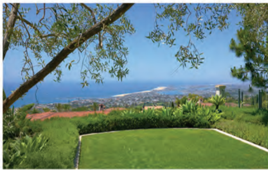
8 SKYRIDGE Newport Coast | $8,795,000 8Skyridge.com