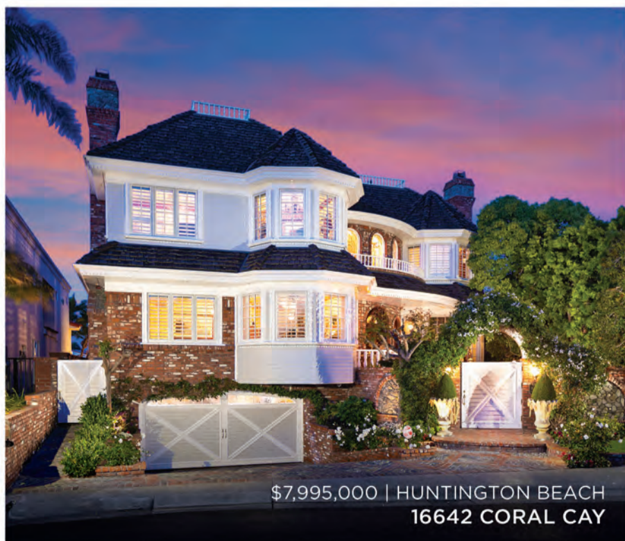
$7,995,000 | HUNTINGTON BEACH 16642 CORAL CAY