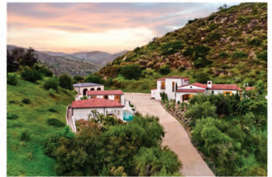
272 CANYON ACRES DRIVE | NEW LISTING Laguna Beach | $7,995,000