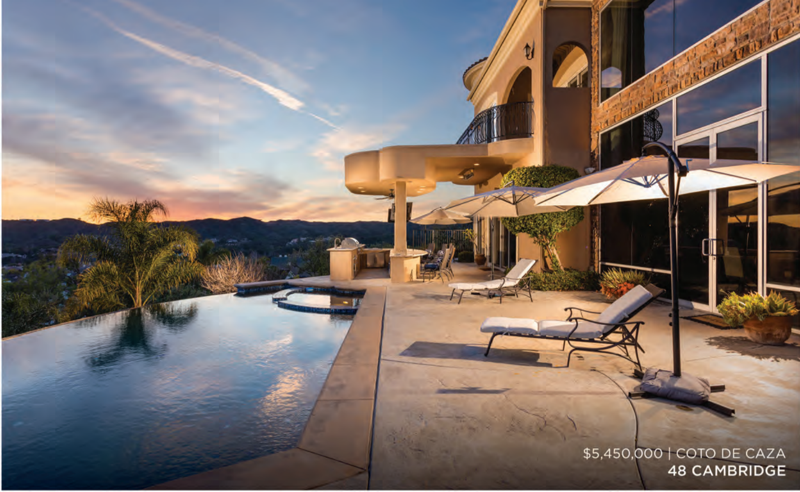
$5,450,000 | COTO DE CAZA 48 CAMBRIDGE