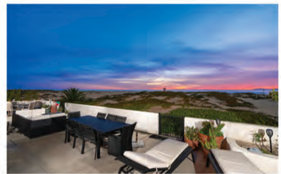
7406 WEST OCEANFRONT | $4,995,000 7404 WEST OCEANFRONT | $4,795,000 Newport Beach