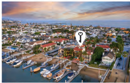
1707 EAST BAY AVENUE Newport Beach | $7,850,000 1707EBay.com