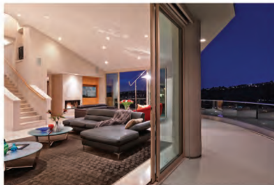
1388 LA MIRADA STREET Laguna Beach | $3,999,000