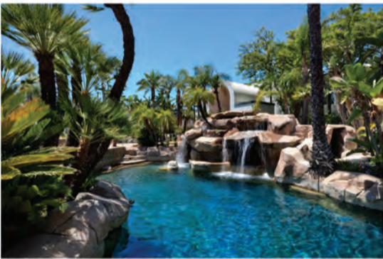
10252 SUNRISE LANE North Tustin | $19,900,000