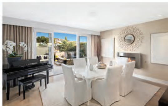
1115 WHITE SAILS WAY Corona del Mar | $4,649,000 1115WhiteSails.com