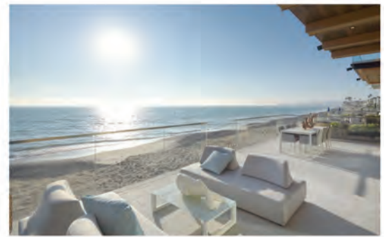
35351 BEACH ROAD Dana Point | $7,398,000 35351BeachRoad.com