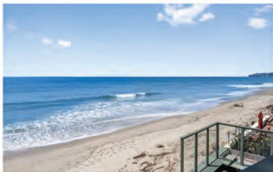
35155 BEACH ROAD Dana Point | $4,750,000 35155BeachRd.com