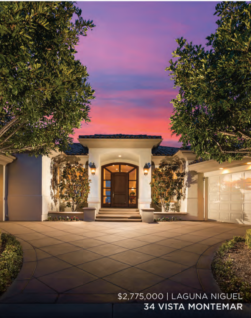
$2,775,000 | LAGUNA NIGUEL 34 VISTA MONTEMAR