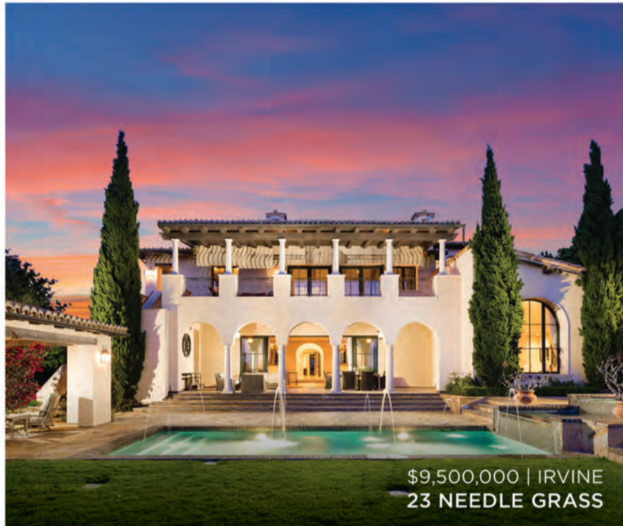
$9,500,000 | IRVINE 23 NEEDLE GRASS