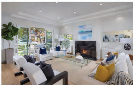
311 NARCISSUS AVENUE | PRICE REDUCTION Corona del Mar | $6,495,000 311Narcissus.com