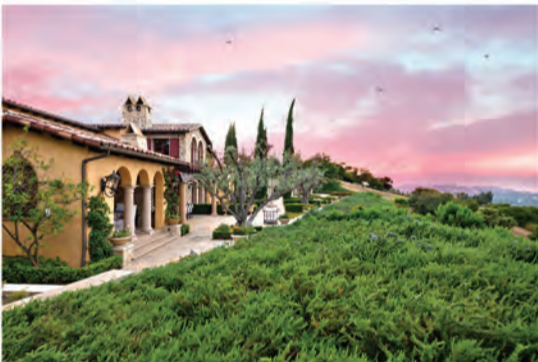
60 GOLDEN EAGLE Irvine | $19,000,000