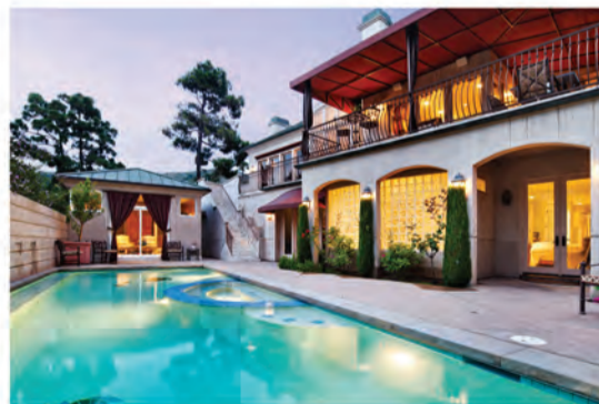
7 SMITHCLIFFS ROAD Laguna Beach | $3,995,000