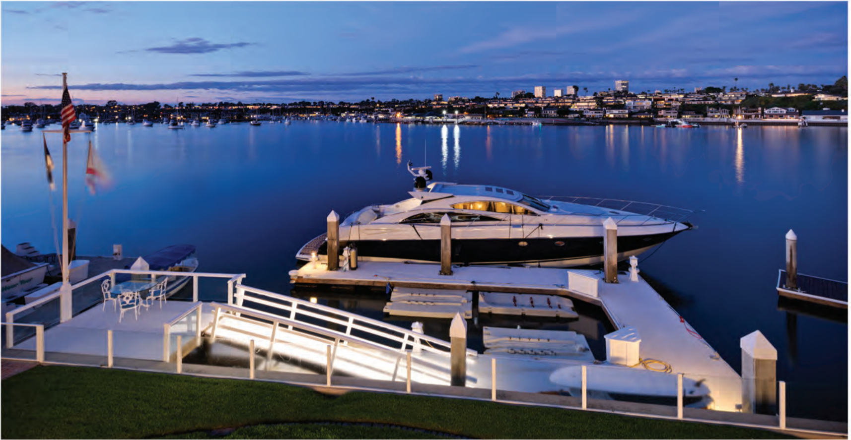
2104 EAST BALBOA BOULEVARD Newport Beach | $17,995,000