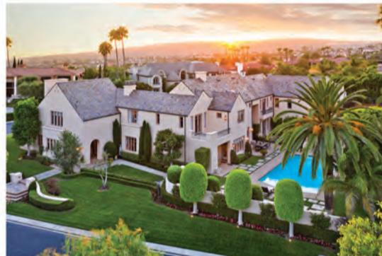
1 SEARIDGE Laguna Niguel | $6,495,000