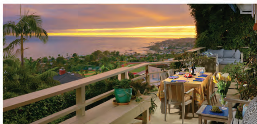
827 BUENA VISTA WAY

Newport Beach | 7406WOceanfront.com | 7404WOceanfront.com