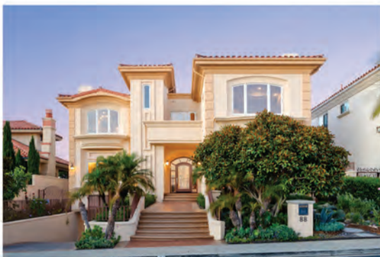
88 RITZ COVE DRIVE Dana Point | $4,995,000