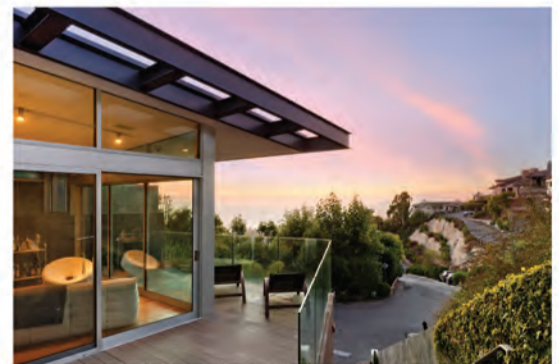
812 GAINSBOROUGH DRIVE Laguna Beach | $3,495,000