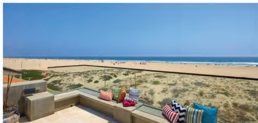
7304 WEST OCEANFRONT

Newport Coast | $6,999,000 | 25Overlook.com