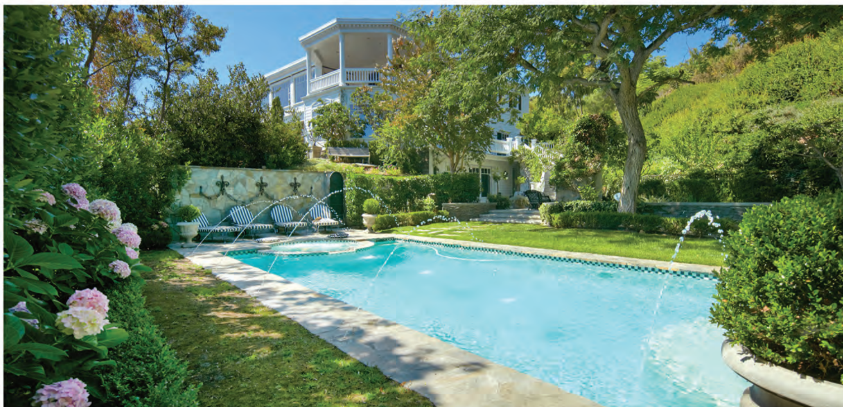
1 SAN MATEO WAY

Corona del Mar | $14,750,000 | 1SanMateoWay.com