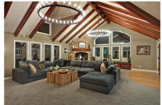
6909 EAST OAK LANE Orange | $5,288,000