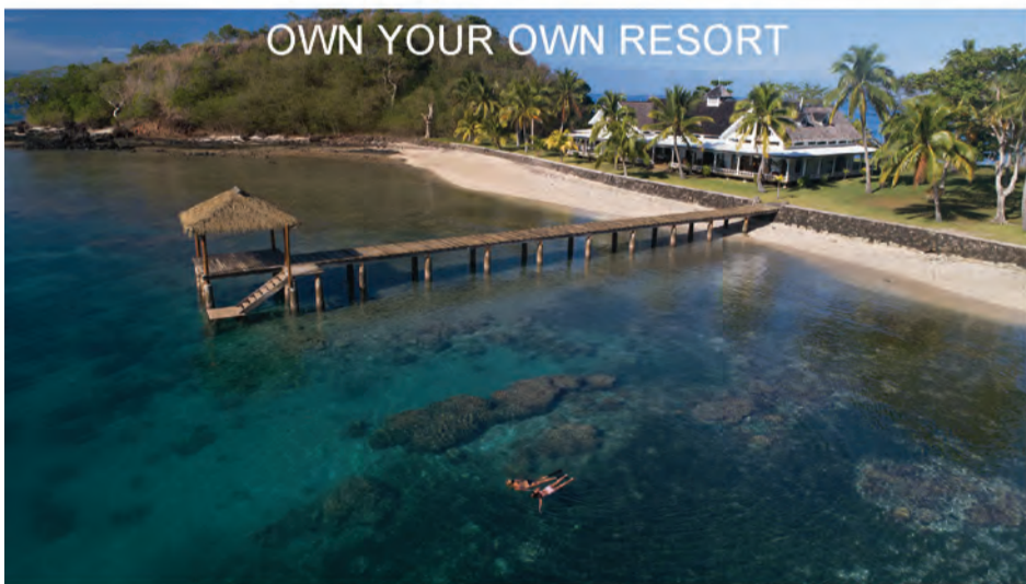
OWN YOUR OWN RESORT

125 VIA MURCIA | SAN CLEMENTE 3 BED | 3 BATH | 2,374 SQ FT | $1,348,888