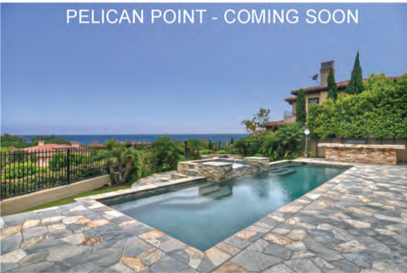
PELICAN POINT - COMING SOON

15 LOCHMOOR LN | NEWPORT BEACH 4 BED | 4 BATH | 5,298 SQ FT | $6,500,000