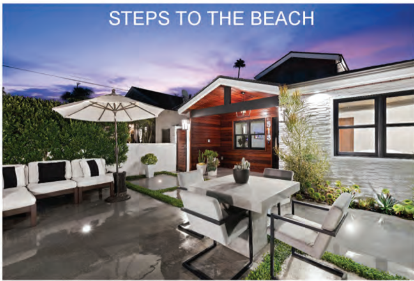
STEPS TO THE BEACH

CANADAY GROUP ORANGE COUNTY LUXURY HOME SPECIALISTS