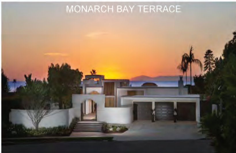
MONARCH BAY TERRACE

15 LOCHMOOR LN | NEWPORT BEACH 4 BED | 4 BATH | 5,298 SQ FT | $6,500,000