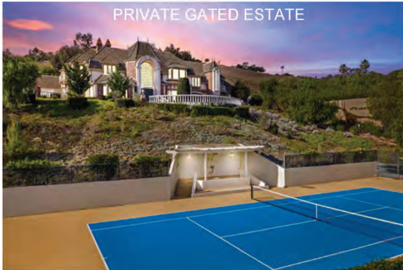
PRIVATE GATED ESTATE

CANADAY GROUP ORANGE COUNTY LUXURY HOME SPECIALISTS