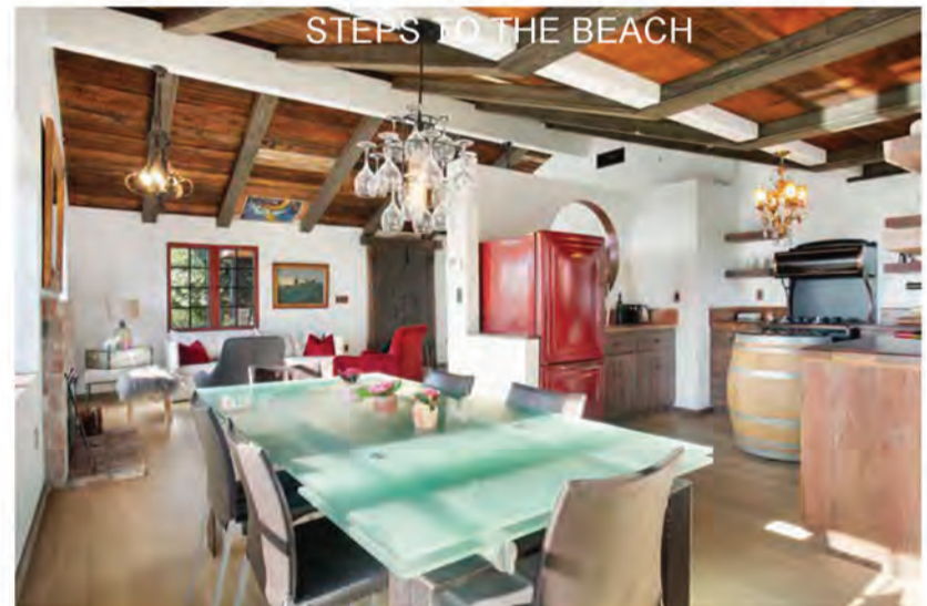
STEPS TO THE BEACH

5 SEAHAVEN | NEWPORT COAST 4 BED | 7 BATH | 5,654 SQ FT | $6,295,000