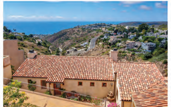
2516 TEMPLE HILLS DRIVE Laguna Beach | $4,495,000