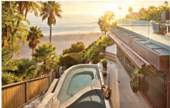
31921 COAST HIGHWAY Laguna Beach | $13,900,000