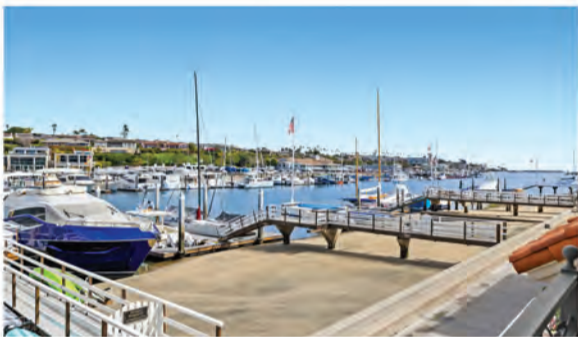
125 EAST BAY FRONT | IN ESCROW Newport Beach | $6,995,000 125EBayFront.com