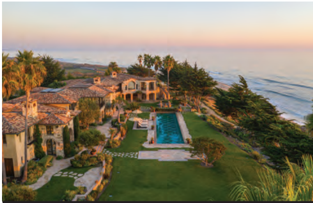
4130 CALLE ISABELLA, SAN CLEMENTE $38,000,000