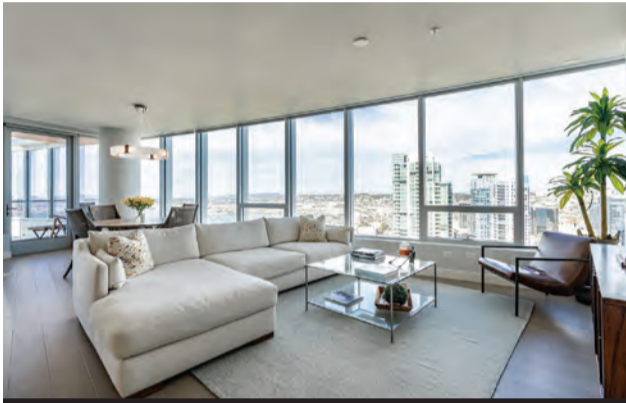
888 W E STREET #3101, SAN DIEGO $2,995,000