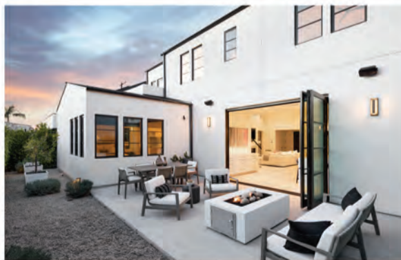
163 BROADWAY STREET Costa Mesa | $2,895,000