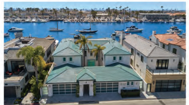
319 VIA LIDO SOUD | NEW LISTING Newport Beach | $20,000 Monthly