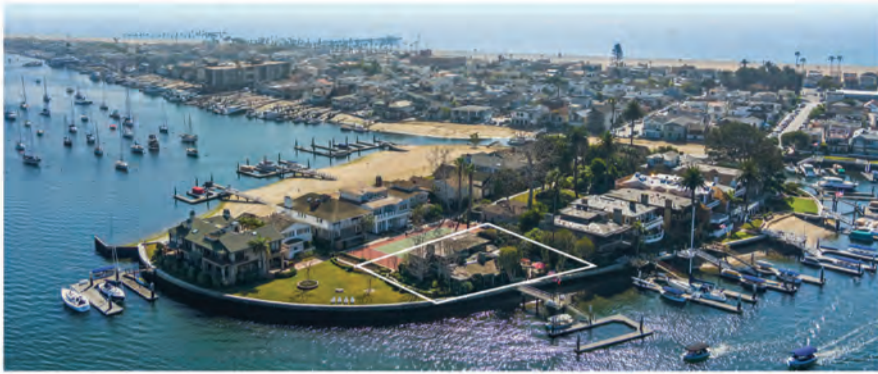
25 & 26 BAY ISLAND Newport Beach | $15,995,000 | 25and26BayIsland.com