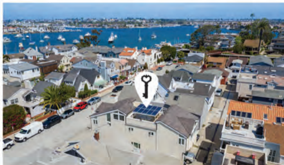
316 ISLAND AVENUE Newport Beach | $2,395,000 316IslandAve.com