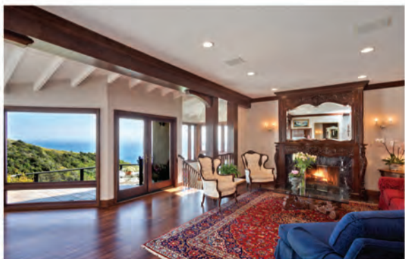
675 NYES PLACE Laguna Beach | $3,995,000