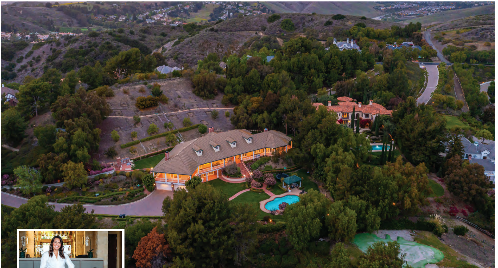
30712 STEEPLECHASE DRIVE, SAN JUAN CAPISTRANO $5,650,000