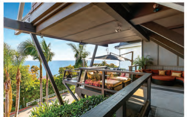
489 ALTA VISTA WAY Laguna Beach | $2,850,000