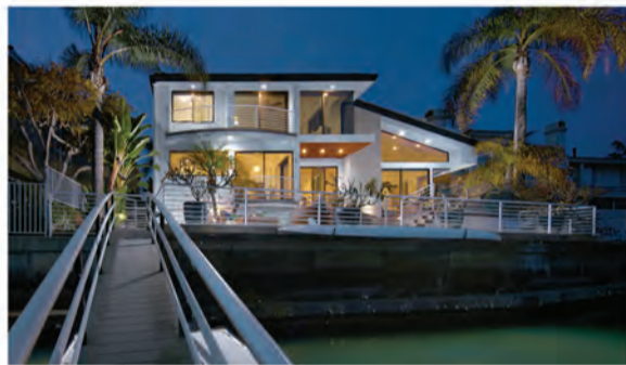
715 BAYSIDE DRIVE Newport Beach | $6,950,000 715BaysideDrive.com