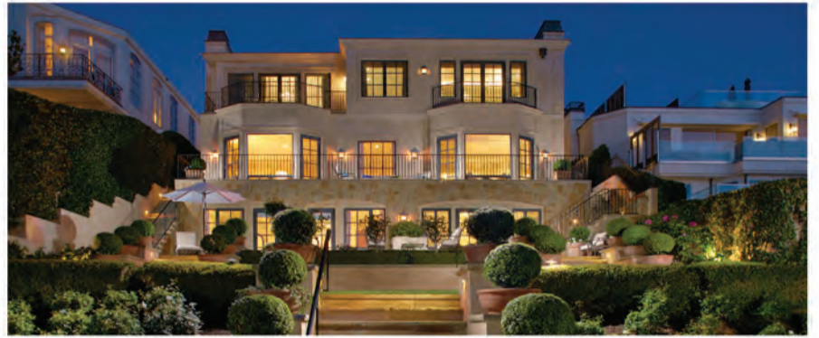
219 EVENING CANYON ROAD | PRICE REDUCTION Corona del Mar | $14,495,000 | 219EveningCanyonRoad.com