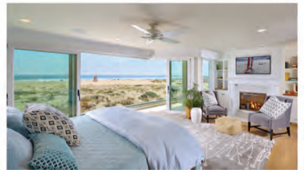
7304 WEST OCEANFRONT | IN ESCROW Newport Beach | $6,500,000 7304WOceanfront.com