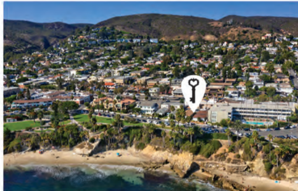
356 CLIFF DRIVE Laguna Beach | $6,395,000