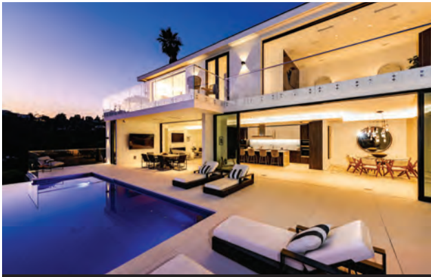
1037 STRADELLA ROAD, LOS ANGELES $14,990,000