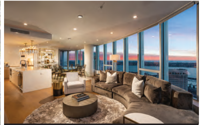
888 W E STREET #3102, SAN DIEGO $3,199,000