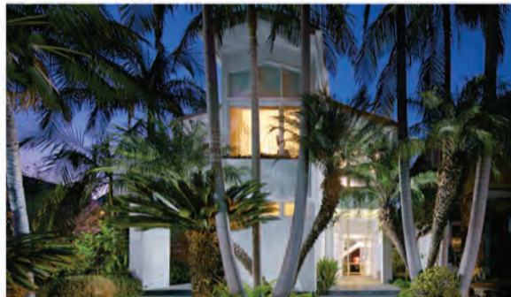
215 GOLDENROD AVENUE Corona del Mar | $4,495,000 215Goldenrod.com