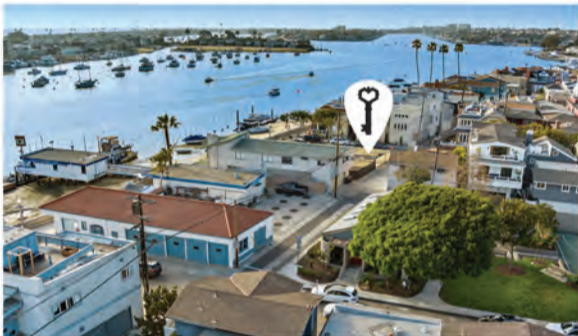
402 SOUTH BAY FRONT Newport Beach | $4,595,000