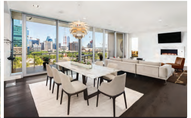
3130 N HARWOOD STREET #1001, DALLAS, TX $2,875,000