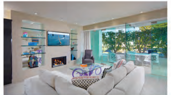
319 GRAND CANAL Newport Beach | $4,495,000 319GrandCanal.com