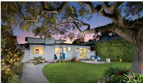
2909 BROAD STREET Newport Beach | $2,495,000 2909BroadStreet.com