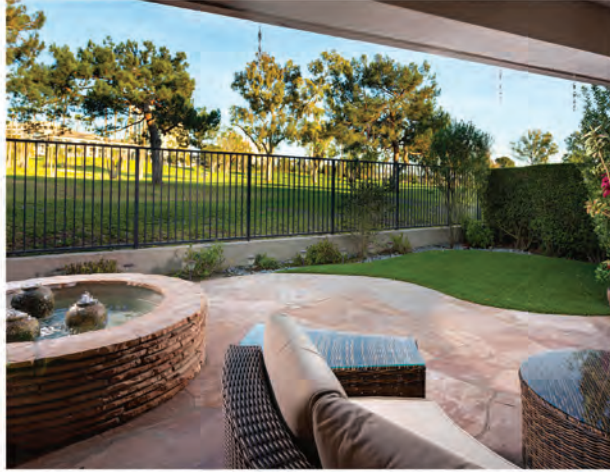
LEASED | $7,800/MO SEA ISLAND