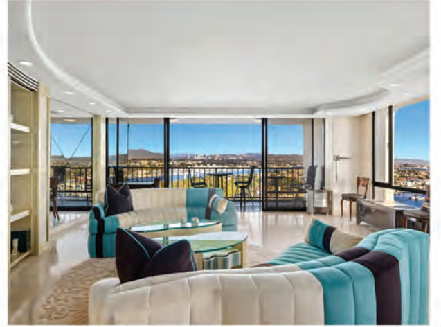
SOLD | $3,495,000 LP LIDO