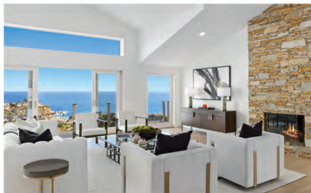
1020 EMERALD BAY | LAGUNA BEACH SOLD | $6,700,000 Represented Seller and Buyer