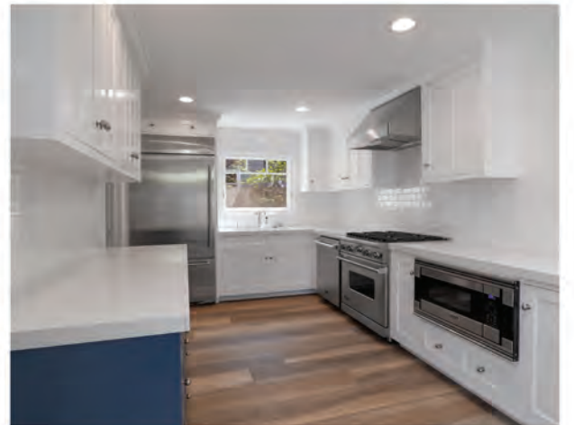
LEASED | $8,500/MO BAYSHORES