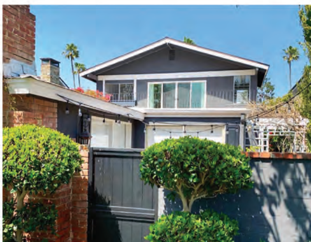
IN ESCROW | $3,195,000 BAYSHORES