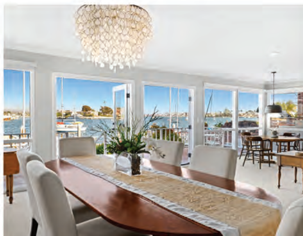
LEASED | $35,000/MO BAYSHORES