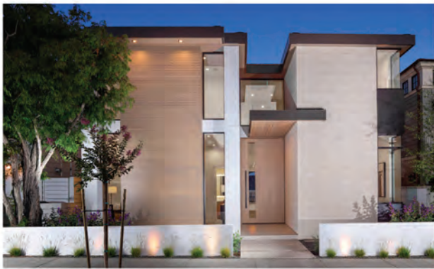
316 POPPY AVENUE | CORONA DEL MAR SOLD | $6,900,000 Represented Seller