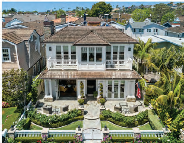
SOLD | $6,495,000 LP BAYSHORES