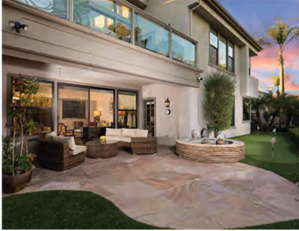
SOLD | $1,975,000 LP SEA ISLAND