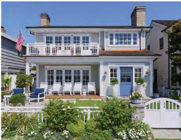
SOLD | $7,995,000 LP BAYSHORES