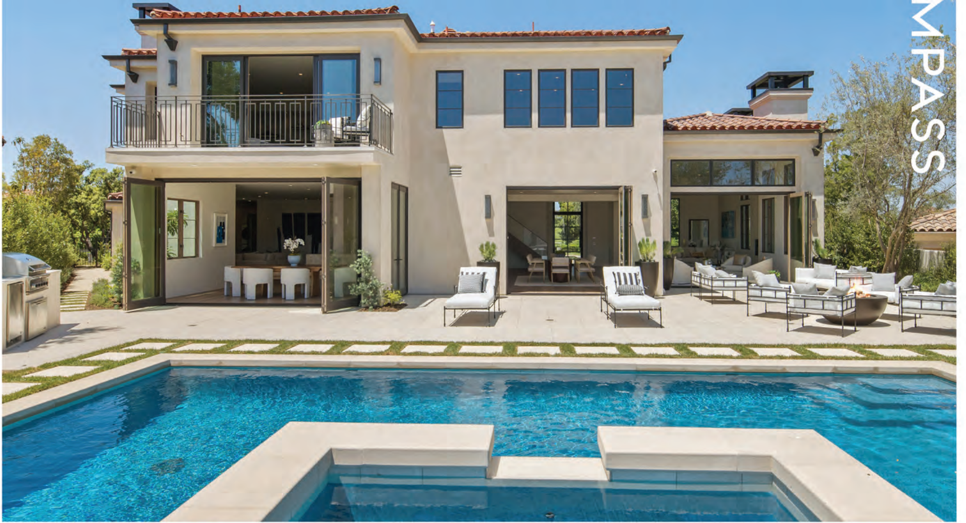
2 CLEARVIEW | NEWPORT COAST | SOLD | $8,800,000 | REPRESENTED SELLER