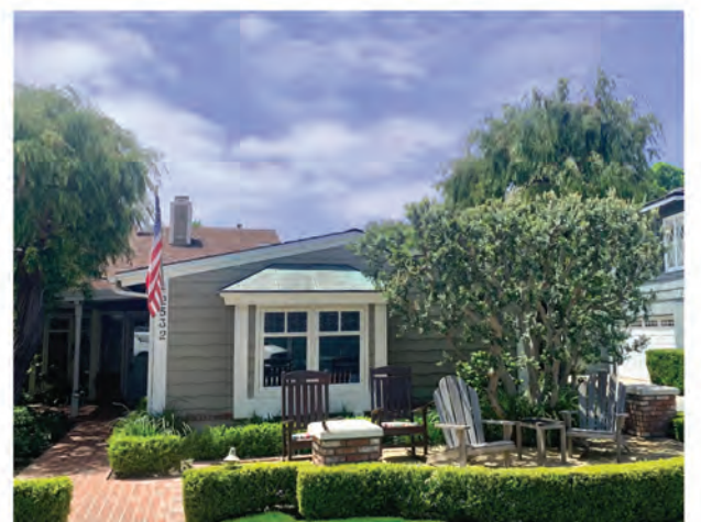
LEASED | $10,000/MO BAYSHORES