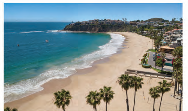
935 EMERALD BAY | LAGUNA BEACH SOLD | $5,425,000 Represented Seller and Buyer