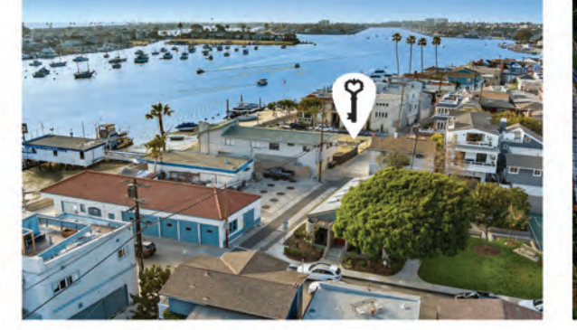
402 SOUTH BAY FRONT Newport Beach | $4,595,000