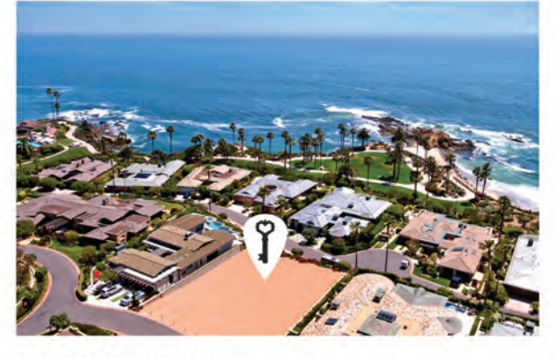
23 MONTAGE WAY Laguna Beach | $9,795,000