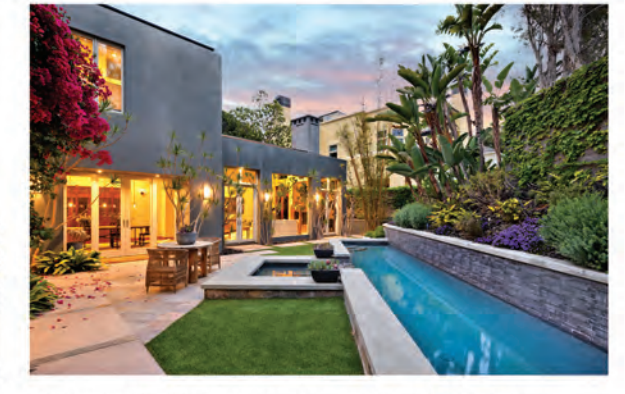
10 SMITHCLIFFS ROAD | NEW LISTING Laguna Beach | $4,899,000