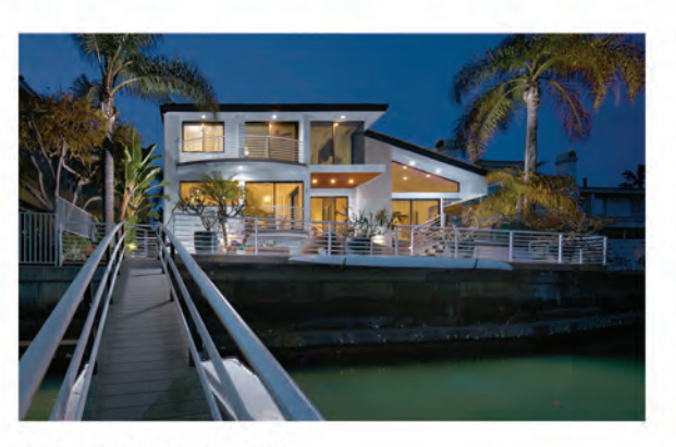
715 BAYSIDE DRIVE Newport Beach | $6,950,000 715BaysideDrive.com

STEVE HIGH 949 874 4724 shigh@villarealestate.com highcorkett.com @high_corkett DRE No. 00936421