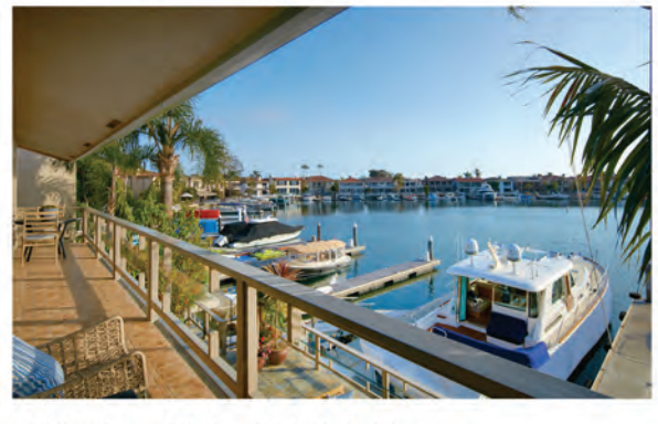
72 LINDA ISLE | NEW LISTING Newport Beach | $10,300,000 72Lindalsle.com