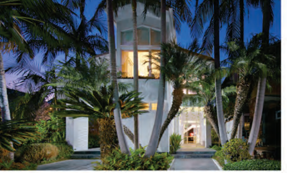
215 GOLDENROD AVENUE Corona del Mar | $4,495,000 215Goldenrod.com