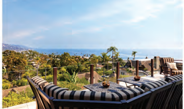
407 PINCECREST DRIVE Laguna Beach | $4,999,000