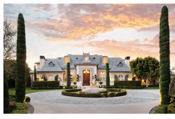
1 JENCOURT Laguna Niguel | $10,995,000

1 AVALON VISTA Newport Coast | $15,995,000