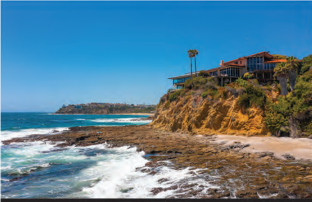
102 MCKNIGHT DRIVE, LAGUNA BEACH $11,849,000