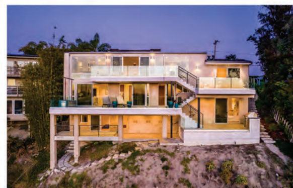
2390 TEMPLE HILLS DRIVE Laguna Beach | $2,995,000