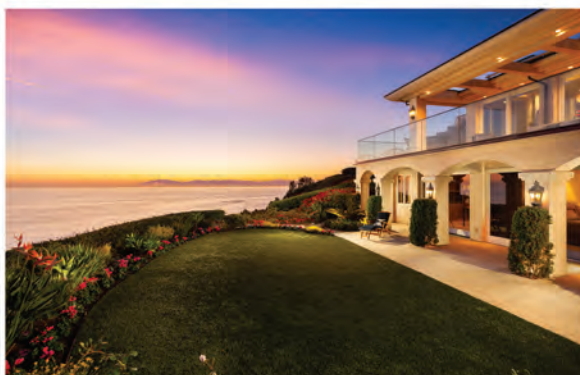
33 MONARCH BAY DRIVE Dana Point | $20,995,000