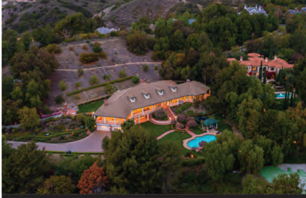
30712 STEEPLECHASE DRIVE, SAN JUAN CAPISTRANO $4,995,000