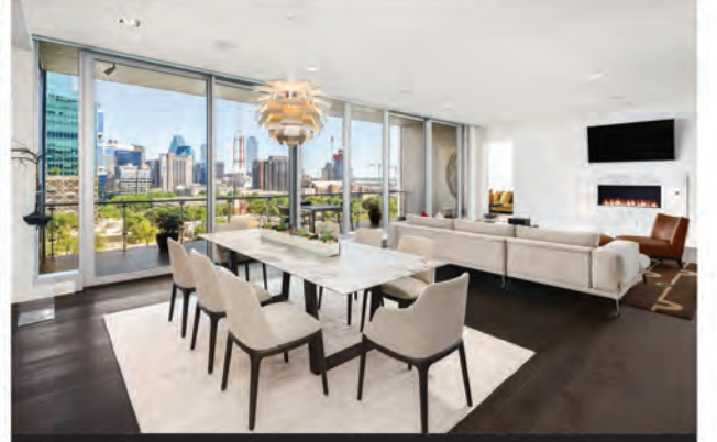
3130 NORTH HARWOOD STREET #1001, DALLAS $2,875,000