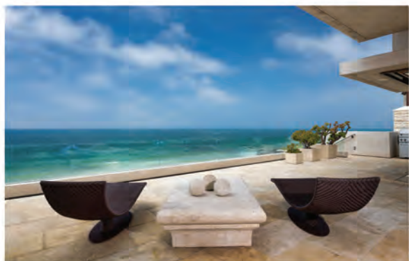
31 STRAND BEACH DRIVE | NEW LISTING Dana Point | $23,500,000