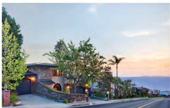
675 NYES PLACE Laguna Beach | $3,995,000