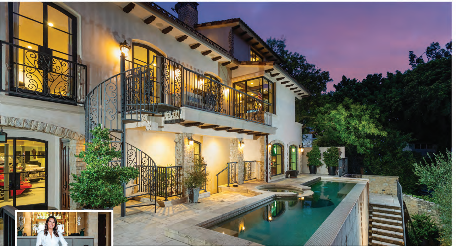
216 KINGS PLACE, NEWPORT BEACH $9,750,000