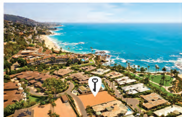
23 MONATGE WAY Laguna Beach | $9,795,000