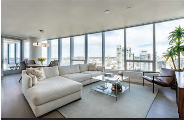
888 W E STREET #3101, SAN DIEGO $2,995,000