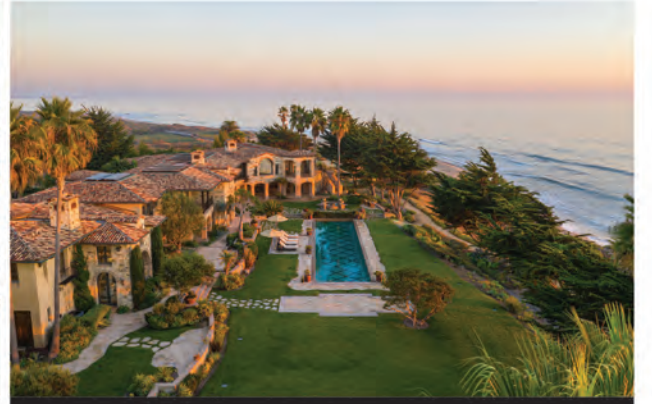
4130 CALLE ISABELLA, SAN CLEMENTE $38,000,000