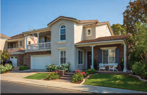
6 VICTORIA LANE, COTO DE CAZA $1,625,000