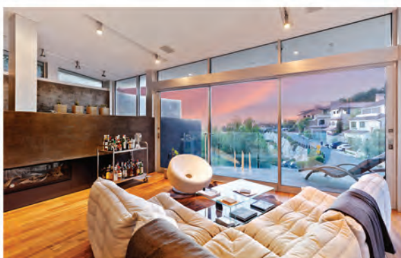
812 GAINSBOROUGH DRIVE Laguna Beach | $3,295,000