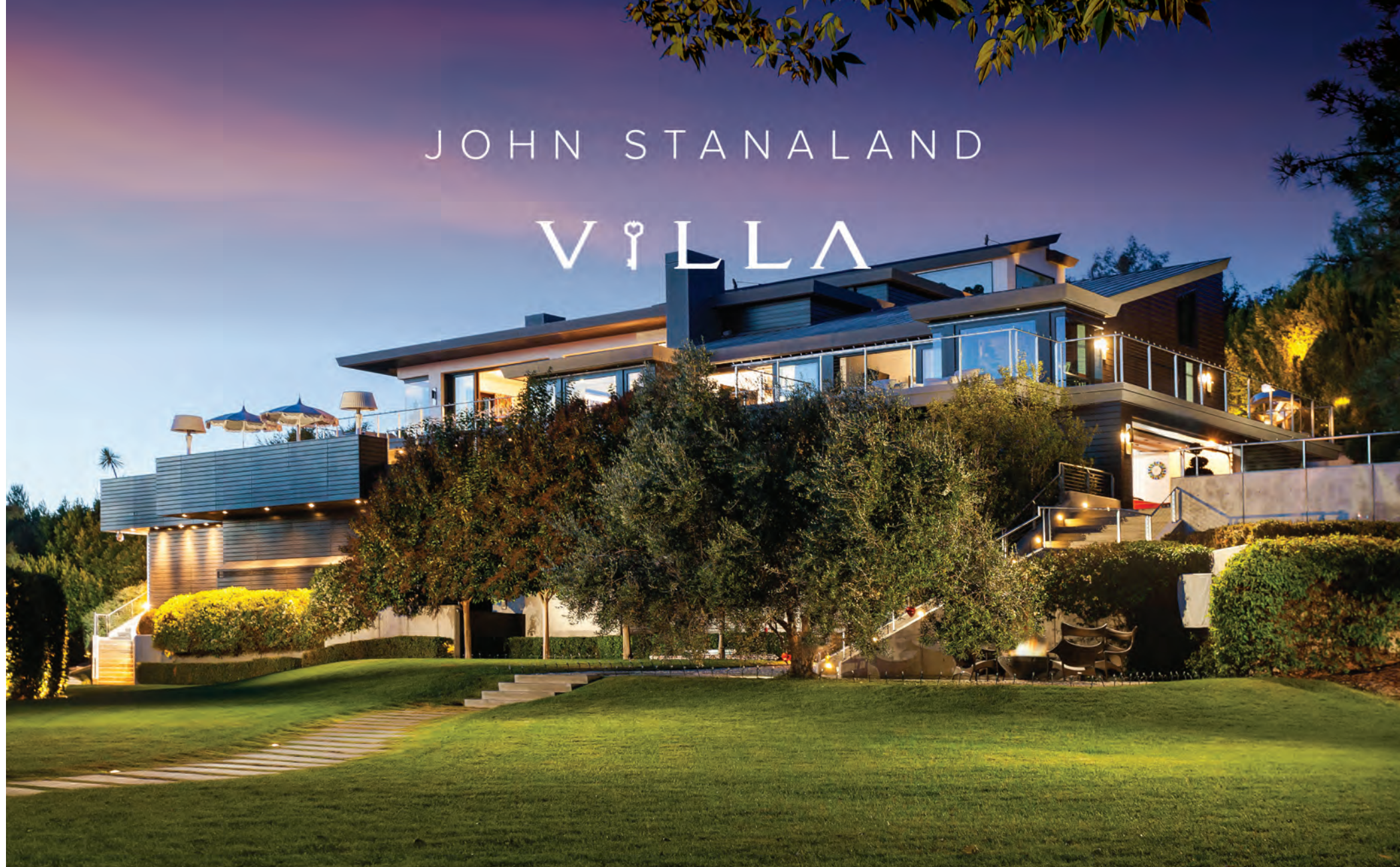
4700 SURREY DRIVE Corona del Mar | $28,000,000