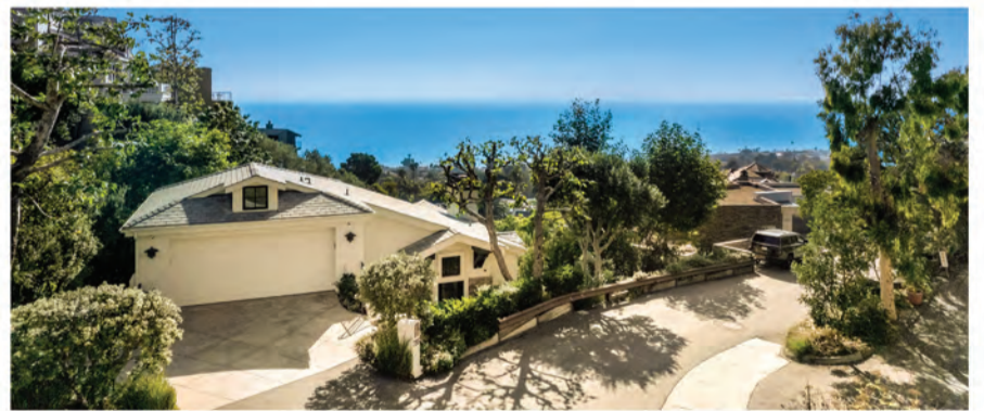
785 GAINSBOROUGH DRIVE Laguna Beach | $4,595,000