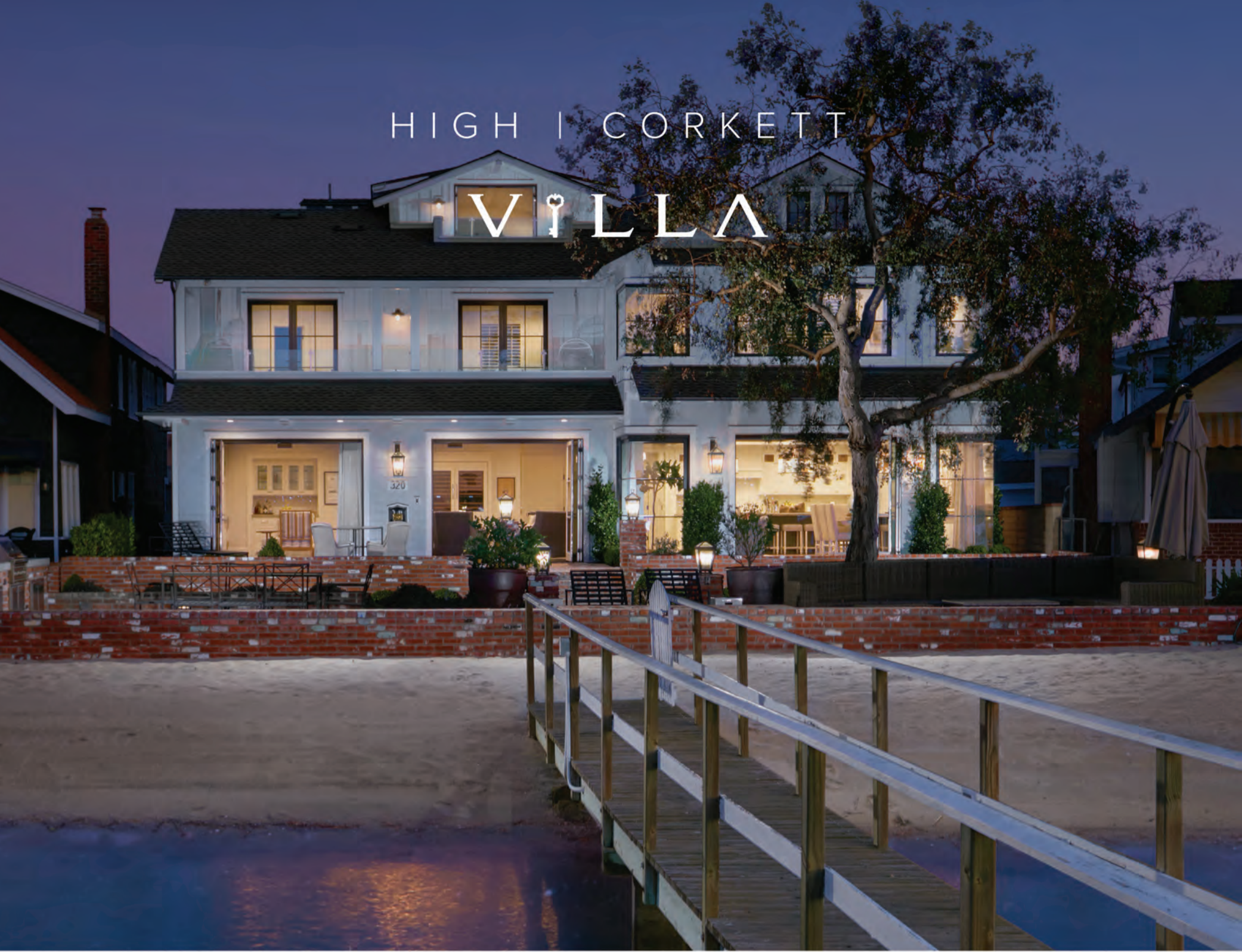
320 BUENA VISTA | NEW LISTING Newport Beach | $24,000,000 | 320BuenaVis.com