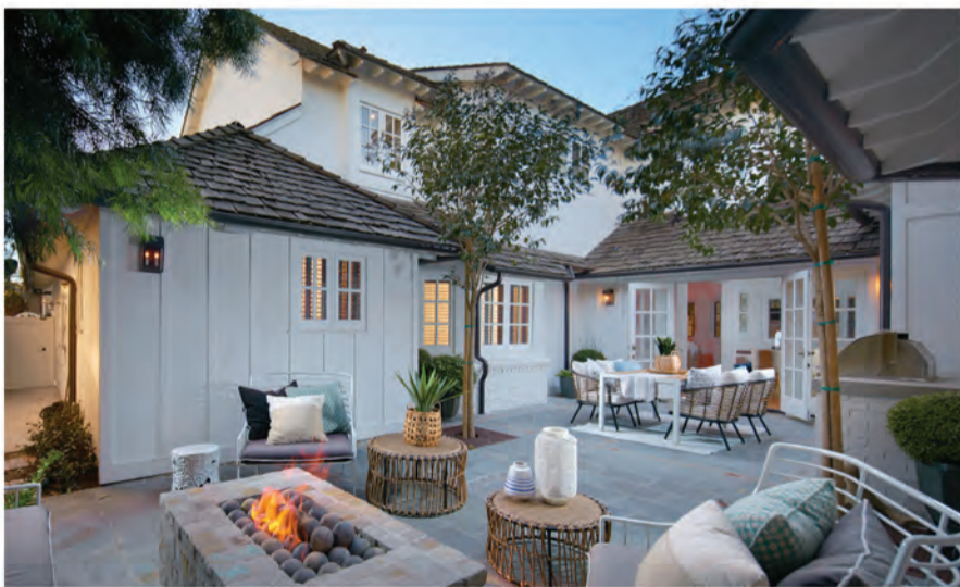
2592 CIRCLE DRIVE | NEW LISTING Newport Beach | $6,995,000 | 2592CircleDrive.com