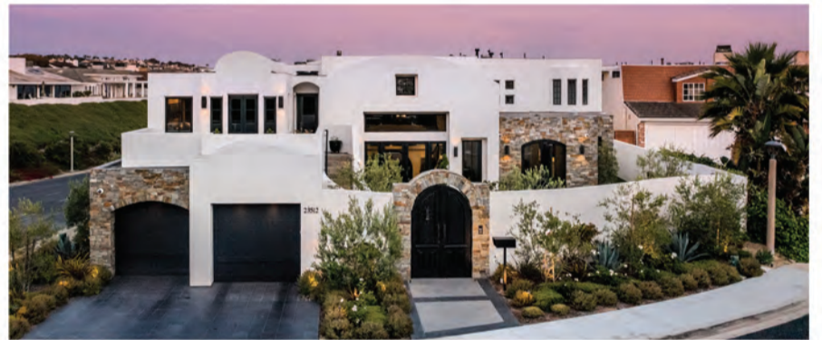
23512 SEAWARD ROAD Dana Point | $9,995,000