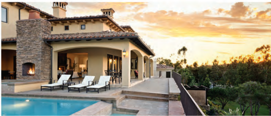
30302 VIA BELLA San Juan Capistrano | $4,795,000