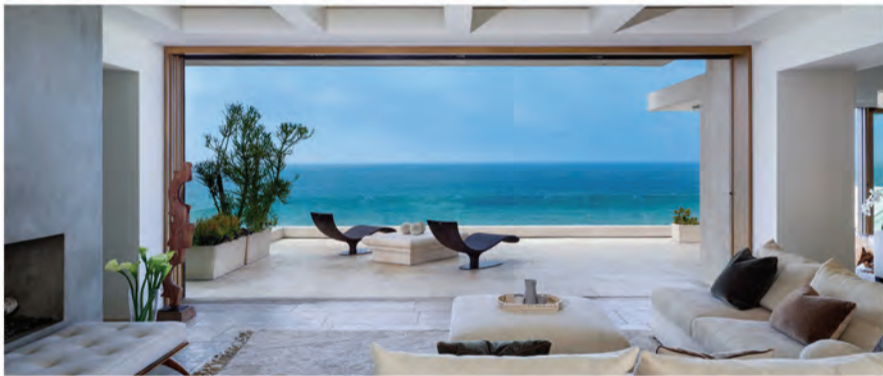
31 STRAND BEACH DRIVE Dana Point | $22,500,000