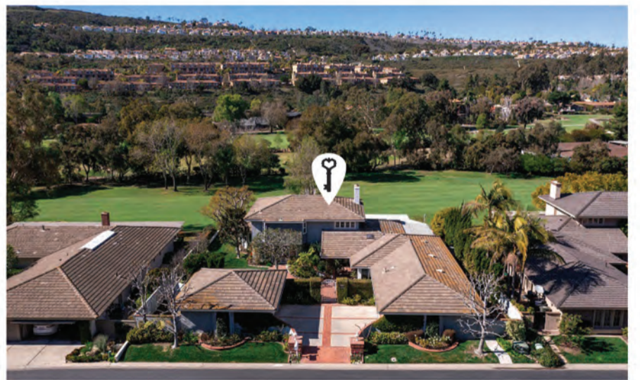
30901 GREENS EAST DRIVE | NEW LISTING Laguna Niguel | $2,900,000 | 30901GreensEast.com