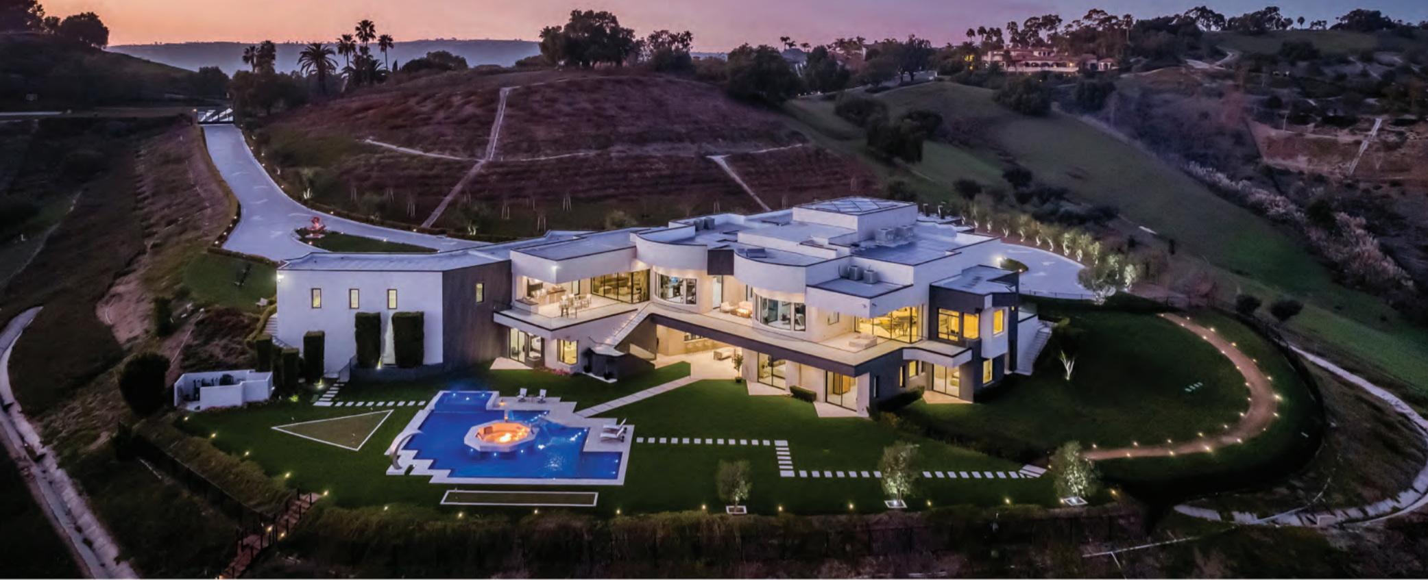
13 OLD RANCH ROAD | NEW LISTING Laguna Niguel | $50,000,000