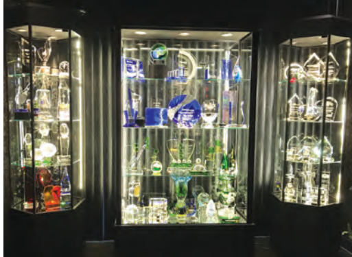
Crystal Room at Tustin Awards

For more than 40 years, Tustin Awards has proudly served Tustin and beyond. Whether you need a small engraved plate or elite awards for your corporate recognition program, Tustin Awards takes pride in every order.