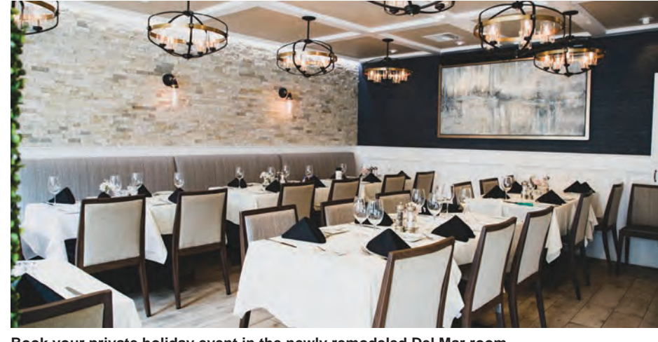
Book your private holiday event in the newly remodeled Del Mar room

Book your next group at the Hilton Orange County/Costa Mesa and receive bonus Hilton Honors Points. Please contact the Sales Office and mention promo code "Hilton Honors" for more information. 714-438-4910