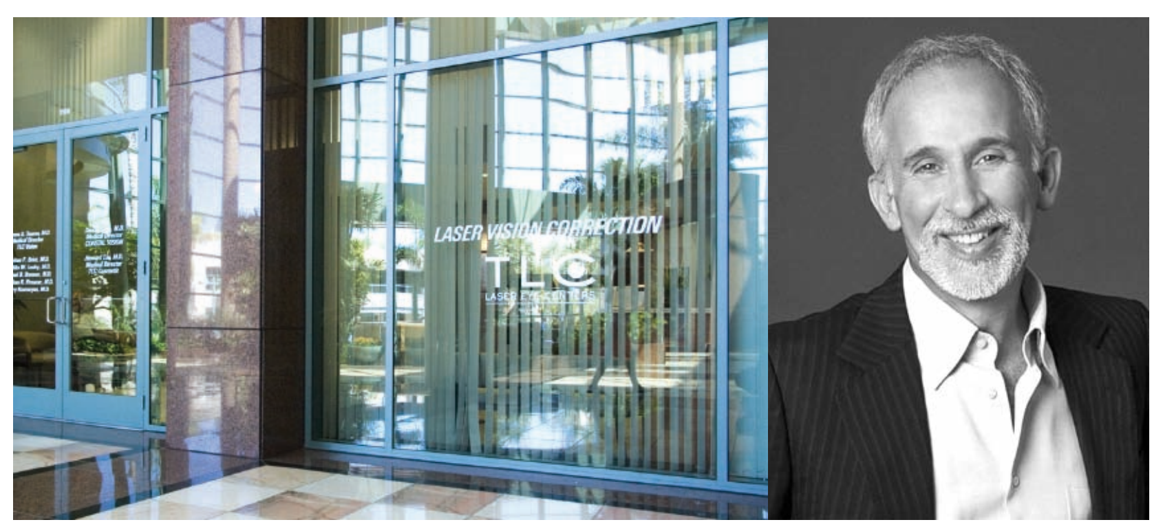
TLC Laser Eye Centers, Newport Beach Location