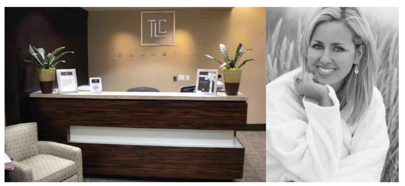
TLC Cosmetic Reception Area, Newport Beach

TLC Cosmetic serves you in Newport Beach, and coming soon: San Diego.