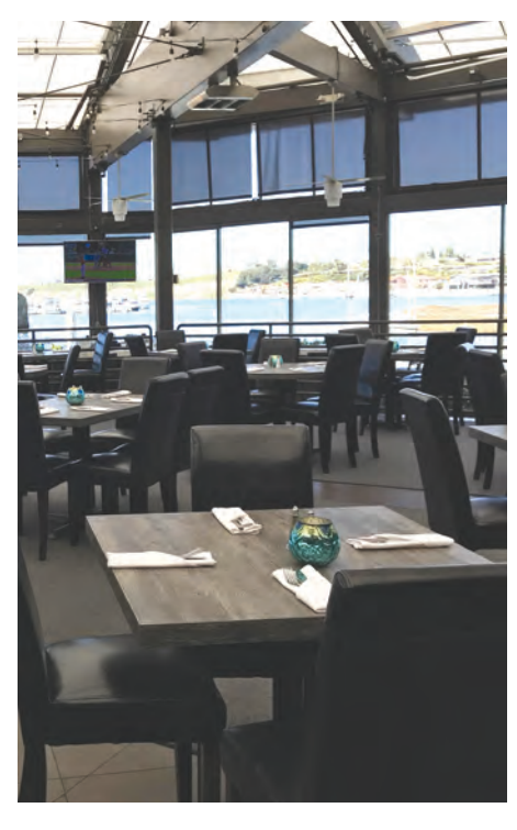
For parties in the hundreds, there is the Marina Terrace, an expansive grass area on the Marina side of the lagoon that offers maximum flexibility and includes plenty of room for your fundraiser, super-sized corporate dinner, luau or festival, with impeccable views of both the lagoon and harbor.

For more elegant affairs, consider the Gazebo, with an elegant lawn area set along the waterfront. This tranquil spot has the same beachy endowments that Pavilions possess, and its garden-style gazebo in Spanish tile, enclosed lawn and white picket fence make it even more charming.