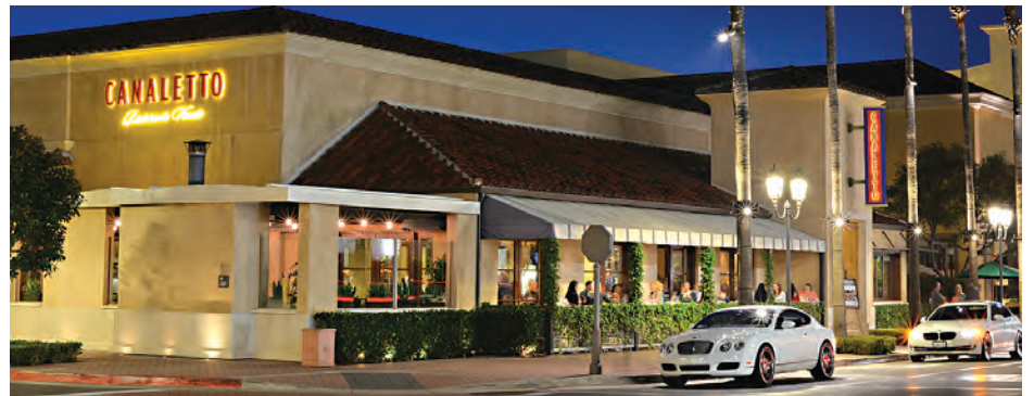
Canaletto is located in Newport Beach's Fashion Island.