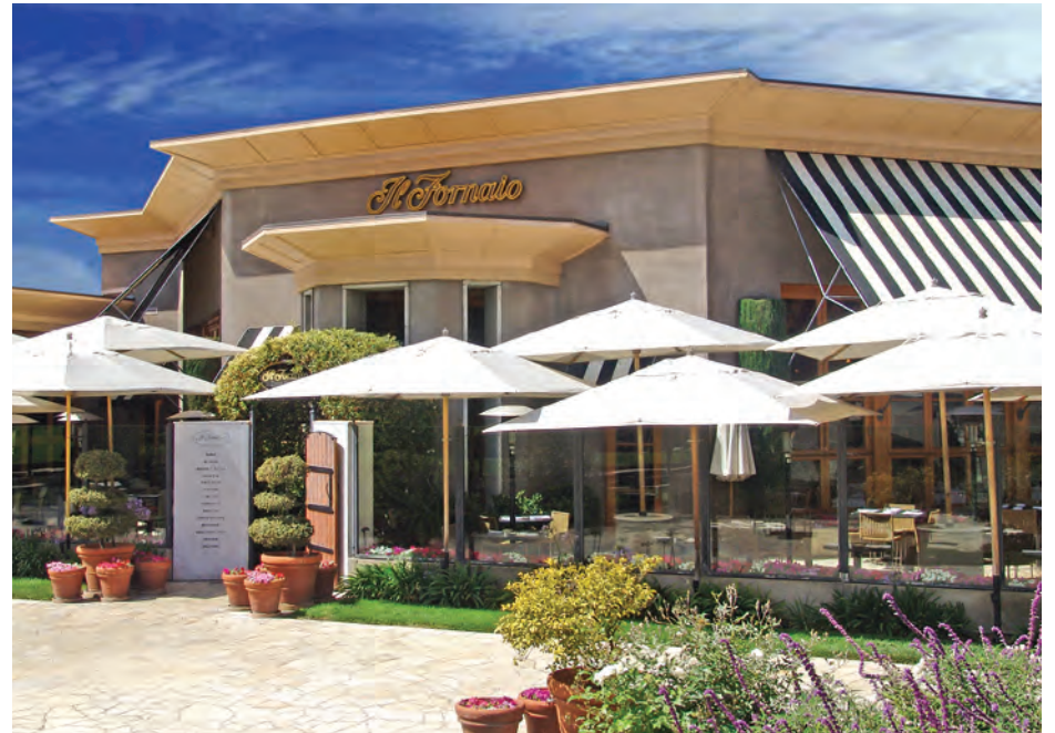
Il Fornaio aspires to bring its guests closer to Italy with each visit to the restaurant.