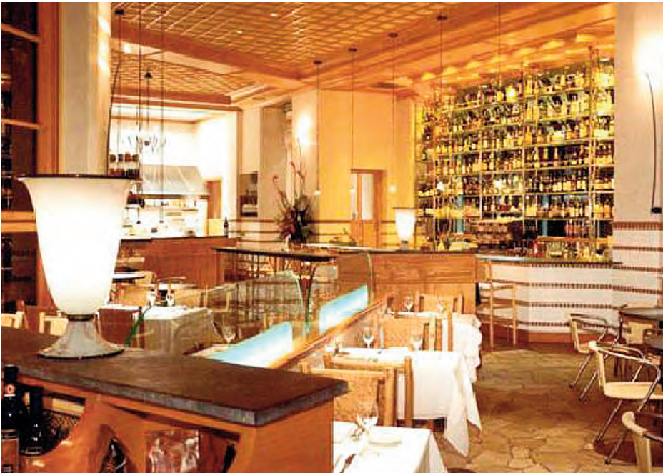
Enjoy authentic cuisine paired with regional wines at Il Fornaio.