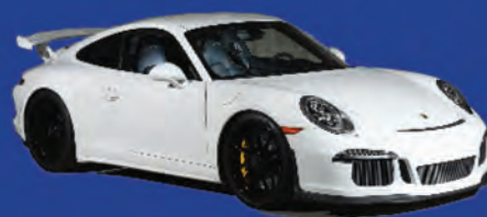
2015 PORSCHE 911 GT3 $159,000

Woodside Payment 1 : $883 Standard Bank 2 : $1,385 Yearly Savings: $4,892