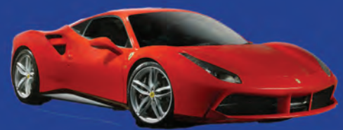
2020 FERRARI 488 $455,000

Woodside Payment 1 : $1,278 Standard Bank 2 : $2,560 Yearly Savings: $11,604