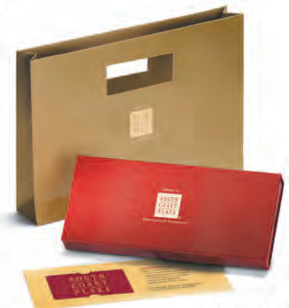
South Coast Plaza Gift Card

SAN DIEGO FWY (405) AT BRISTOL ST., COSTA MESA, CA 800.782.8888 SOUTHCOASTPLAZA.COM @SouthCoastPlaza #SCPStyle