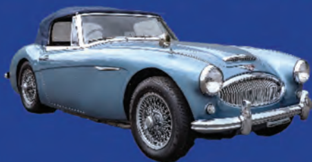
1963 AUSTIN HEALEY 3000 MARK II $86,000

DRIVE HOME A COLLECTOR CAR FOR THE SAME MONTHLY PAYMENT AS A DAILY DRIVER