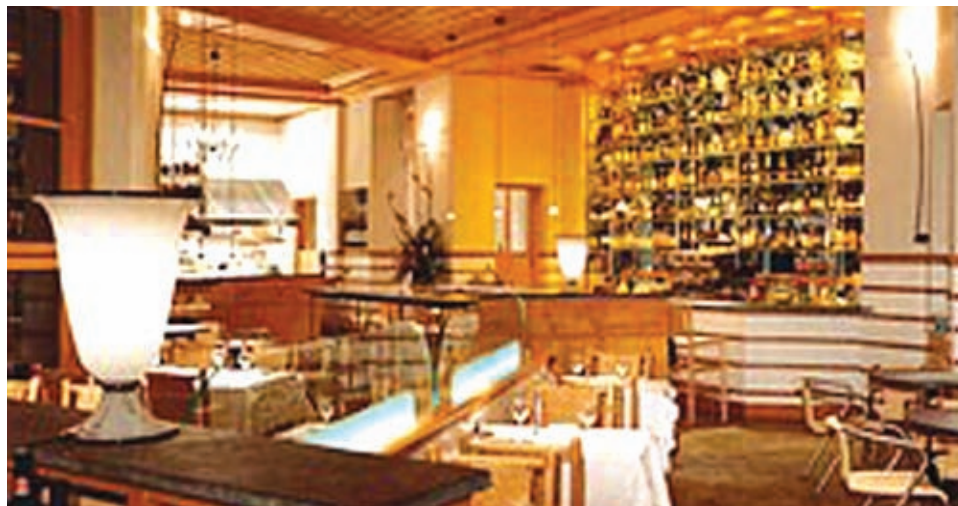
Enjoy authentic cuisine paired with regional wines at Il Fornaio

To make reservations please call 949.640.0900