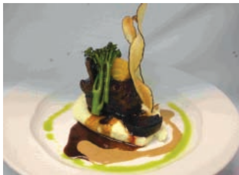
Braised short ribs are a tempting choice on the prix fixe menu

During November the choice is all yours! Guests who dine early at The First Cabin Restaurant can select from a number of choices for two or three courses. For the first