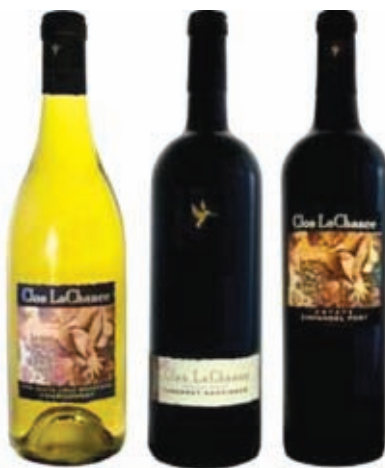
Clos LaChance produces wines in The Special Selection Series, The Estate Series, and The Hummingbird Series