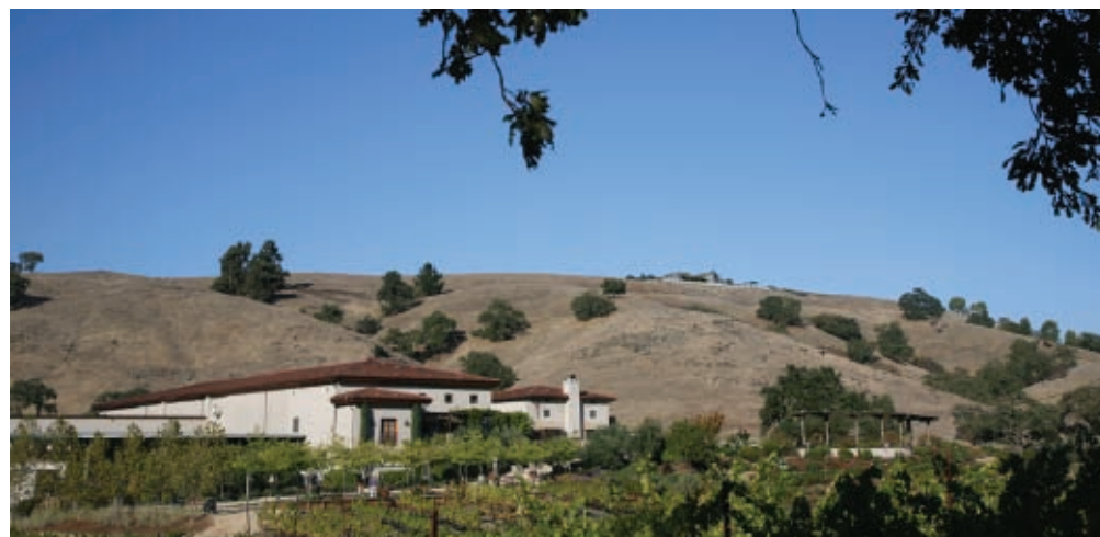
Clos LaChance Winery and Estate Vineyard is located in San Martin, California