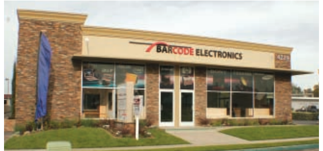
Barcode Electronics is located at 4229 Birch St. in Newport Beach

After comparing our prices to others, our customers see that we offer the ideal combination of value and support. When it comes to our service center, even if a computer is out of warranty, we will provide you with a price estimate with a specific completion date before proceeding with any work. Tired of waiting a week for extra hardware to be installed? Barcode Electronics offers quick turnaround times for upgrades on all desktops and laptops.