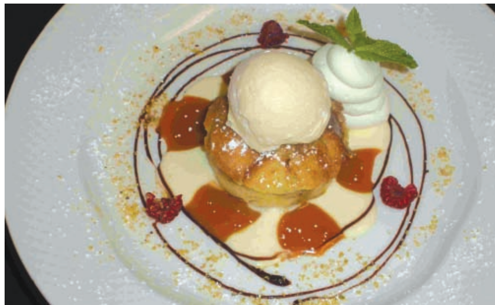
Enjoy seasonal desserts such as the delectable Pear Almond Torte