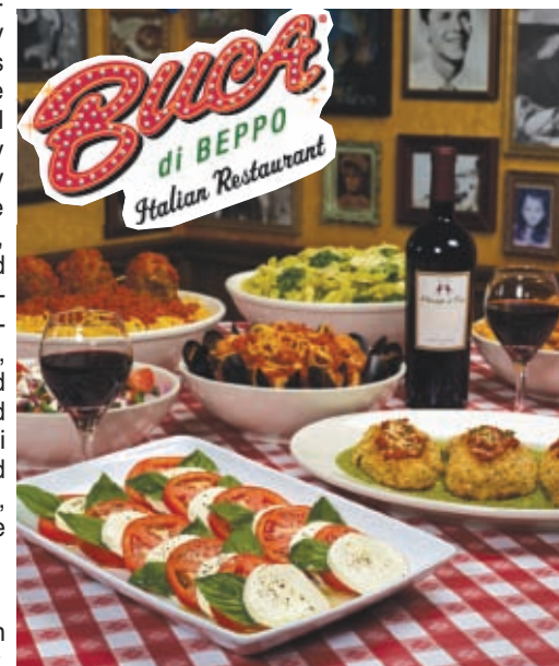
Enjoy Buca di Beppo's inspired Northern and Southern Italian cuisine

Visit the Buca di Beppo website at www.bucadibeppo.com .