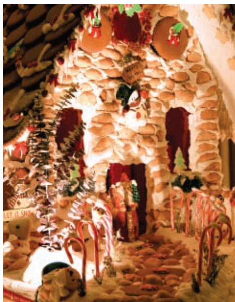
Holiday guests will delight at the 200-lb. Gingerbread House

Please visit our web site for all the details at www.balboabayclub.com , or call (949) 645-5000.