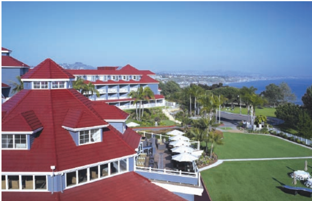
Spectacular coastal view of Dana Point from the newly renovated Laguna Cliffs Marriott Resort & Spa.

With something to satisfy every taste Laguna Cliffs Marriott Resort & Spa offers two dining options with VUE and OverVue. The award-winning restaurant VUE has a diverse menu, giving a local flair to a number of traditional favorites. A rich and varied wine list and an elegant yet casual atmosphere complete the dining experience. Dining is available for breakfast,