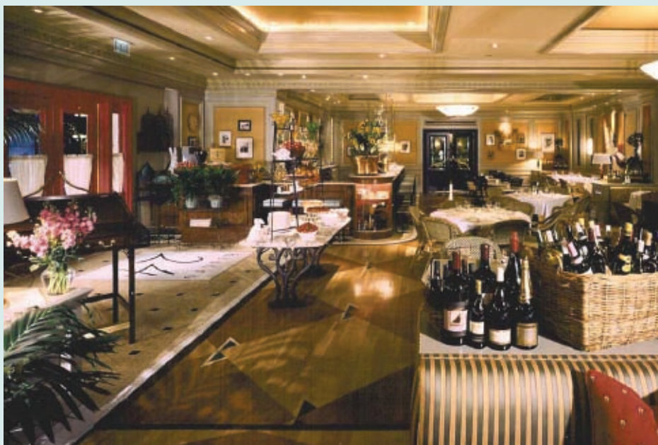
Ritz Carlton Bistro 24, Phoenix, Arizona