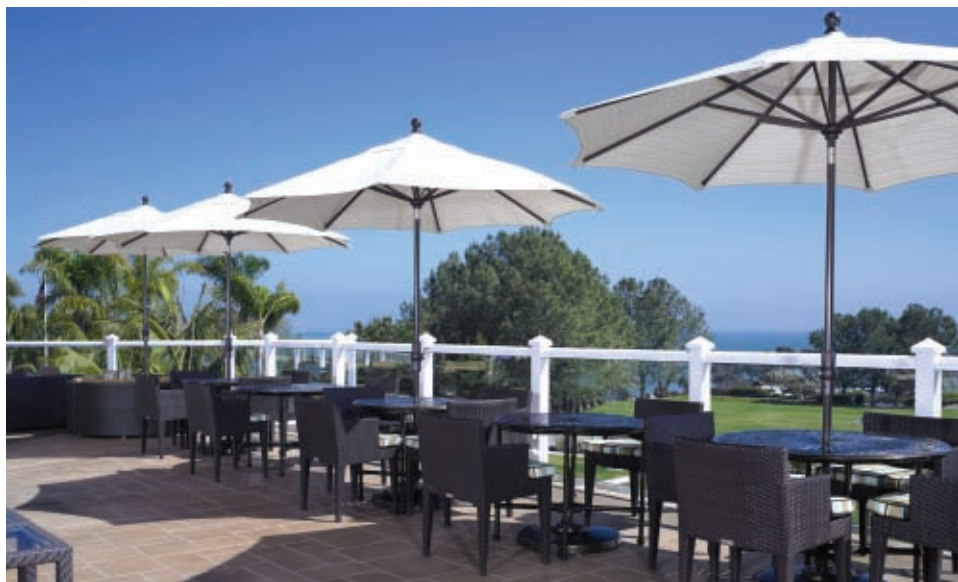
Kollin Altomare Architects are the architects of record for the Laguna Cliffs Marriott Resort & Spa