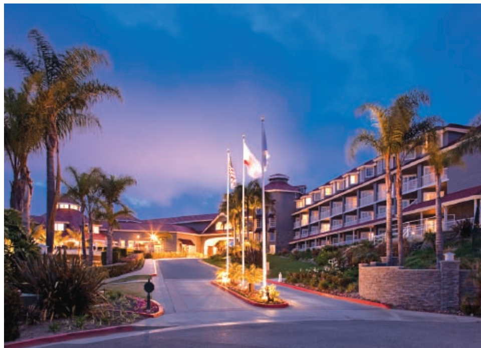
Laguna Cliffs Marriott Resort &amp; Spa