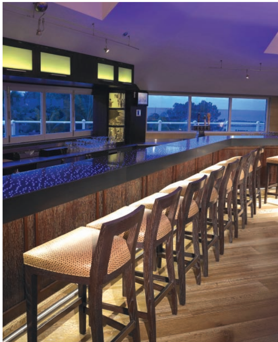
The OverVue Lounge & Bar