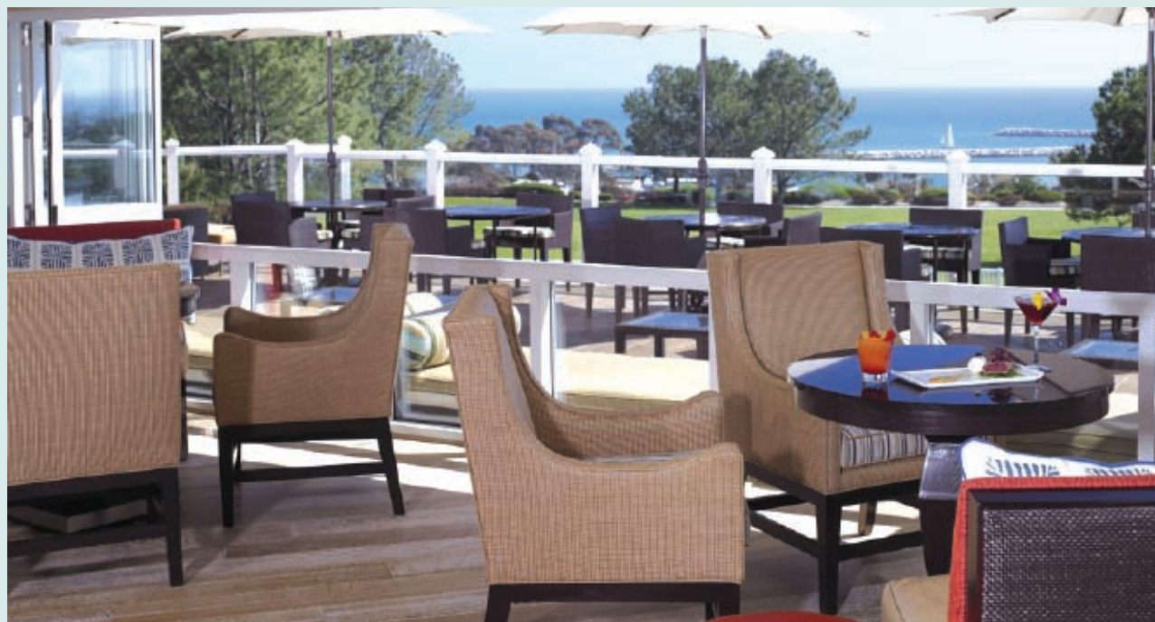
Enjoy indoor and outdoor seating and one of the best sunset views in Orange County at the new OverVue Lounge & Deck.

Laguna Cliffs Marriott Resort & Spa is located in one of the most picturesque natural surroundings in the country, so it is appropriate that the resort embody a spirit of environmental responsibility. Being a good corporate citizen, with a comprehensive program to ensure eco-friendly business practices is a hallmark of Laguna Cliffs Marriott Resort & Spa.