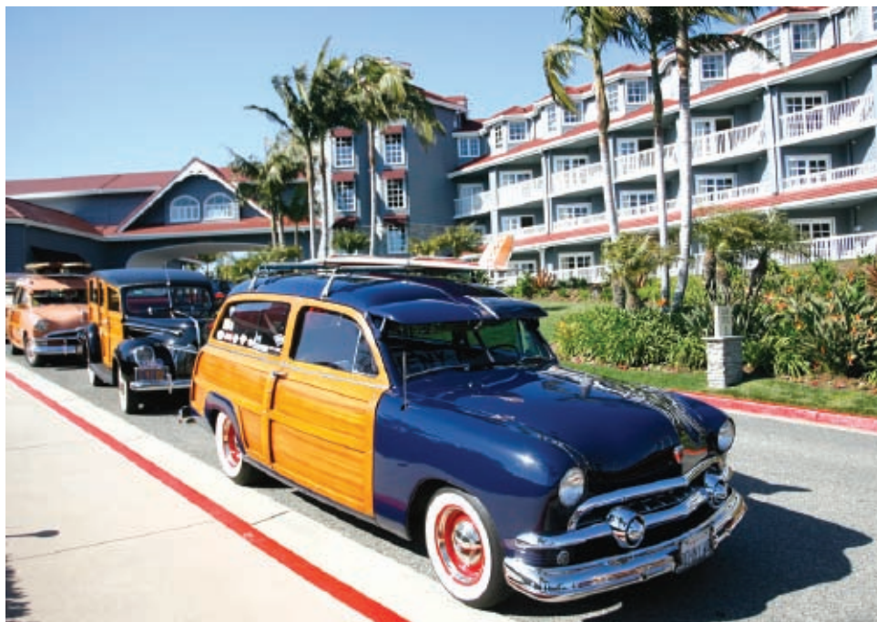
Procession of vintage surf "Woodies" courtesy of the South Coast Woodie Club mark the completion of Laguna Cliffs Marriott Resort & Spa on Friday, April 30 2010.