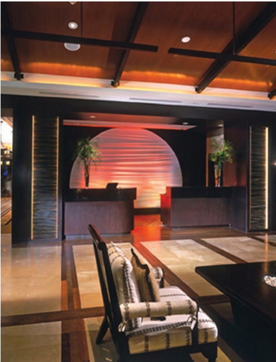
The solar-influenced lobby reception area at the Solamar Hotel

Intra-Spec is dedicated to maintaining a close, direct working relationship with our client, creating a sophisticated design without overstepping the budgetary parameters of the project. We are committed to meeting our client's prescribed schedule and individual needs. You may find our full portfolio and further information about our design team at www.intra-spec.com , or feel free to call our offices for further information at 310-821-0376.