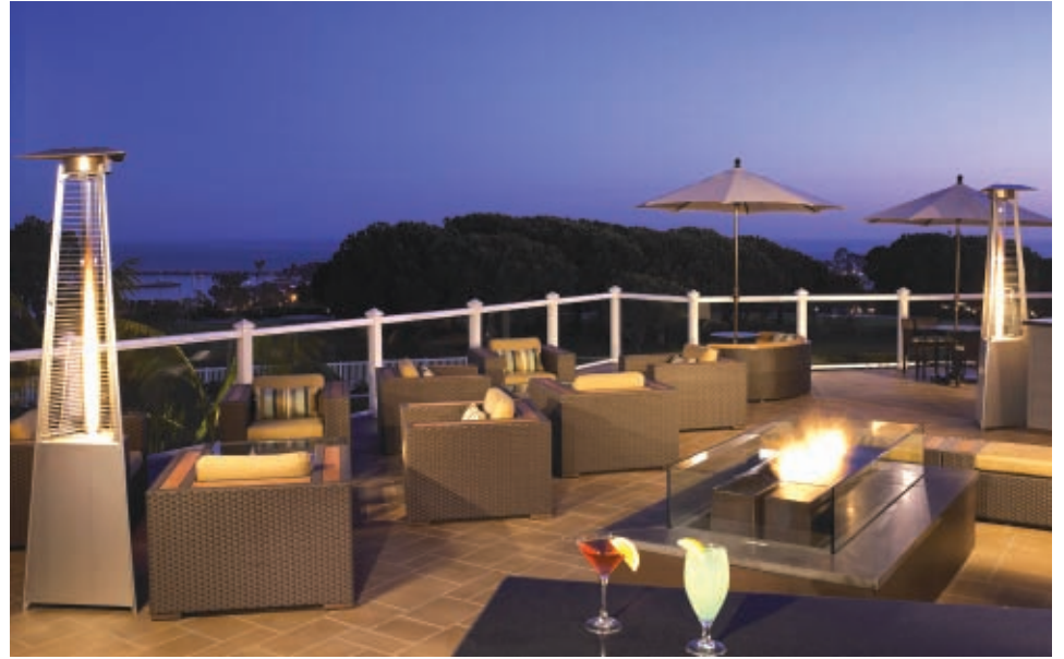
From arrival to departure, guests enjoy the newly designed marble lobby with waterfall and outdoor OverVue Deck.