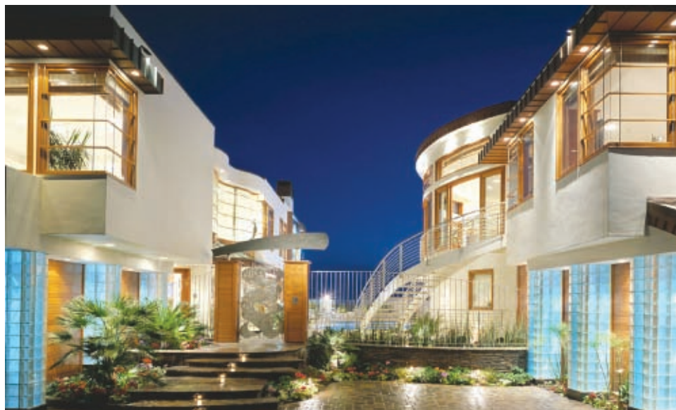
The Blumenthal Residence, Newport Beach, California