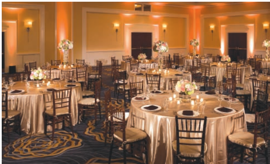
The Richard Henry Dana Ballroom at Laguna Cliffs Marriott Resort & Spa