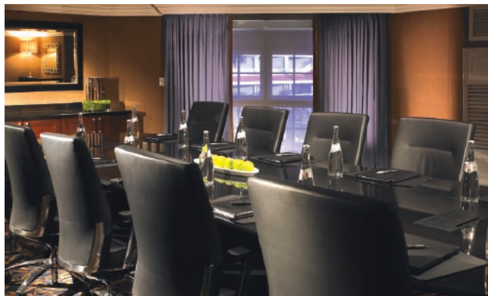
Intra-Spec Hospitality Design was responsible for the new interior design of the entire resort