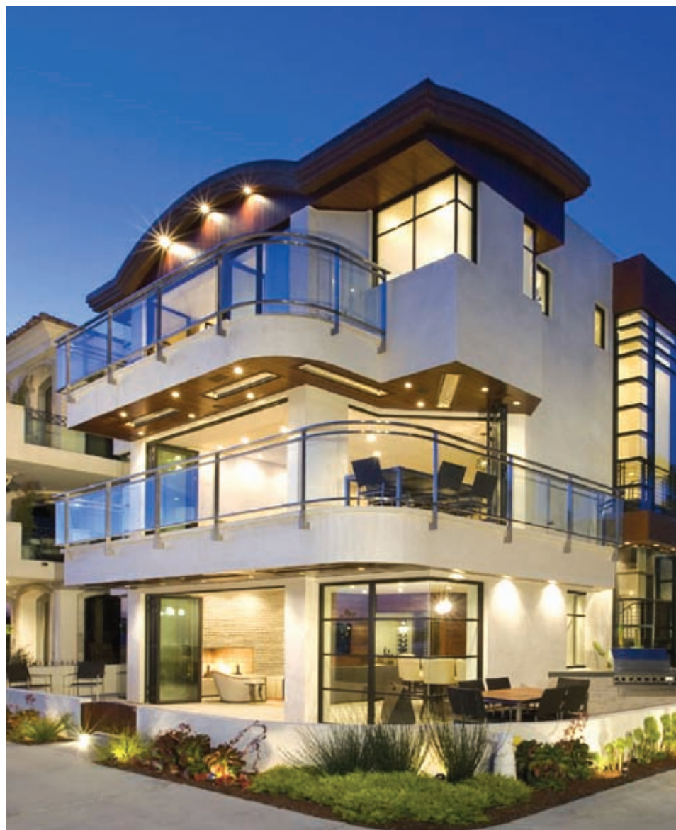
The Pratto Residence, Long Beach, California