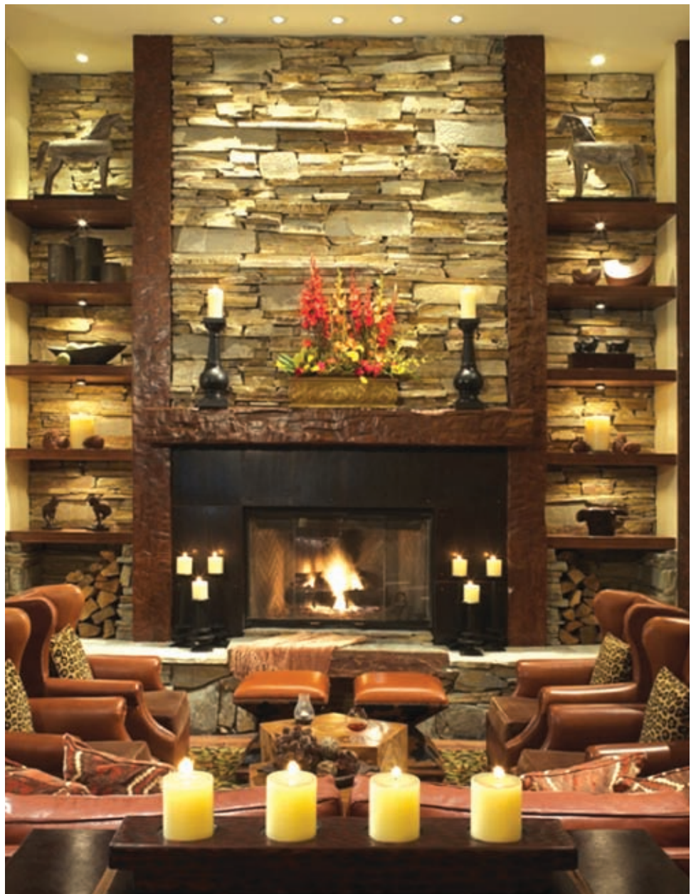
Lake Arrowhead Resort & Spa's contemporary lodge-style living room