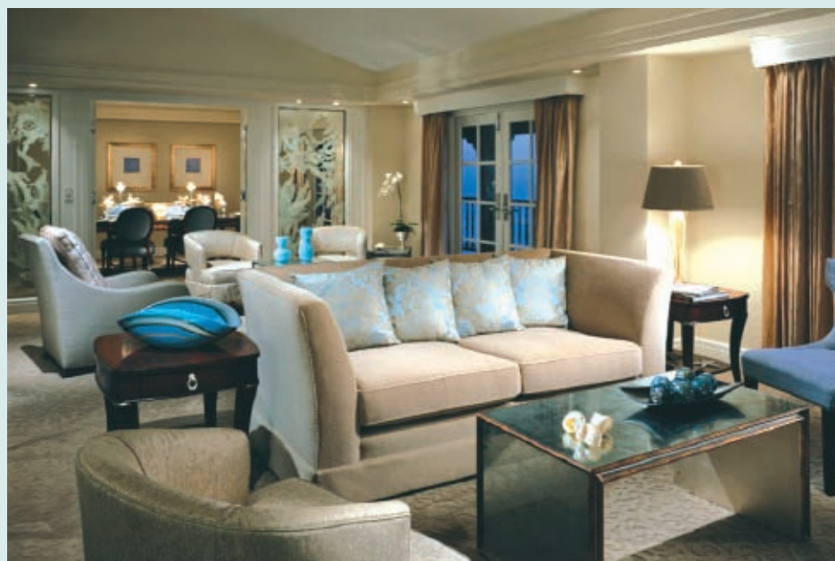
Ritz Carlton Presidential Suite, Dana Point, California