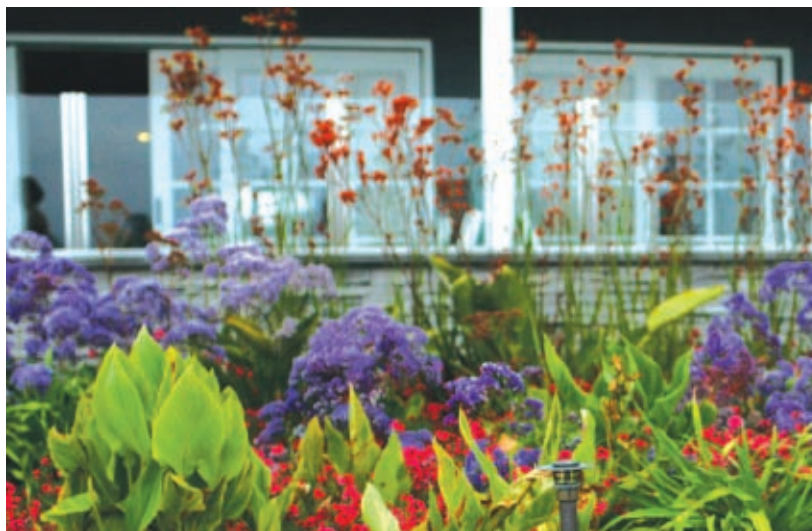
The Laguna Cliffs Marriott Resort & Spa has implemented a comprehensive green initiative which includes landscaping with plants that are not only beautiful but indigenous and require little or no watering.

Laguna Cliffs has installed energy efficient light bulbs through the resort, including low energy CFLs for the property in all public spaces, parking structures, back of house, offices, meeting space and all guestrooms wherever possible. The resort's exterior lighting uses photo cell sensors that adjust to control proper light levels at all times during the day while being energy efficient. Also, the public spaces and guestroom windows are all energy efficient insulated glass.