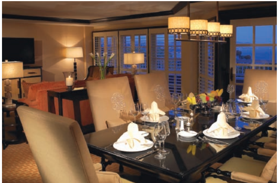
Laguna Cliffs Marriott Resort & Spa features luxurious renovated rooms and suites, most with ocean views.