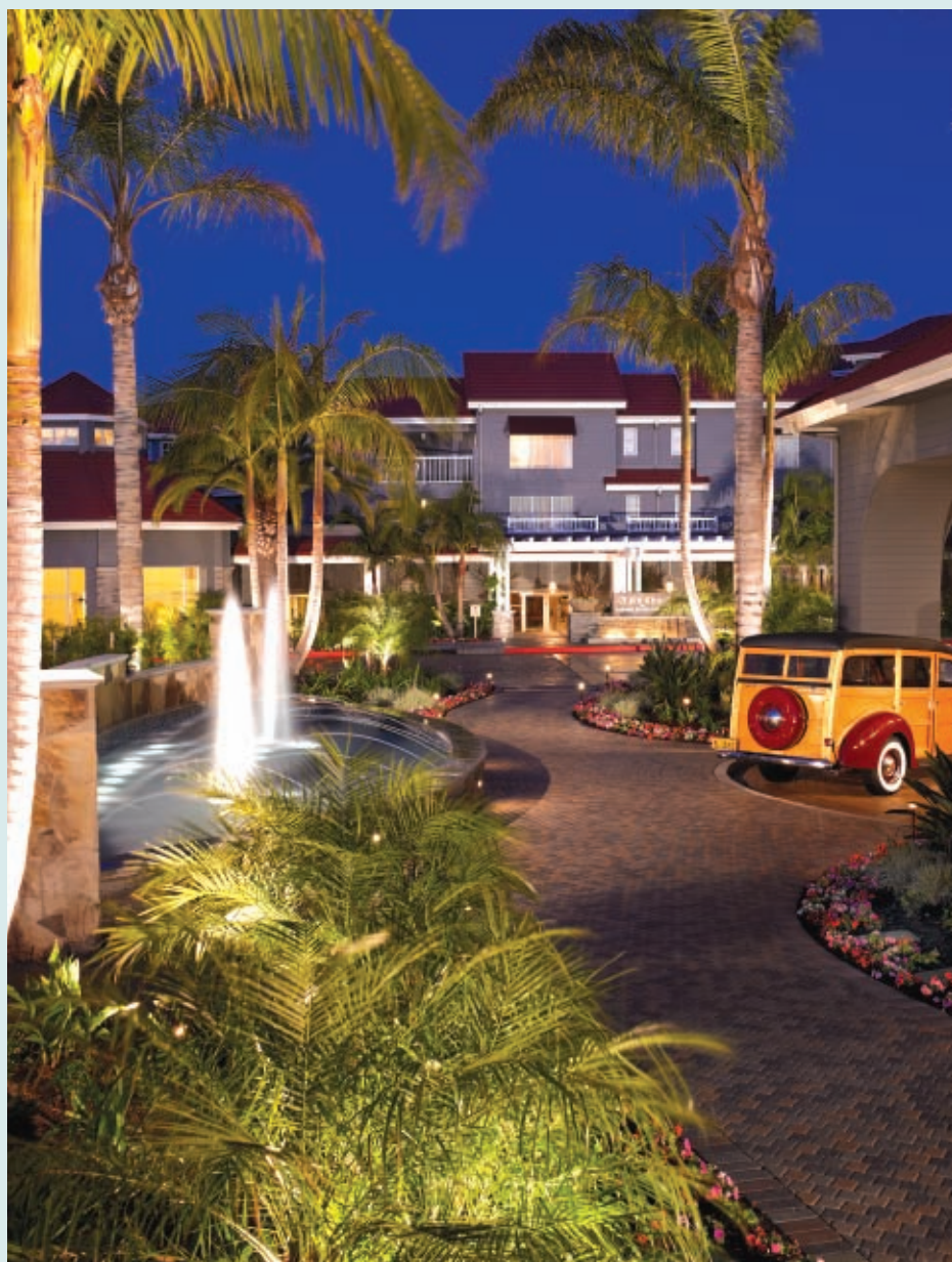
An entirely new entry, complete with vintage 1940 Ford Woodie, welcomes guests with new fountains, lighting and landscaping