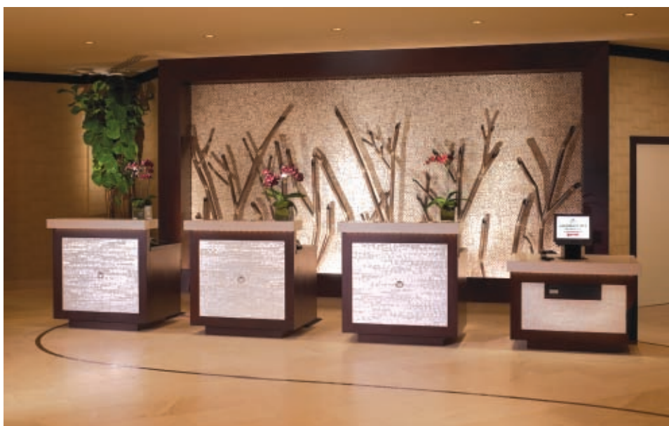
Lobby at the Laguna Cliffs Marriott Resort &amp; Spa