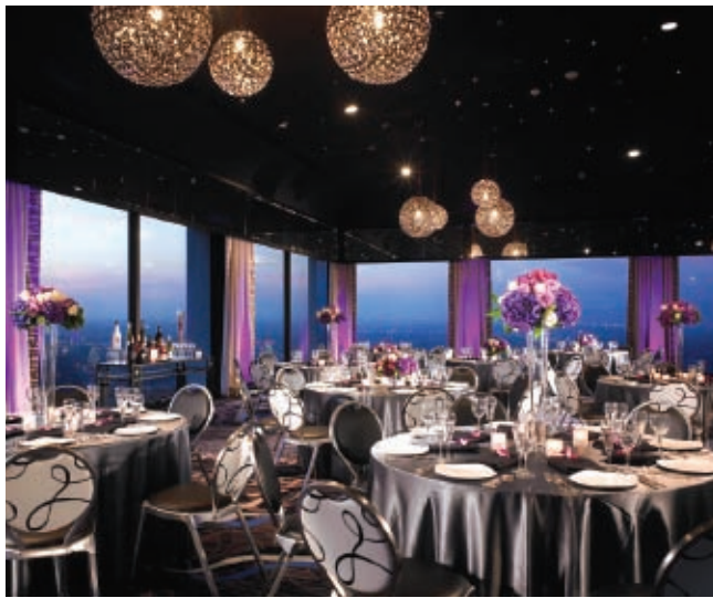
The glamorous rooftop Starview Room at the Sheraton Universal Hotel