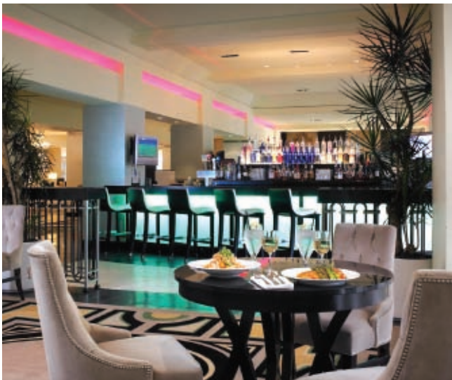
Sheraton Universal's lobby lounge, featuring a backlit elliptical bar