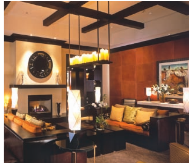
The Solamar Hotel's warm and inviting lobby lounge