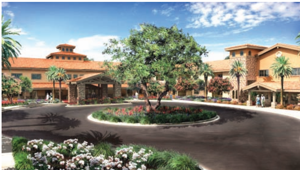
Valencia Terrace features 22 private casitas and 129 independent living apartment homes.

With a high priority on senior fitness, residents will enjoy many resort-style services and amenities, including professional training in a state-of-