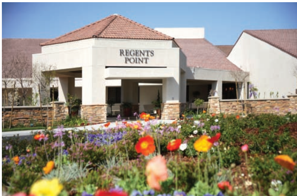
Front entryway at Regents Point