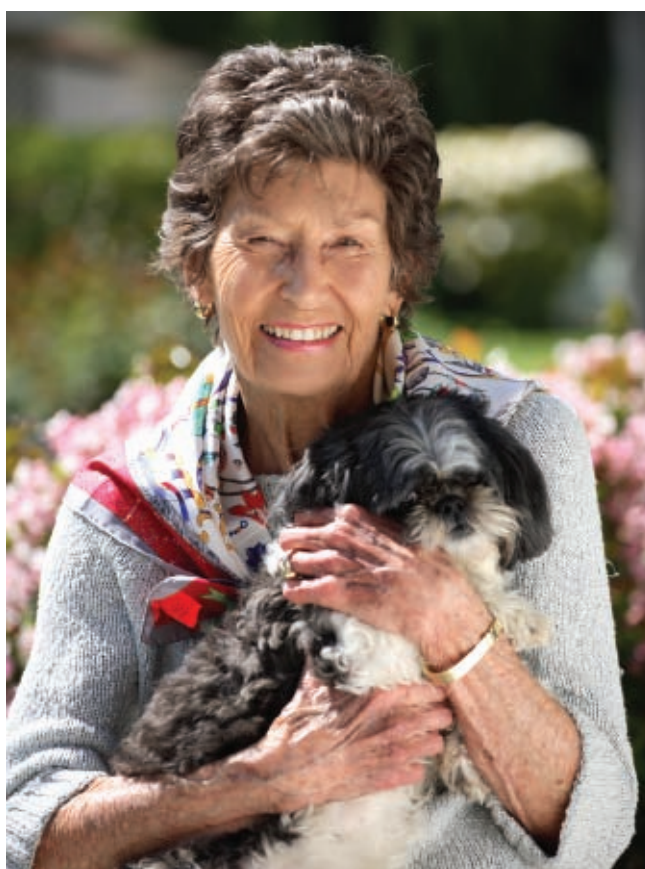
Regents Point is pet friendly

Regents Point is owned and operated by Southern California Presbyterian Homes, which is a not-for-profit corporation.