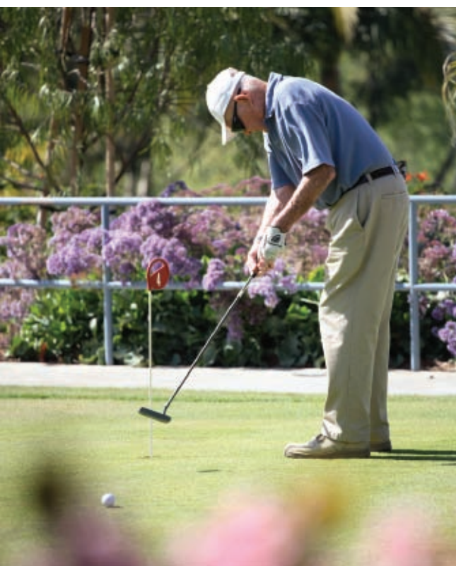
Residents have access to many activities and amenities, including an on-site putting green