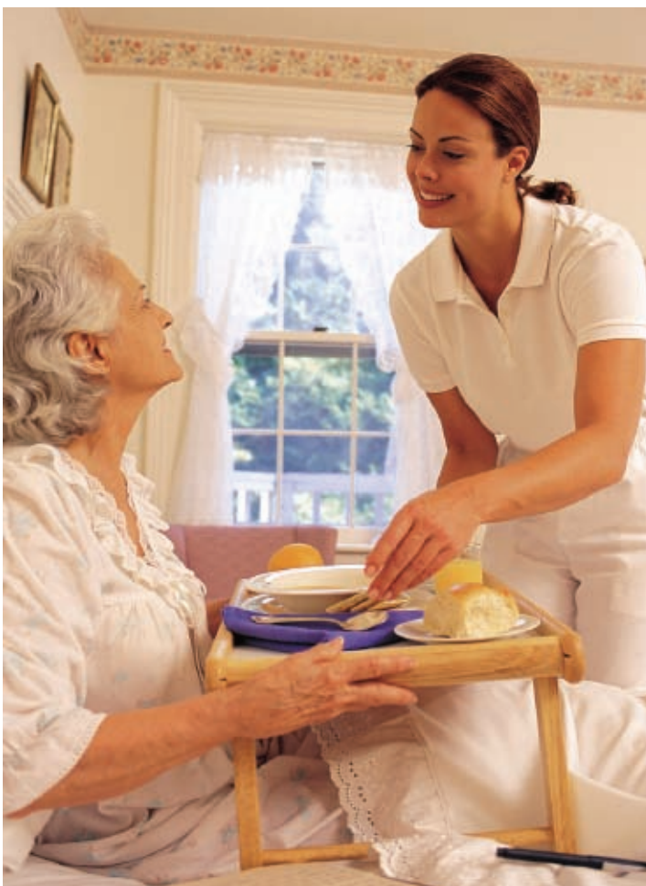
AccentCare embraces the idea that the caregiver will become part of your extended family. To ensure peace of mind to both clients and patients, AccentCare employs rigorous hiring and training criteria.

is another. AccentCare embraces the idea that the caregiver will become part of your extended family. To ensure peace of mind to both clients and patients, AccentCare employs rigorous hiring and training criteria.