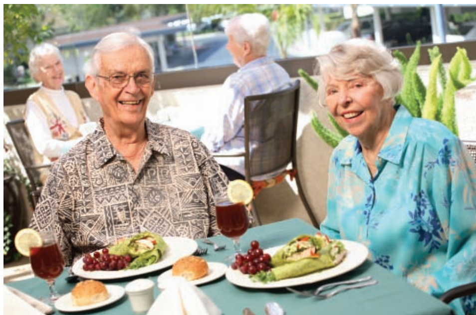
Residents enjoy patio dining at The Bistro