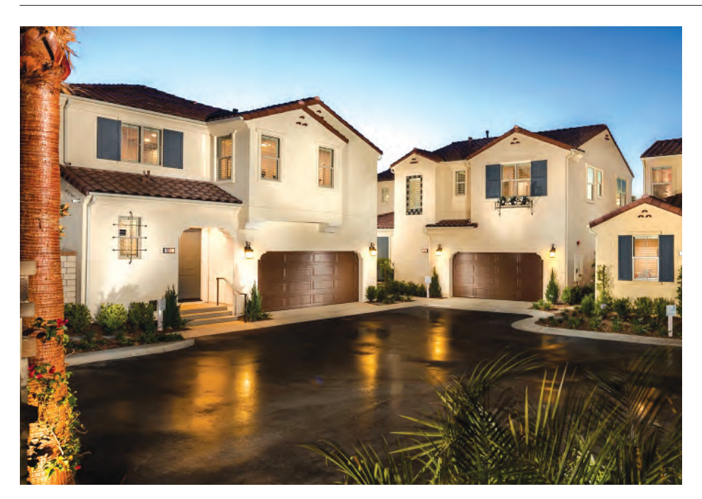
Westgate development by Christopher Homes