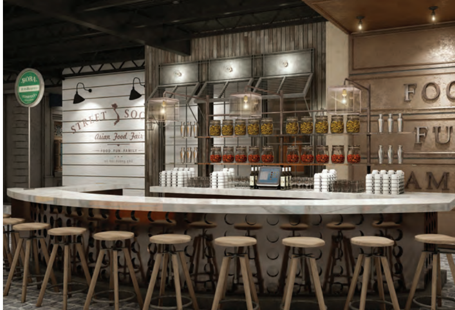
Proposed interior of the new Streat Society Food Hall, courtesy of Bridgecreek Development

also saw the launch of a new Movie in the Park event, featuring Disney's Moana and attended by 600 people. The Spring Festival features live entertainment, delicious food, children's games and attractions, and special visit by the Easter Bunny. The 25-year tradition of the Dia de la Familia festival celebrates families with food, music, and dancing. Annual holiday favorites include Halloween at the Mall, Breakfast with Santa, the Tree Lighting Ceremony and Community Sing, and a trip to the Rose Parade. Other community outings and activities occur each year, such as the Relay for Life, which gives residents a chance to have fun and support each other.