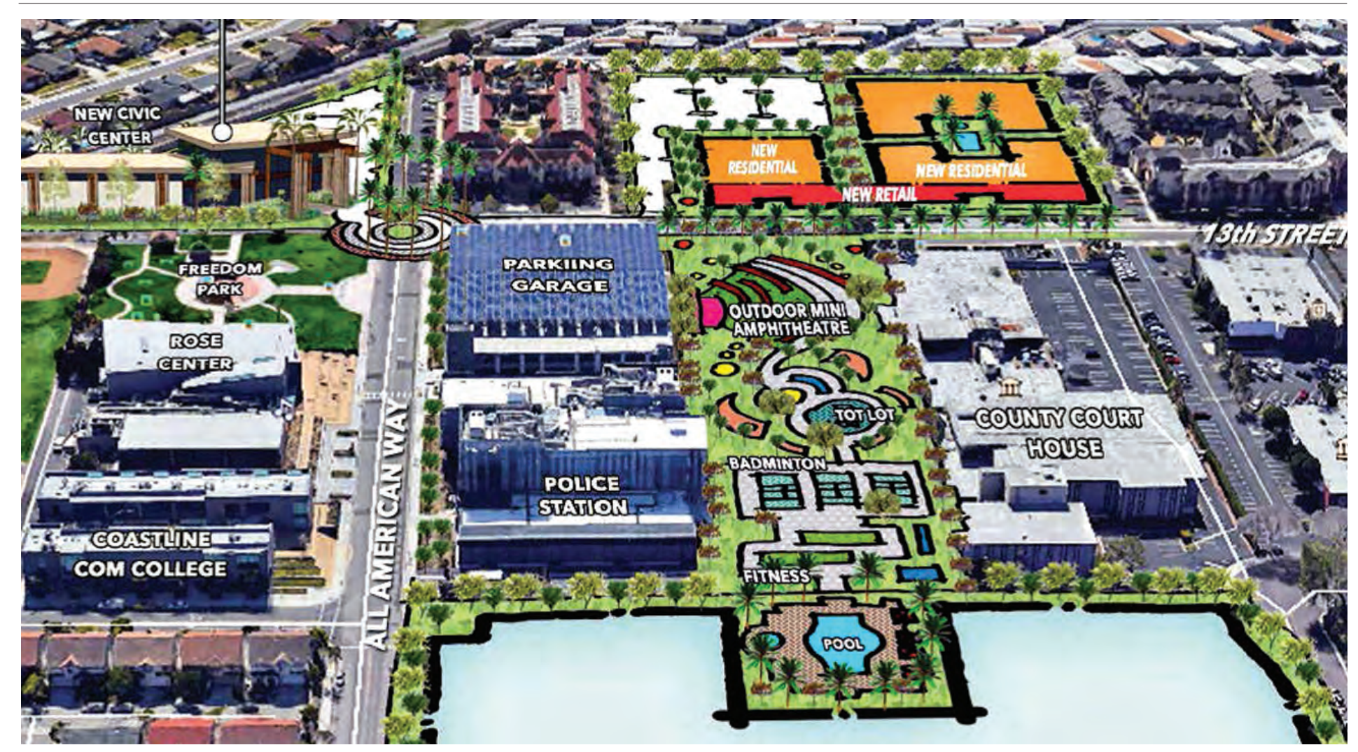
A redevelopment option for the Civic Center

Mall property owners and the City have initiated a path forward that will invigorate the site, benefit property owners, and achieve the community's vision.