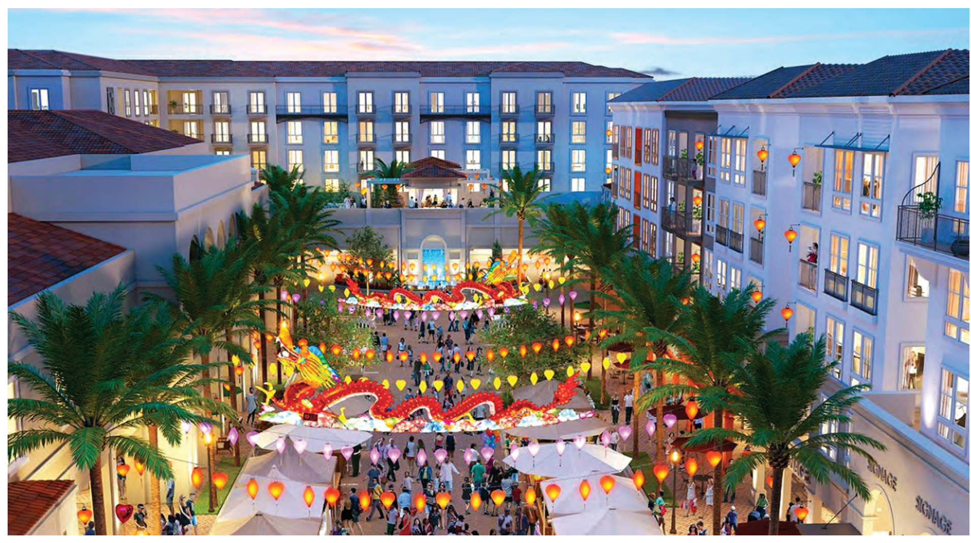
Rendering of Bolsa Row project