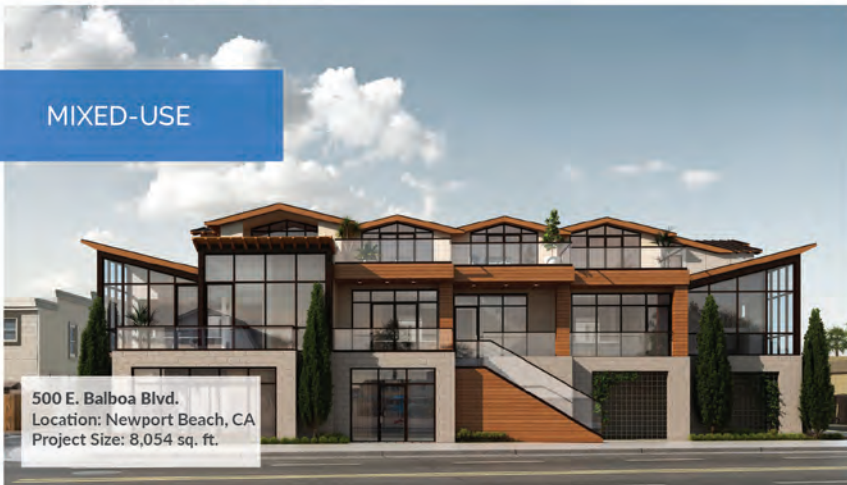
500 E. Balboa Blvd. Location: Newport Beach, CA Project Size: 8,054 sq. ft.