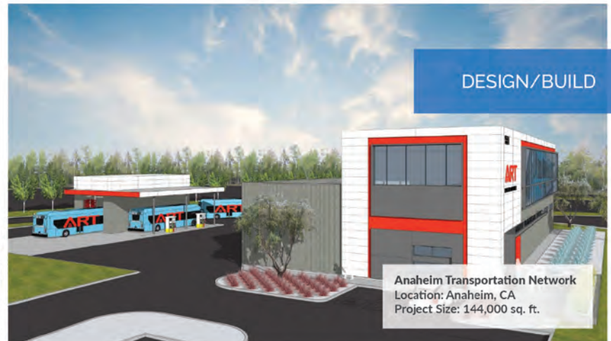
Anaheim Transportation Network Location: Anaheim, CA Project Size: 144,000 sq. ft.